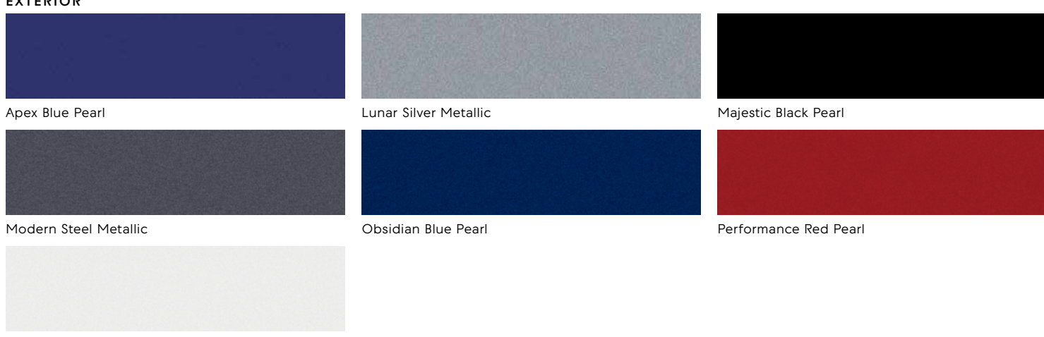
Platinum White Pearl