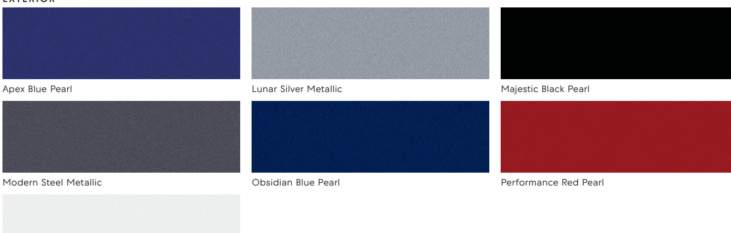
Platinum White Pearl