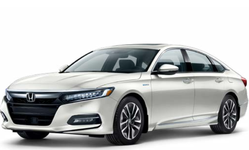
White Orchid Pearl