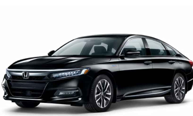
Crystal Black Pearl