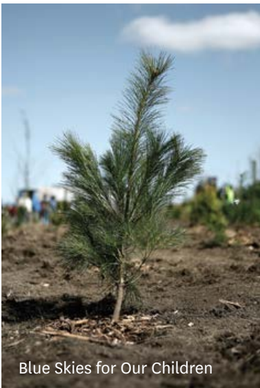
Blue Skies for Our Children