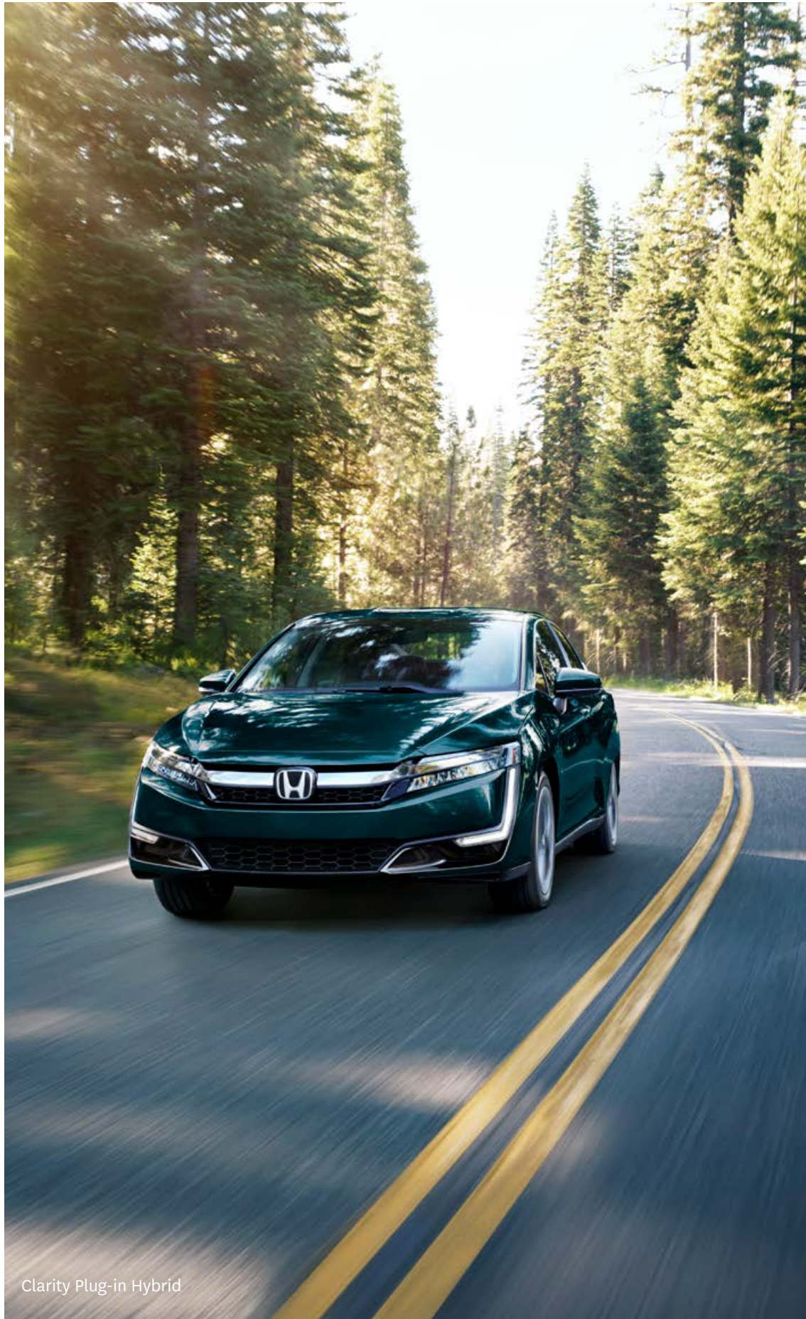
Clarity Plug-in Hybrid