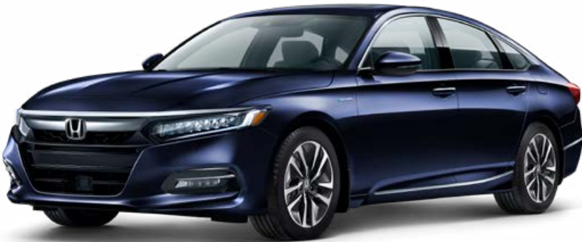
Obsidian Blue Pearl