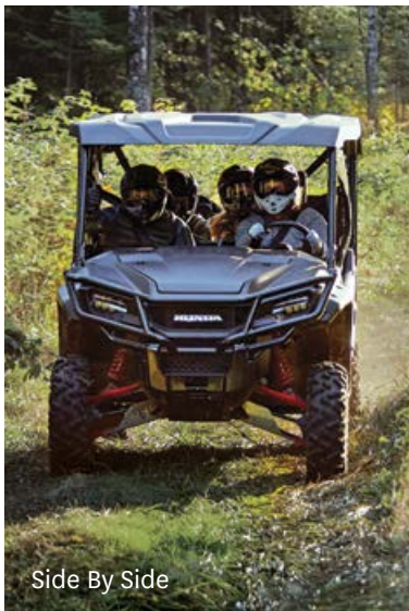
Side By Side