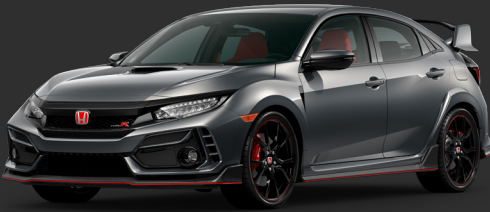
Polished Metal Metallic