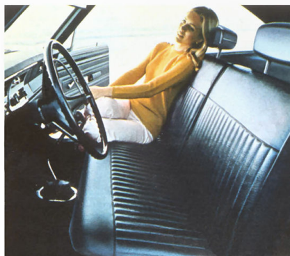
This Dart Swinger color is "Banana," 'cause it stands out from the bunch.