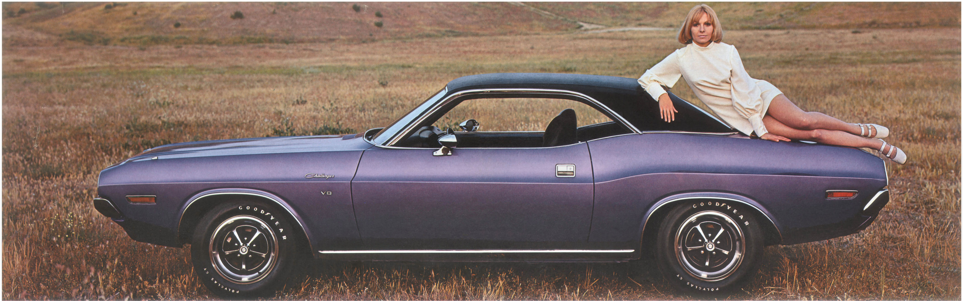
You'll go plum crazy over this new Challenger color. It's "Plum Crazy."