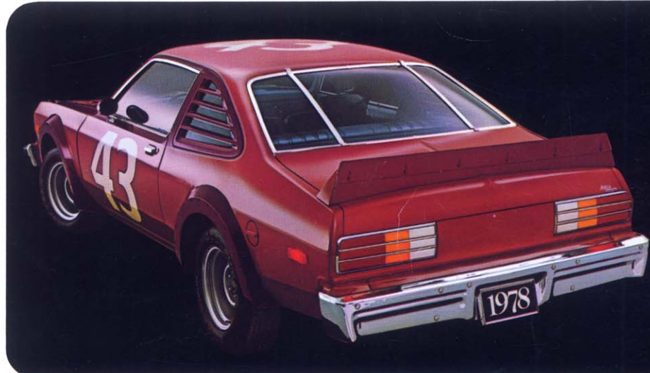
Rear deck ducktail spoiler.