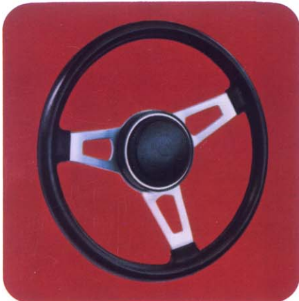
Tuff steering wheel.