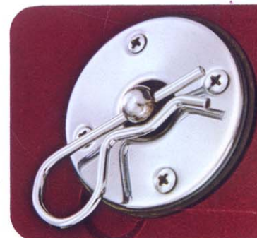
Decorative hood pins.