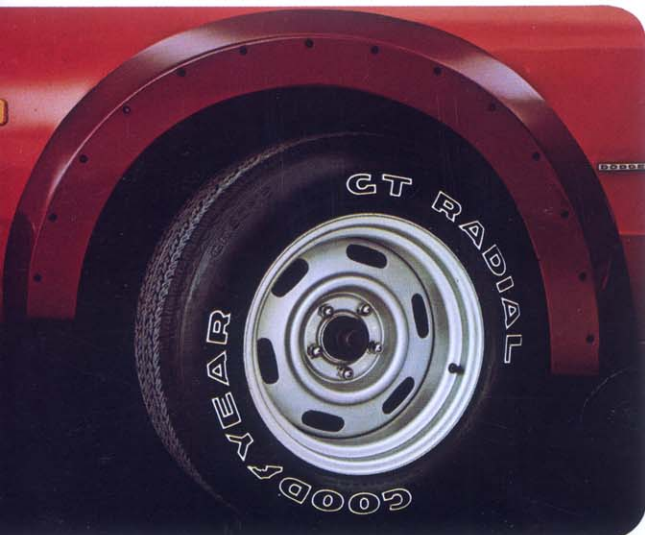
Wheel opening flares and 15x8 road wheels.