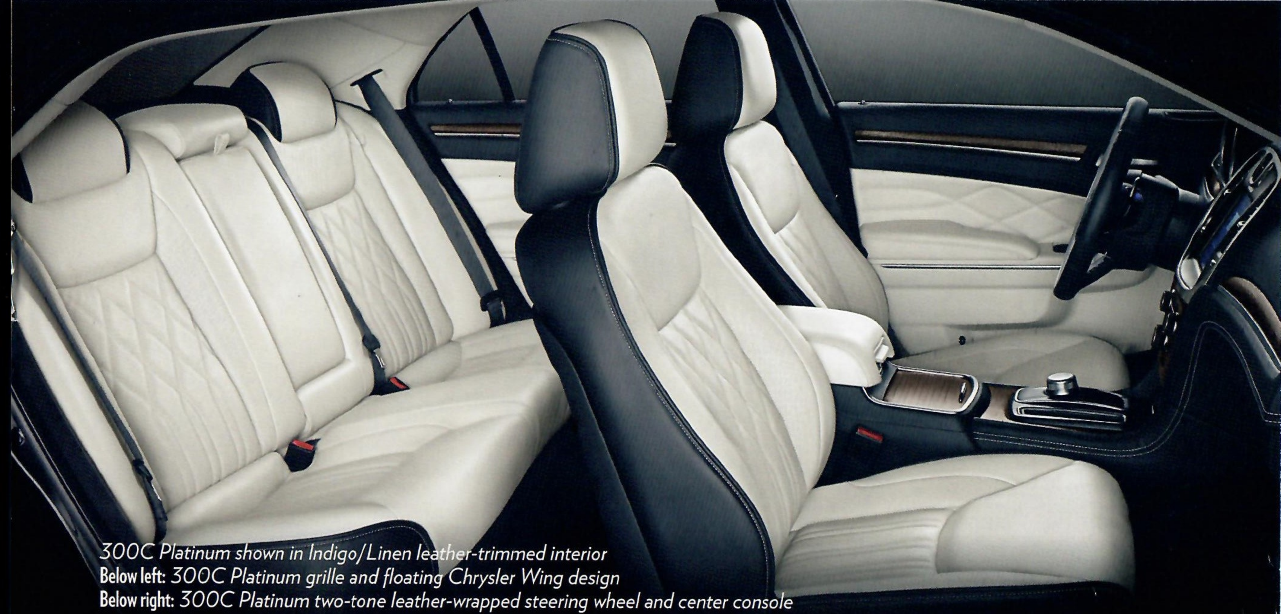
300C Platinum shown in Indigo/Linen leather-trimmed interior Below left: 300C Platinum grille and floating Chrysler Wing design Below right: 300C Platinum two-tone leather-wrapped steering wheel and center console