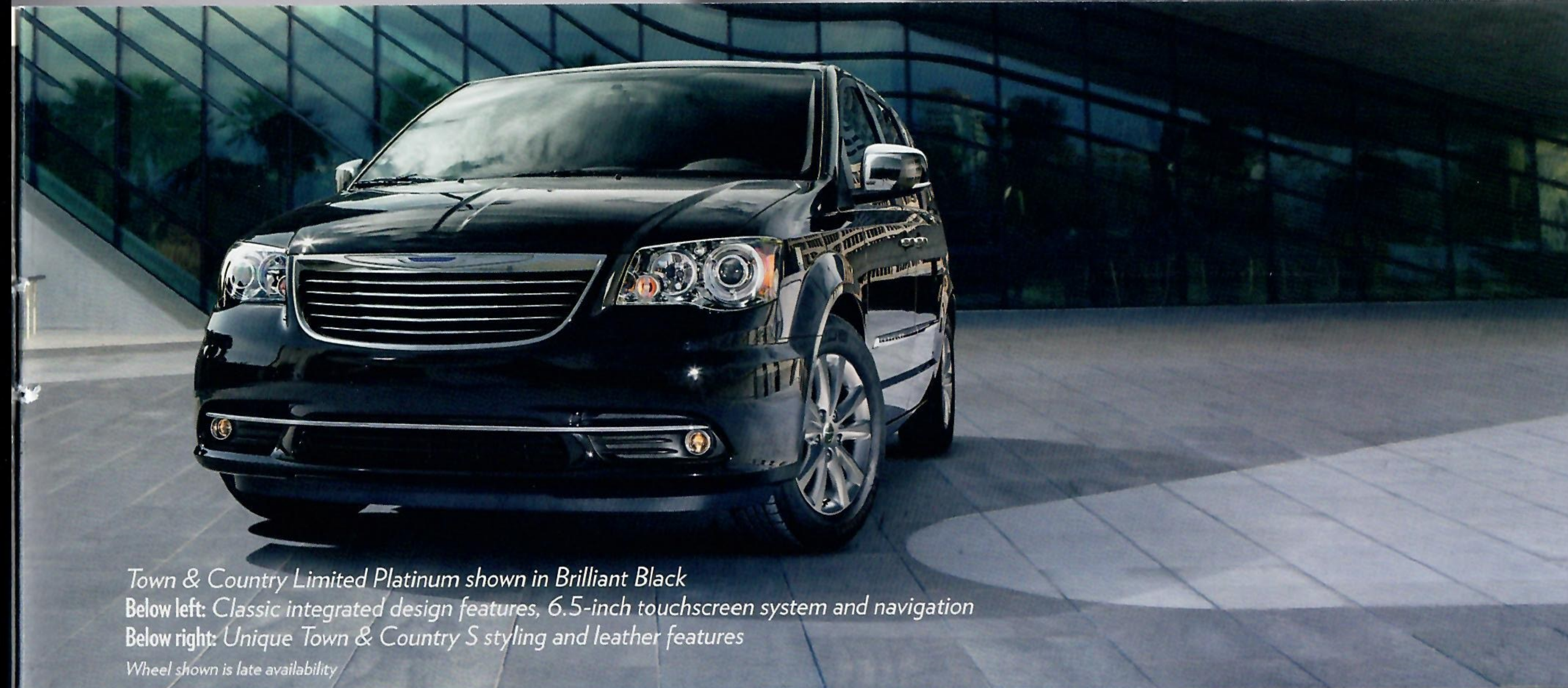
Town & Country Limited Platinum shown in Brilliant Black Below left: Classic integrated design features, 6.5-inch touchscreen system and navigation Below right: Unique Town & Country S styling and leather features Wheel shown is late availability