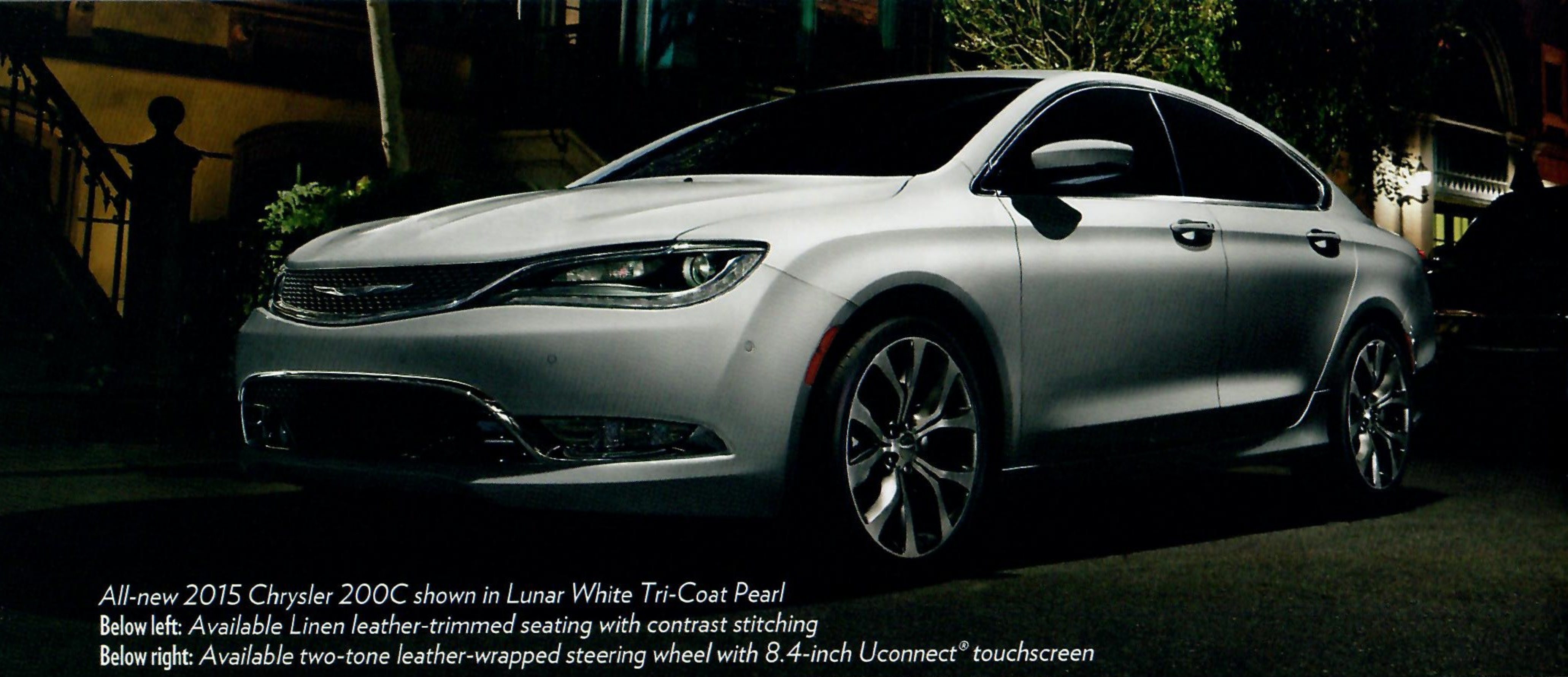
All-new 2015 Chrysler 200C shown in Lunar White Tri-Coat Pearl