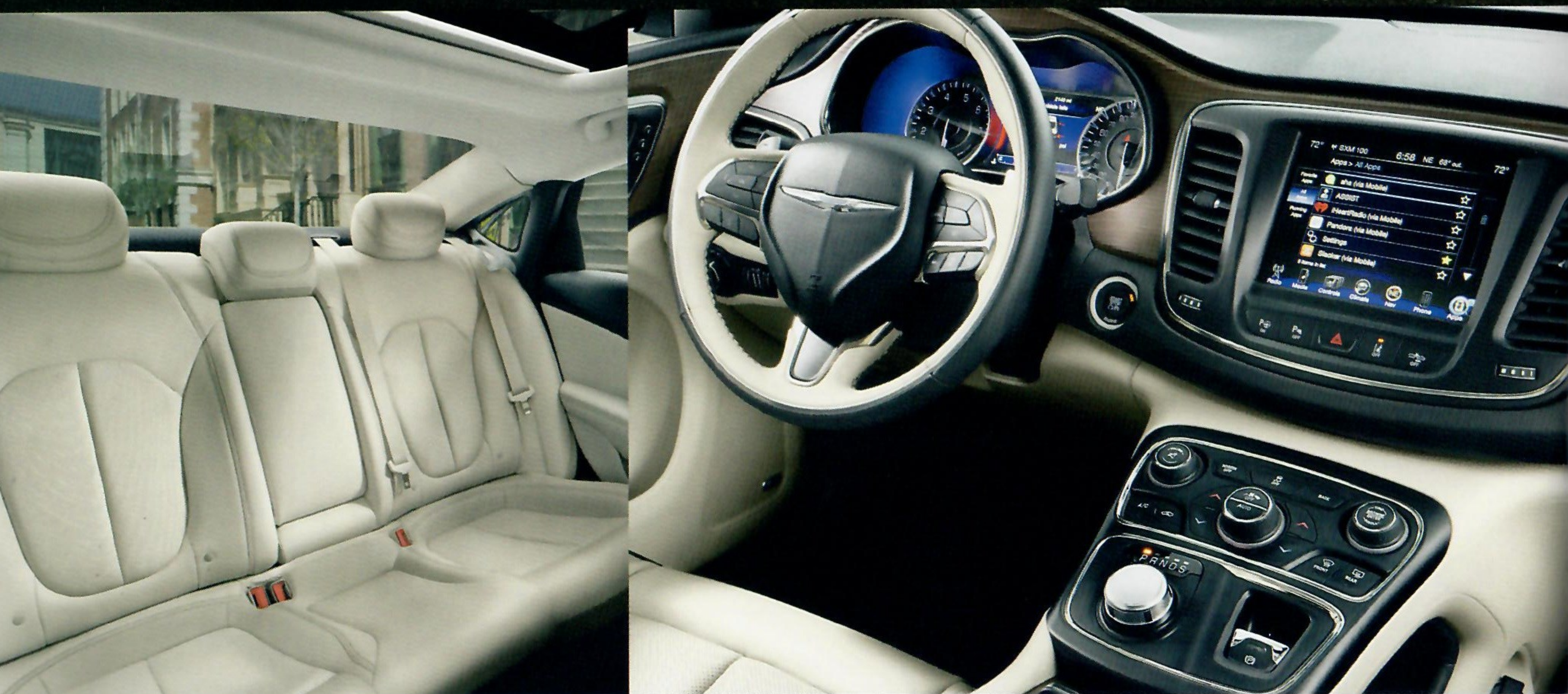
Below right: Available two-tone leather-wrapped steering wheel with 8.4-inch Uconnect® touchscreen