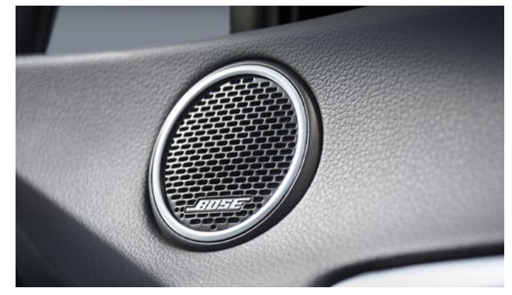
Available Bose® premium audio with 12 speakers

Make the most of your drive with seamless connectivity offered by Apple CarPlay<sup>™</sup> and Android Auto<sup>™</sup>. The available high-definition 10.25" touch-screen display offers intuitive smartphone mirroring to access your favourite apps, as well as multiple viewpoints with the 360-degree Surround View Monitor for ease in tight spaces. An available Bose® premium 12-speaker sound system provides the ultimate immersive experience for your favourite music.