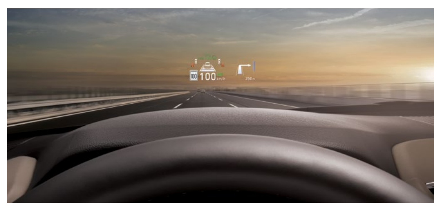
Available Head-Up Display