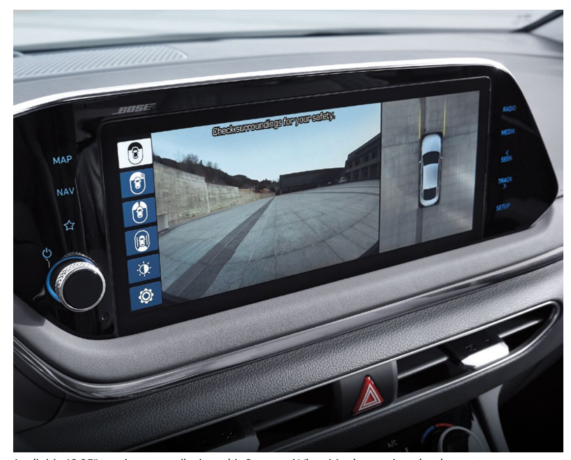
Available 10.25" touch-screen display with Surround View Monitor and navigation system