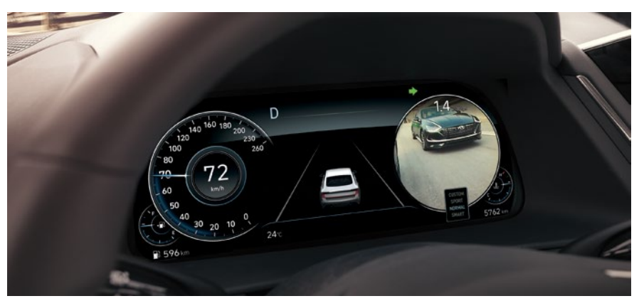
Available 12.3" full digital instrument cluster with Blind View Monitor

Finally, the all-new Sonata features the segment's first Remote Smart Parking Assist system<sup>3</sup>. This driver assistance technology allows you to remotely move the Sonata when you are outside of the vehicle, a convenient feature when you have passengers or if you have luggage to load in a tight area. Simply use the key fob to move the Sonata forward or backward, into or out of the parking space.