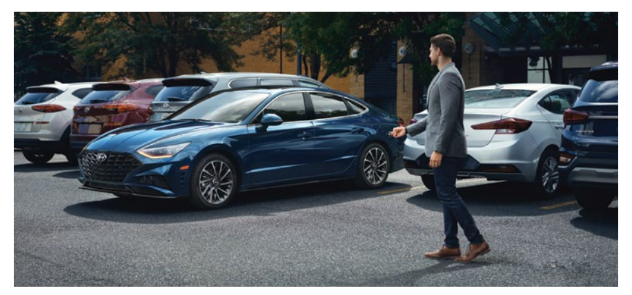
Available Remote Smart Parking Assist