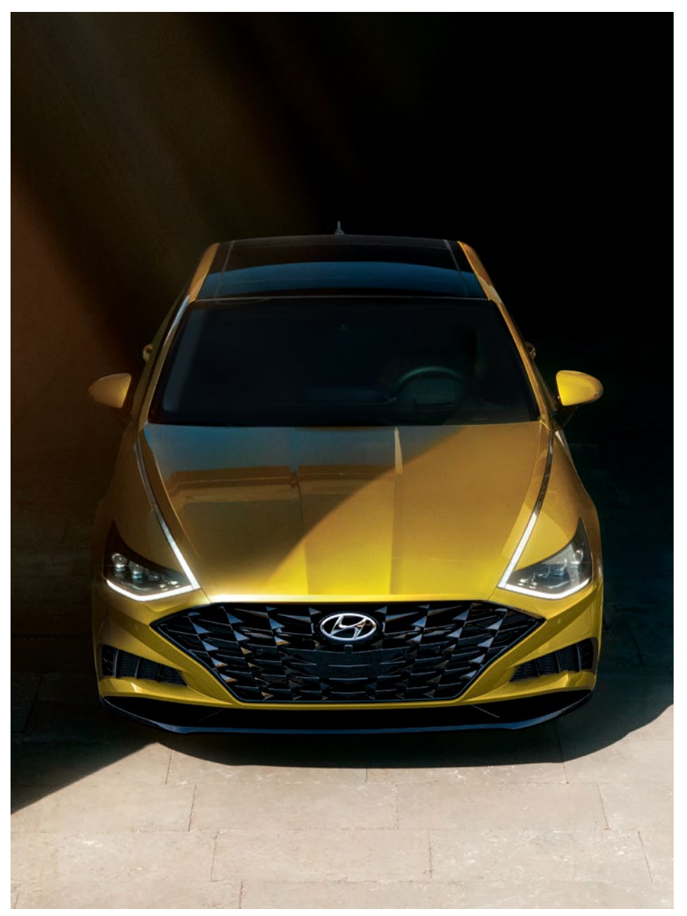
Hidden innovation. Our engineers created an unmistakable lighting signature unique to the Sonata that incorporates the very latest in lighting technology. Formed to the Sonata's body, the hidden LED daytime running lights appear chrome when turned off, and then dramatically brighten when turned on.