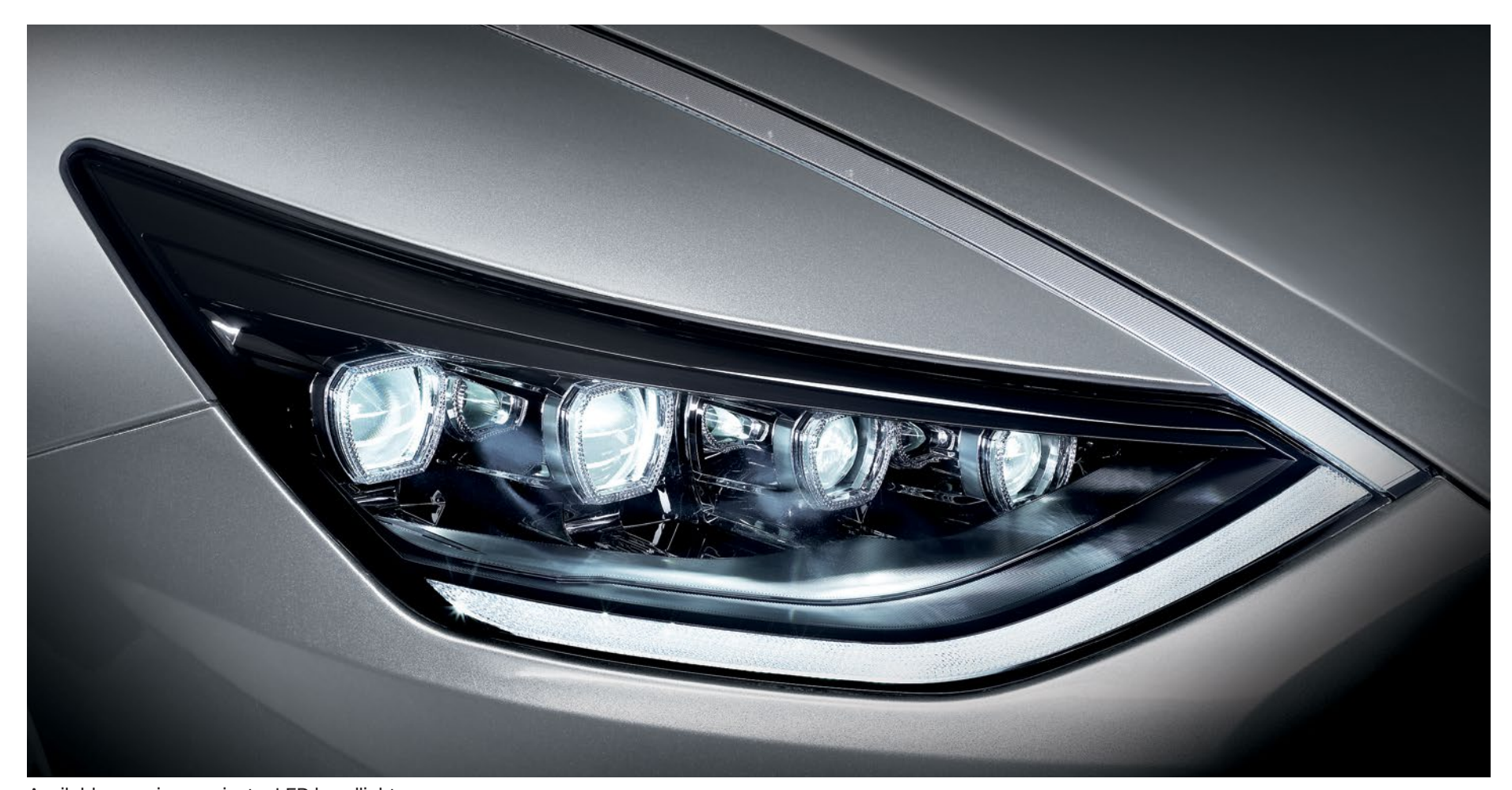
Available premium projector LED headlights