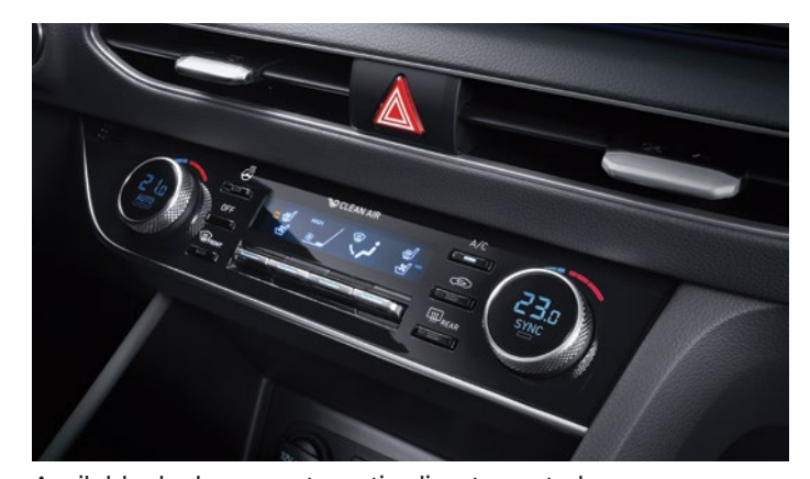
Available dual-zone automatic climate control