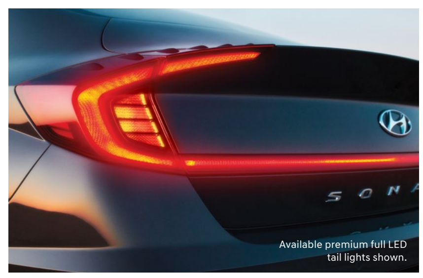
Make an impression every night. The wide, horizontal LED tail lights at the rear of the Sonata connect to the brake lights on each side, creating a striking visual design at night.

The all-new Sonata embraces the aggressive curves and sharp lines of a 4-door coupe while delivering a sleek and modern cabin designed around your every need. Filled with state-of-the-art technology and safety, settle into the driver's seat and experience a new way to take in all your important information with the available 12.3" full digital LCD gauge cluster and take the wheel with confidence knowing you're surrounded by an impressive suite of standard and available Hyundai SmartSense™ safety technologies.