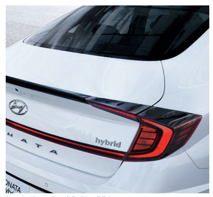
Standard premium full LED tail lights