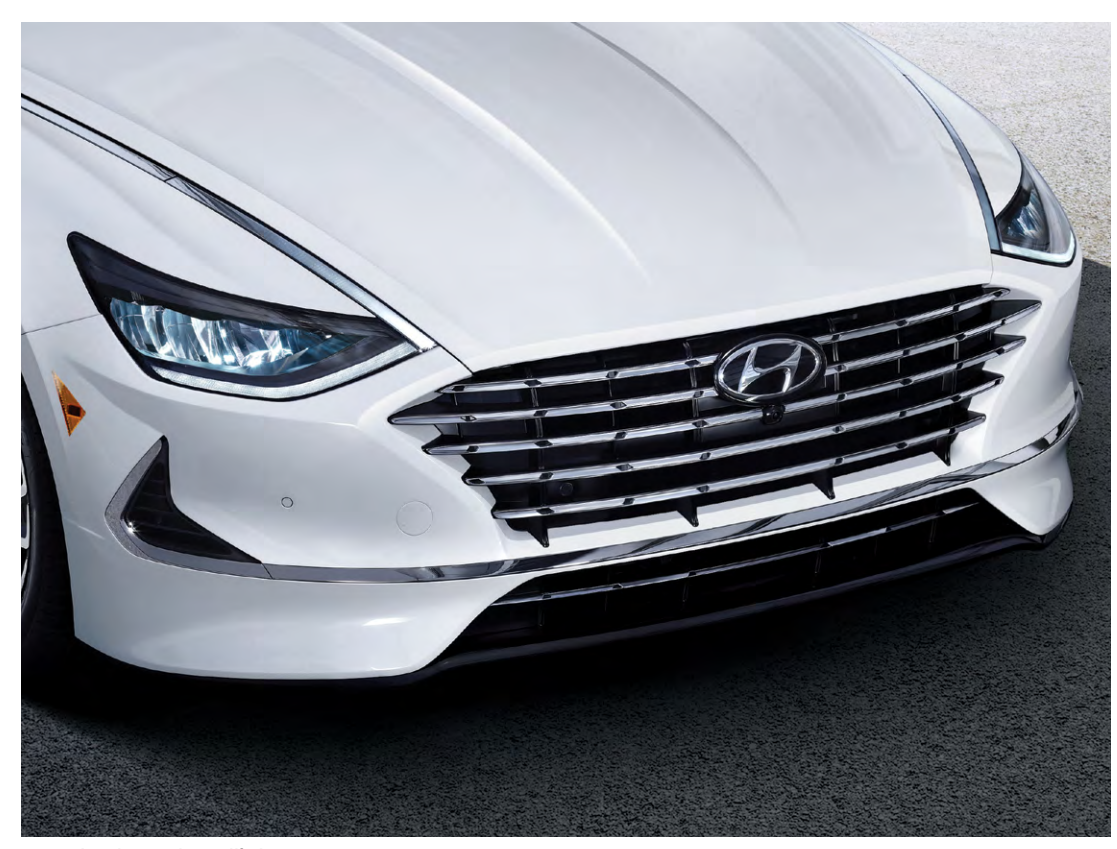
Standard LED headlights

The design of the all-new Sonata hybrid not only looks stunning, but also delivers outstanding aerodynamics thanks to smart engineering details. Its cross-hole grille can be easily overlooked but this unique-looking design feature comes with highly innovative technology — active air flaps that are designed to automatically open and close to balance the need for engine cooling and improved aerodynamic efficiency. The integrated rear spoiler is another small detail that plays a key role in reducing air turbulence, as does the design of the alloy wheels. Each fractional improvement adds up to make a big difference in the aerodynamic value, so that the all-new Sonata hybrid rides more efficiently than ever before.