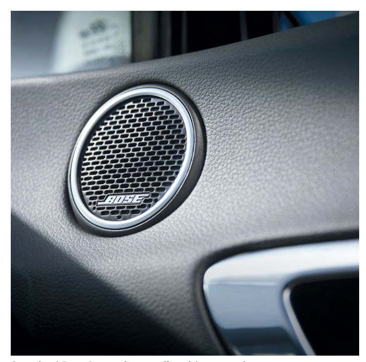
Standard Bose® premium audio with 12 speakers

Make the most of your drive with seamless connectivity offered by Apple CarPlay<sup>™∆</sup> and Android Auto<sup>™Ò</sup>. The high-definition 10.25" touch-screen display offers intuitive smartphone mirroring to access your favourite apps, as well as multiple viewpoints with the 360-degree Surround View Monitor for ease in tight spaces. A Bose® premium 12-speaker sound system provides the ultimate immersive experience for your favourite music.