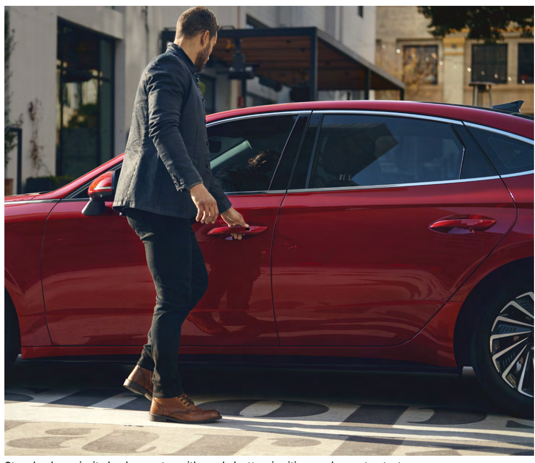
Standard proximity keyless entry with push-button ignition and remote start

The all-new Sonata hybrid features proximity key technology with the convenience of remote start, so you can warm up the cabin seamlessly on cold mornings. Step inside and access the personalized profile settings for up to three drivers. Experience ultimate convenience with driver's seat and side mirror positions, multimedia, drive mode, Head-Up Display settings and more, all stored and accessible at the press of a button. With the Head-Up Display you can view key information like your speed, the speed limit, blind spot notifications and navigation commands all projected within your line of sight for safer driving.