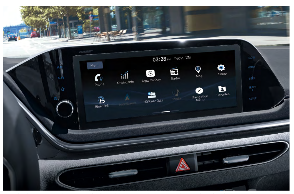
Standard 10.25" touch-screen display with Surround View Monitor and navigation system