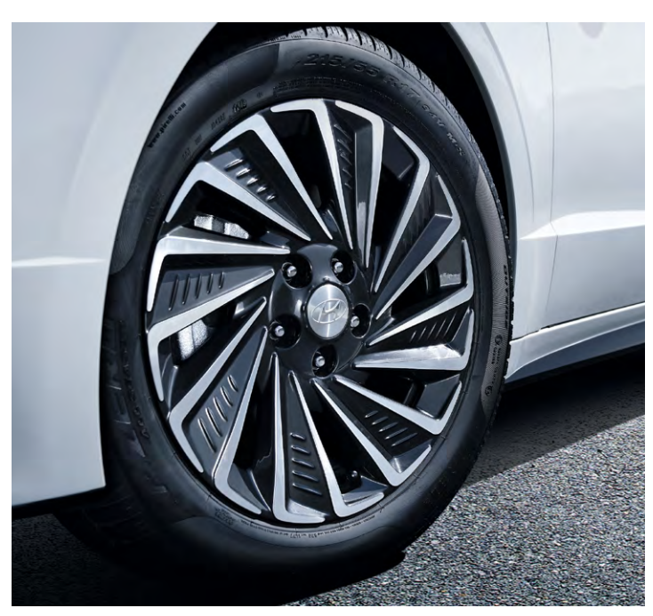
Standard 17" aero alloy wheels