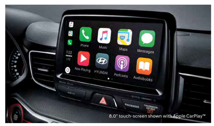
Standard 7.0" touch-screen and available 8.0" touch-screen