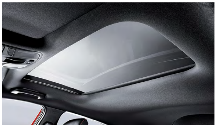
Available power sunroof