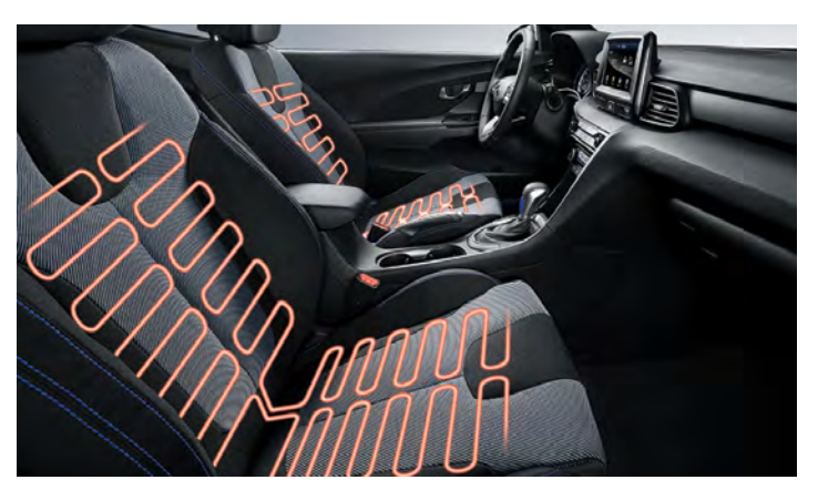
Standard heated front seats