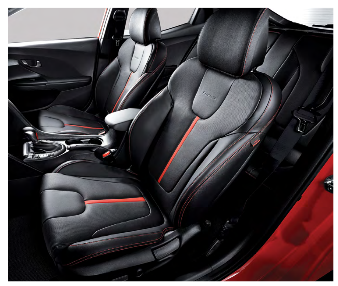
Available leather sport seats with red stitching