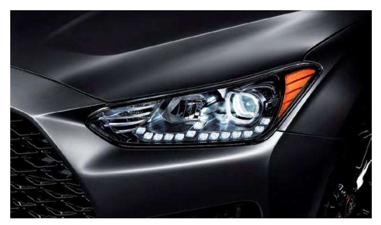
Available LED headlights

Never get into a chilly vehicle again. Among a wealth of features, one of the best in our available BlueLink® technology is the convenience of starting your vehicle remotely from your smartphone<sup>*</sup>. Just download the app. Please see your dealer for full service-level details.