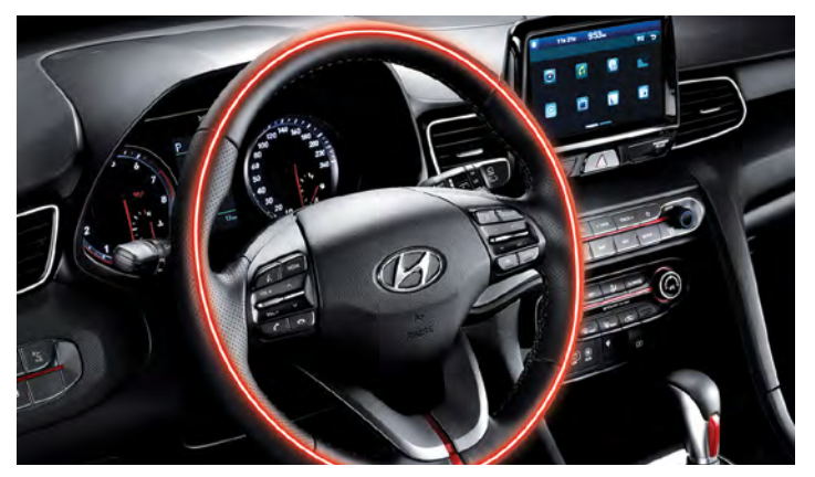
Standard heated steering wheel

Continuing its asymmetrical design into the cabin, the Veloster looks just as good from the inside. A driver-focused interior layout features contrasting finishes in the driver's seat area, and the centre console is strategically placed for optimal access. The standard leather-wrapped heated steering wheel puts more control at your fingertips with mounted audio and cruise control buttons.