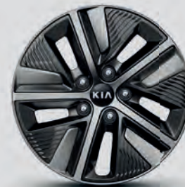
16" alloy wheels