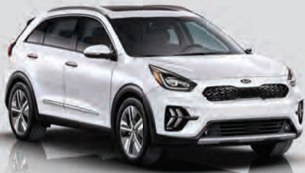
Snow White Pearl