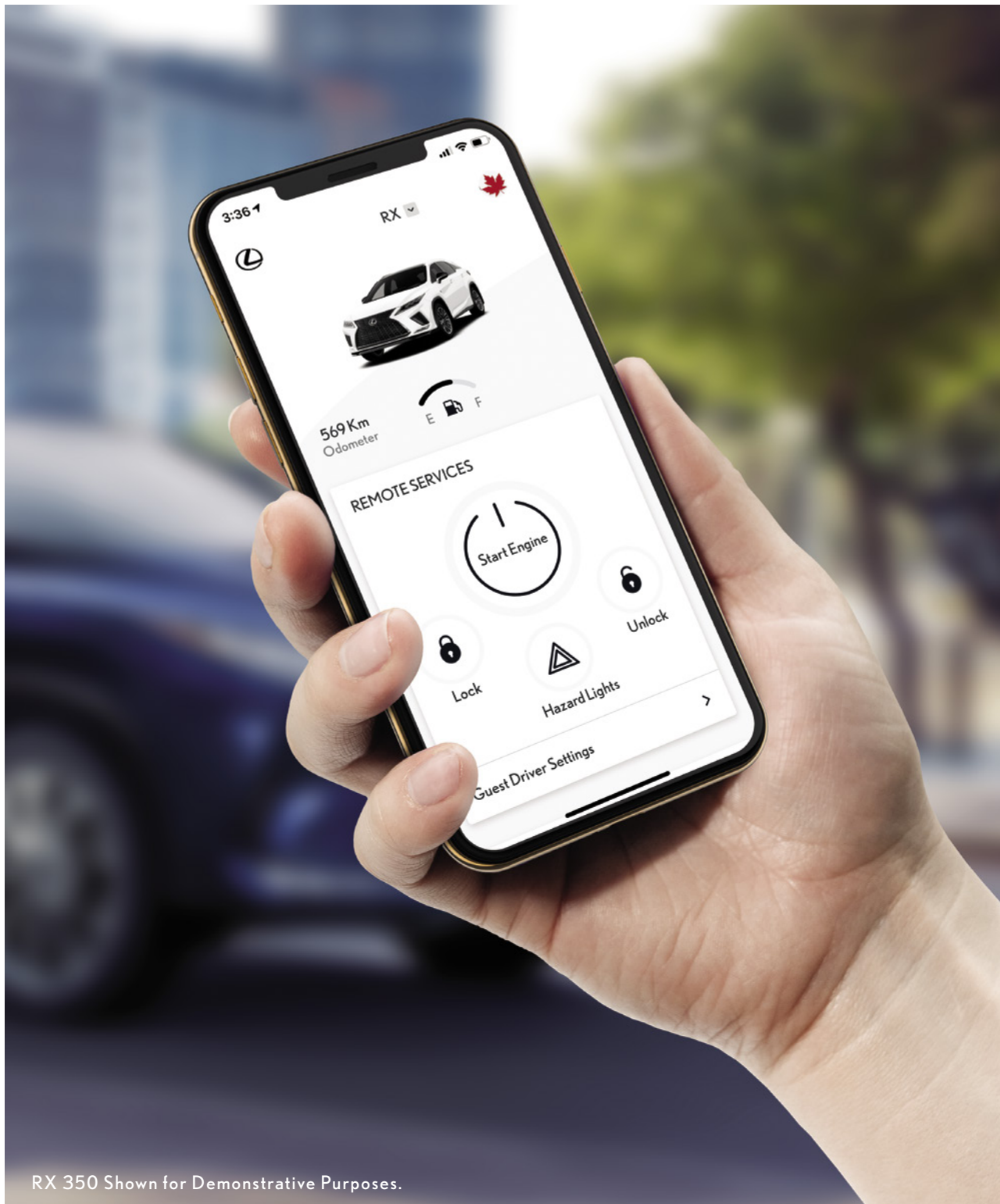
RX 350 Shown for Demonstrative Purposes.