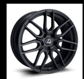
Launch Edition 19-in seven-spoke forged alloy Matte Black BBS® wheels¹