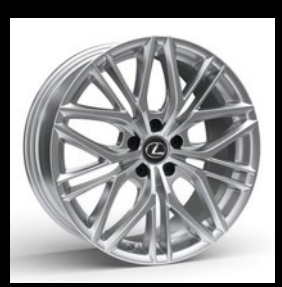
19-in split-10-spoke Enkei alloy wheels