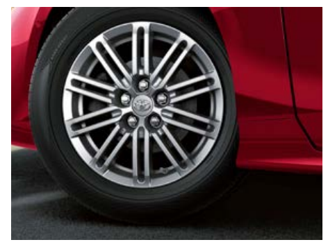
15-in. 10-spoke alloy wheels