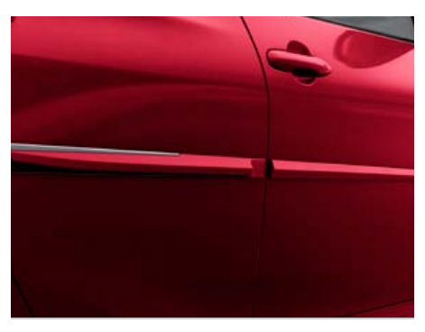
Body side molding