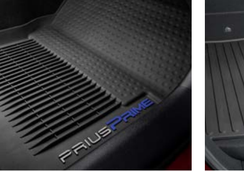
All-weather floor liners49