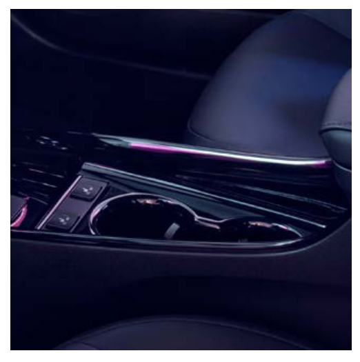
See numbered footnotes in Disclosures section.