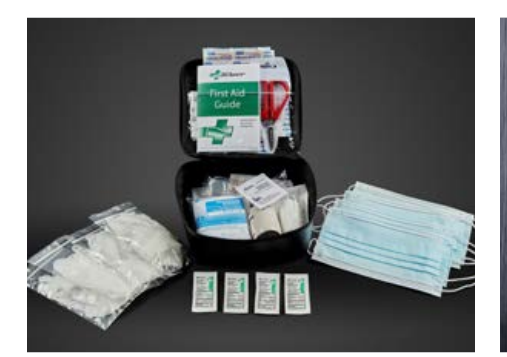
First aid kit with PPE