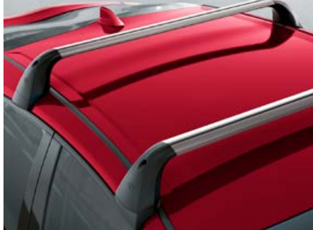
Removable cross bars<sup>2</sup>