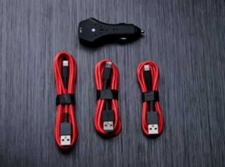
Quick charge cable package