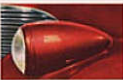
Shoulder headlamps are mounted in fixed position on the fenders.