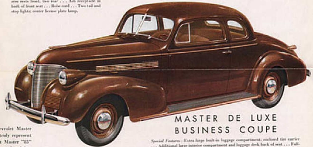
MASTER DE LUXE BUSINESS COUPE

Special Features —Built-in luggage compartment; enclosed tire carrier . . . Full-width seat cushion, divided back; two interior folding rear seats . . . Sliding rear-quarter windows . . . Two arm rests . . . Two tail and stop lights; center license plate lamp.