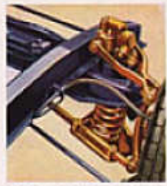
Each front wheel is securely fast to chassis road shocks without affecting the other wheel or transmitting the shocks to the car itself.