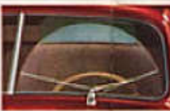
Windshield wipers lie snug against the lower molding when idle.