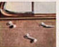
A safety lock is a 1937 improvement on the No. 1 lock, which is in all bodies.