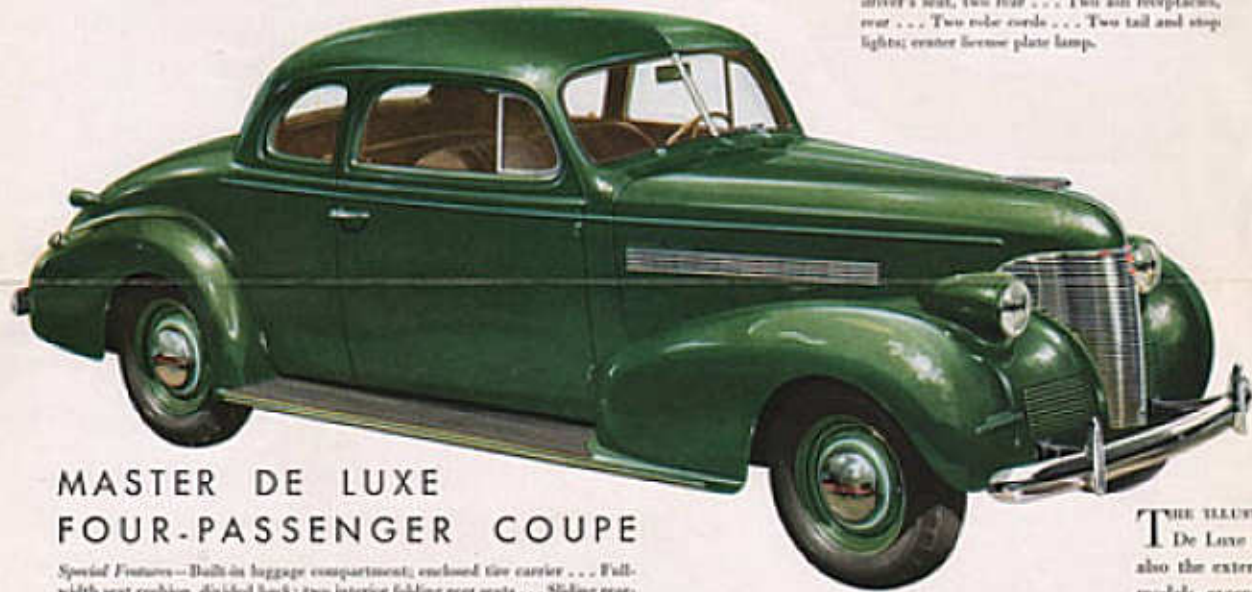
MASTER DE LUXE FOUR-PASSENGER COUPE

Special Features —Built-in luggage compartment; enclosed tire carrier, covered tool box . . . Parcel ledge at top of rear-seat back . . . Sliding rear-quarter windows . . . Two assist straps . . . Two arm rests front, two rear . . . Ash receptacle in back of front seat . . . Robe cord . . . Two tail and stop lights; center license plate lamp.