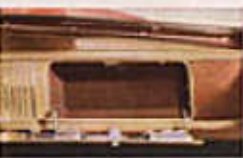
The glass compartment, with flush back, is a constant convenience.