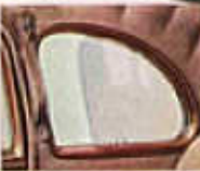
In the Master De Luxe Sport Sedan, Sedan and Four-Door Coupe, rear-quarter windows slide back.