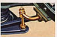
A sturdy side stabilizer prevents excessive swaying on curves and turns.

Chevrolet's perfected Knee-Action, regular equipment on the Master De Luxe models only, possesses all the recognized advantages of individual front-wheel suspension—improved ride, truer steering, more positive control, greater safety—developed to new heights. In addition, Chevrolet Knee-Action has still another great advantage—for Chevrolet builds its front-end suspension as a single unit—sembled, aligned, and inspected before being attached to the chassis frame. With this improved front-end suspension come corresponding improvements in the rear springing, to provide a smooth, comfortable ride.