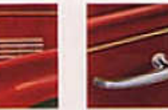
Safety door handles combine beauty with safety and durability.