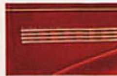
Hood hinge moldings are long and slender. Molded nameplates add a distinctive touch of styling.