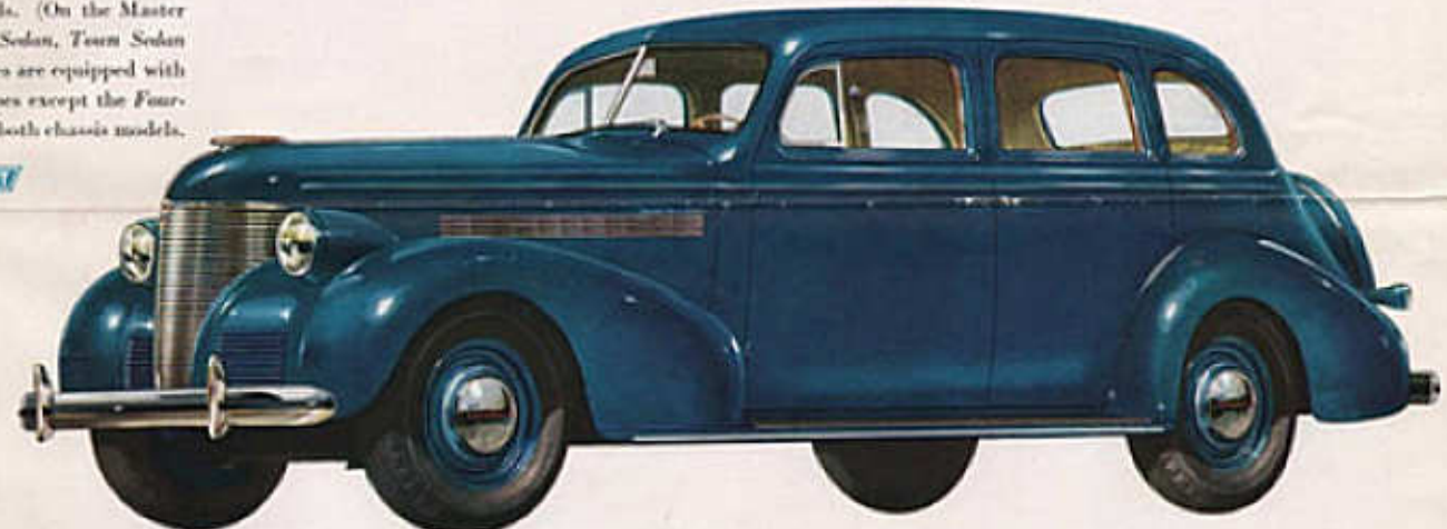
MASTER DE LUXE SEDAN

Special Features —Interior luggage compartment back of rear seat . . . Spare-tire cover and lock . . . Full-width front-seat cushion, divided back . . . Parcel ledge at top of rear-seat back . . . One arm rest at driver's seat, two rear . . . Two ash receptacles, rear . . . Two robe cords . . . Two tail and stop lights.