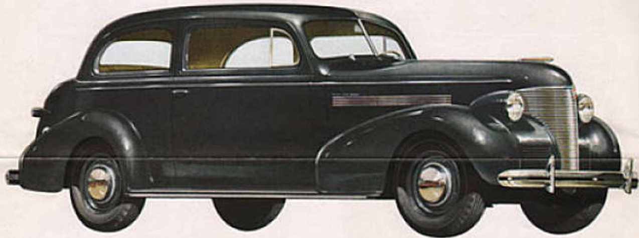
MASTER DE LUXE TOWN SEDAN

Special Features —Built-in luggage compartment; enclosed tire carrier, covered tool box . . . Full-width front-seat cushion, divided back . . . Parcel ledge at top of rear-seat back . . . One arm rest at driver's seat, two rear . . . Two ash receptacles, rear . . . Two robe cords . . . Two tail and stop lights; center license plate lamp.