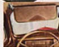
The sun visor is adjustable. It can be swung to the side to cut all glare at the window.