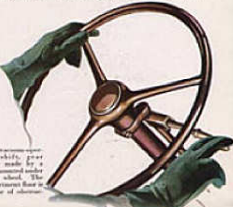
With the vacuum-operated gearshift, gear changes are made by a short lever mounted under the steering wheel. The floor compartment that is usually clear of observation.

With Chevrolet's vacuum gearshift, the driver has only to move the lever, and 80 per cent of the effort required for shifting is provided by a vacuum cylinder. In selecting gears, the lever is moved to the front or rear exactly as with the conventional shift; in passing through neutral the lever is moved straight up or down instead of to the left or right. The vacuum gearshift may be had on any Chevrolet passenger car at slight extra cost.