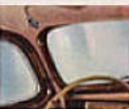
Large windshields and windows give "observation car" visibility.