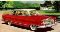
New 1954 Nash Statesman Super Four-Door Sedan —The ideal car for large families. Here is America's big economy car.