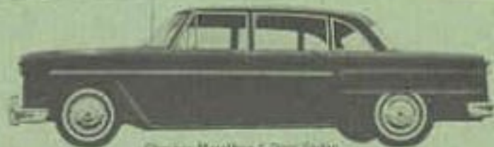
Checker Marathon 4-Door Sedan

SEPARATE UNDER SEAT HEATER • POWER STEERING • POWER BRAKES • RADIO AND ANTENNA • TINTED GLASS • BACK-UP LIGHTS • PARKING BRAKE SIGNAL • OUTSIDE MIRROR • WINDSHIELD WASHER • DELUXE CHROME WHEEL COVERS • OIL FILTER • UNDERCOATING • 4-PLY TIRES • 4.25 x 15 2-PLY (4-PLY RATING) TIRES • WHITE SIDEWALL TIRES