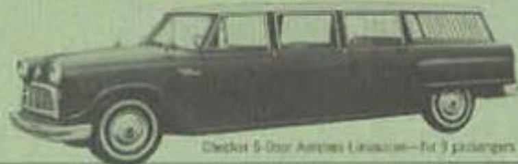
Checker 5-Door Airflow Limousine—fit 9 passengers