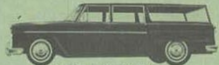
Checker Marathon 4-Door Station Wagon