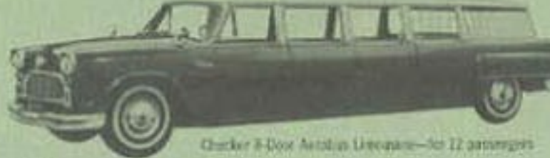
Checker 7-Door Astoria Limousine—fit 12 passengers