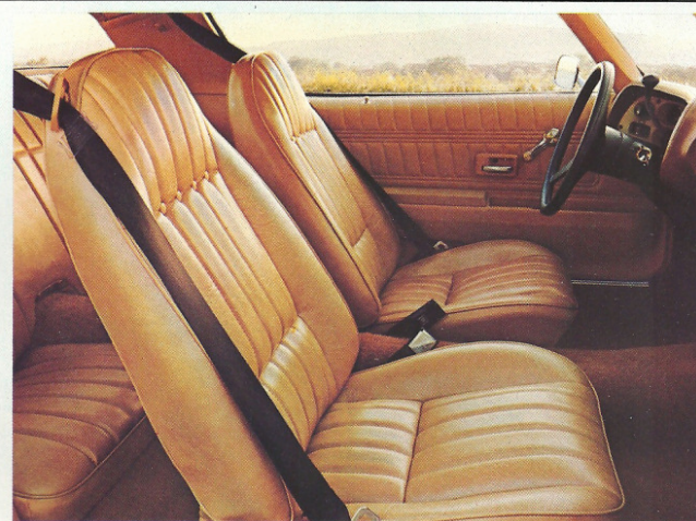
Camaro Sport Coupe standard all-vinyl interior.

You can choose your '77 Camaro Sport Coupe's standard all-vinyl interior in solid black or in colorful two-tones—white seats, headliner and door trim with aqua, black, blue, firethorn or saddle accent areas. There are also buckskin seats with saddle or black accent areas, and firethorn seats with black or firethorn accents in standard all-vinyl or in available sport cloth seat trim.