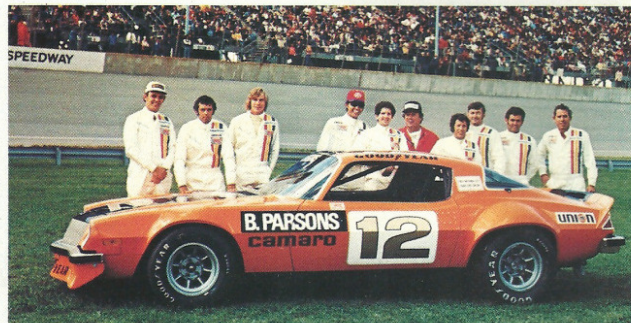
Camaro and admirers. Top race drivers compete in the "International Race of Champions," each driving an identically prepared Camaro, specifically equipped for racing. Shown left to right: Benny Parsons, Brian Redman, James Hunt, Richard Petty, Jody Scheckter, A. J. Foyt, Mario Andretti, Bobby Allison, Al Unser, David Pearson.

disc brakes, variable-ratio power steering, sport steering wheel, bucket seats in front, bucket-styled seats in the rear, and a cockpit and instrument