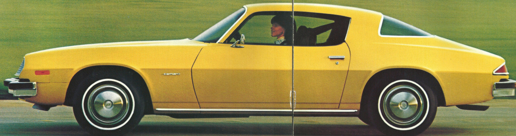
Camaro Sport Coupe. Shown with available white stripe tires and wheel covers. Shown on cover: Camaro Type LT with available white stripe tires and Style Trim Group.