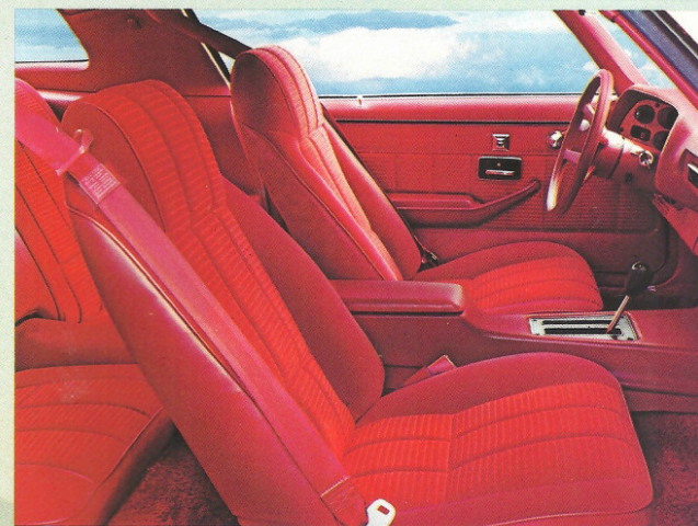
Camaro Type LT available knit cloth-and-vinyl interior.

You have your choice of nine standard all-vinyl interiors in the Type LT—solid blue or black; buckskin seats with saddle or black interior accents; or white seats with blue, black, firethorn, aqua or saddle interior accents. And there are five available knit-cloth seat interiors—solid blue; buckskin with saddle or black interior accent areas; firethorn with firethorn or black accent areas.