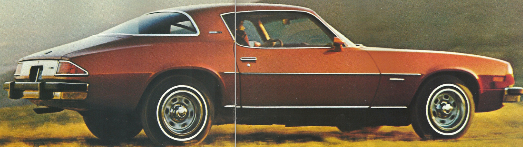
Camaro Type LT. Shown with available body side moldings, Style Trim Group, white stripe tires and bumper guards.