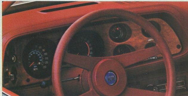
The Type LT instrument panel features a simulated leather instrument cluster facing, Special Instrumentation (tachometer, voltmeter, temperature gauge, electric clock), added instrument lighting, glovebox light and color-coordinated steering wheel with "Type LT" emblem.

aluminum rear trim panel, black-accented lower body sill areas and, inside, special bucket seats and luxury-level interior trim.