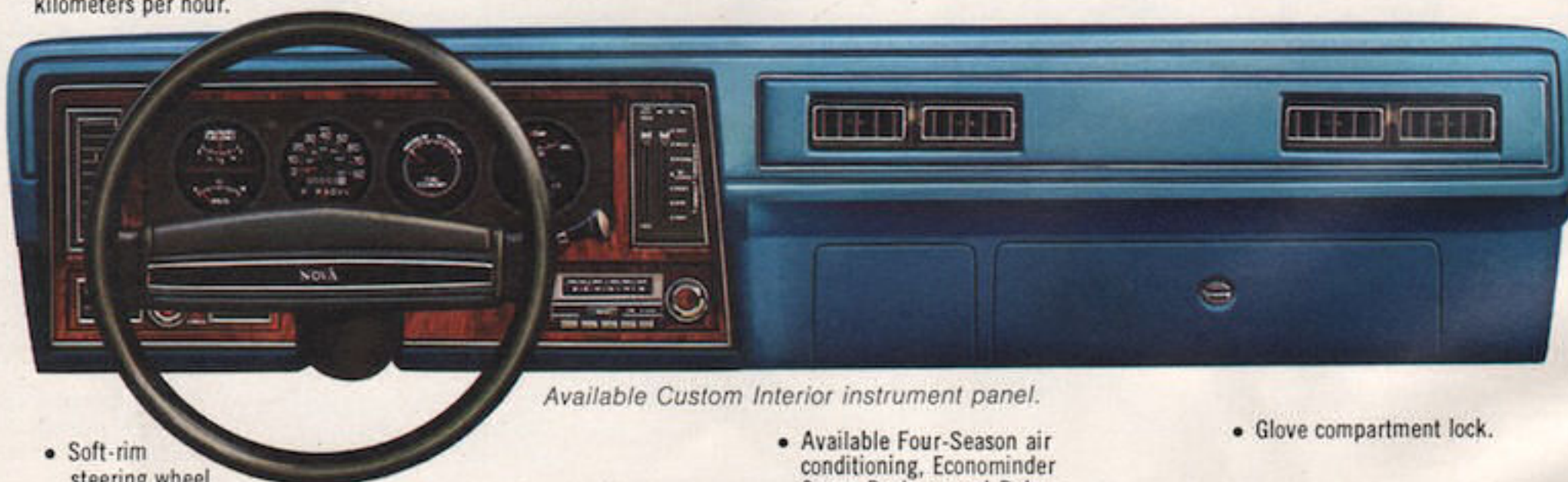
Available Custom Interior instrument panel.