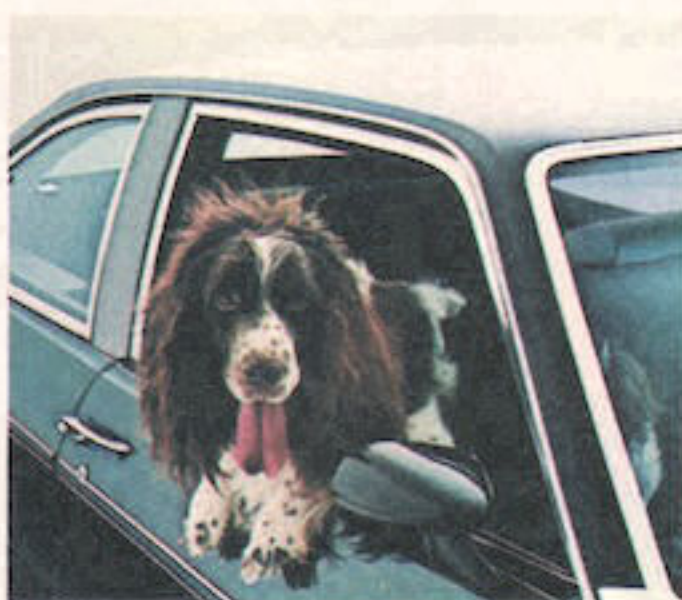
Exterior Decor Package.