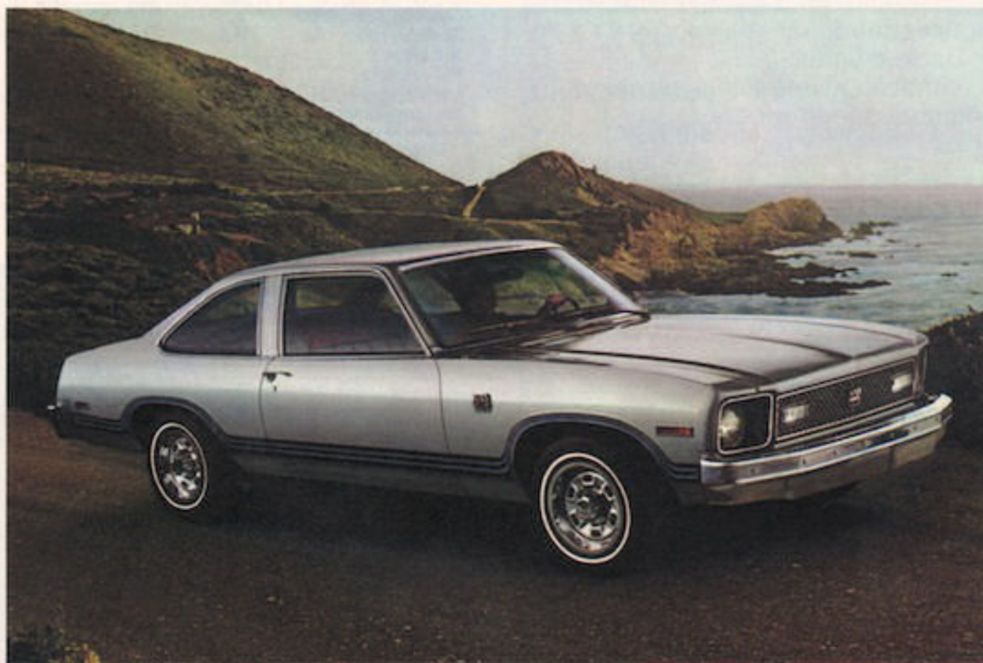
Nova Coupe with available Rally equipment.