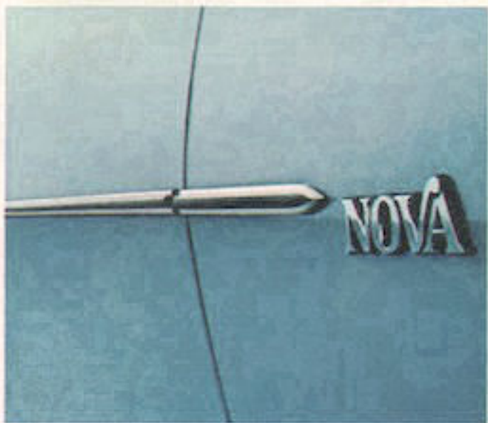
Body side molding.