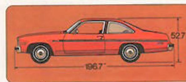
Not too big.

Since 1962, when we brought out the first Nova (the Chevy II, then), we've sold well over 3,500,000 of them. And have you noticed all the Nova-size cars other manufacturers are coming out with?