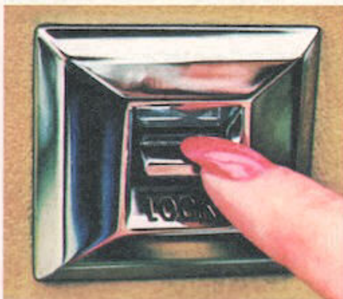
Power door lock system.