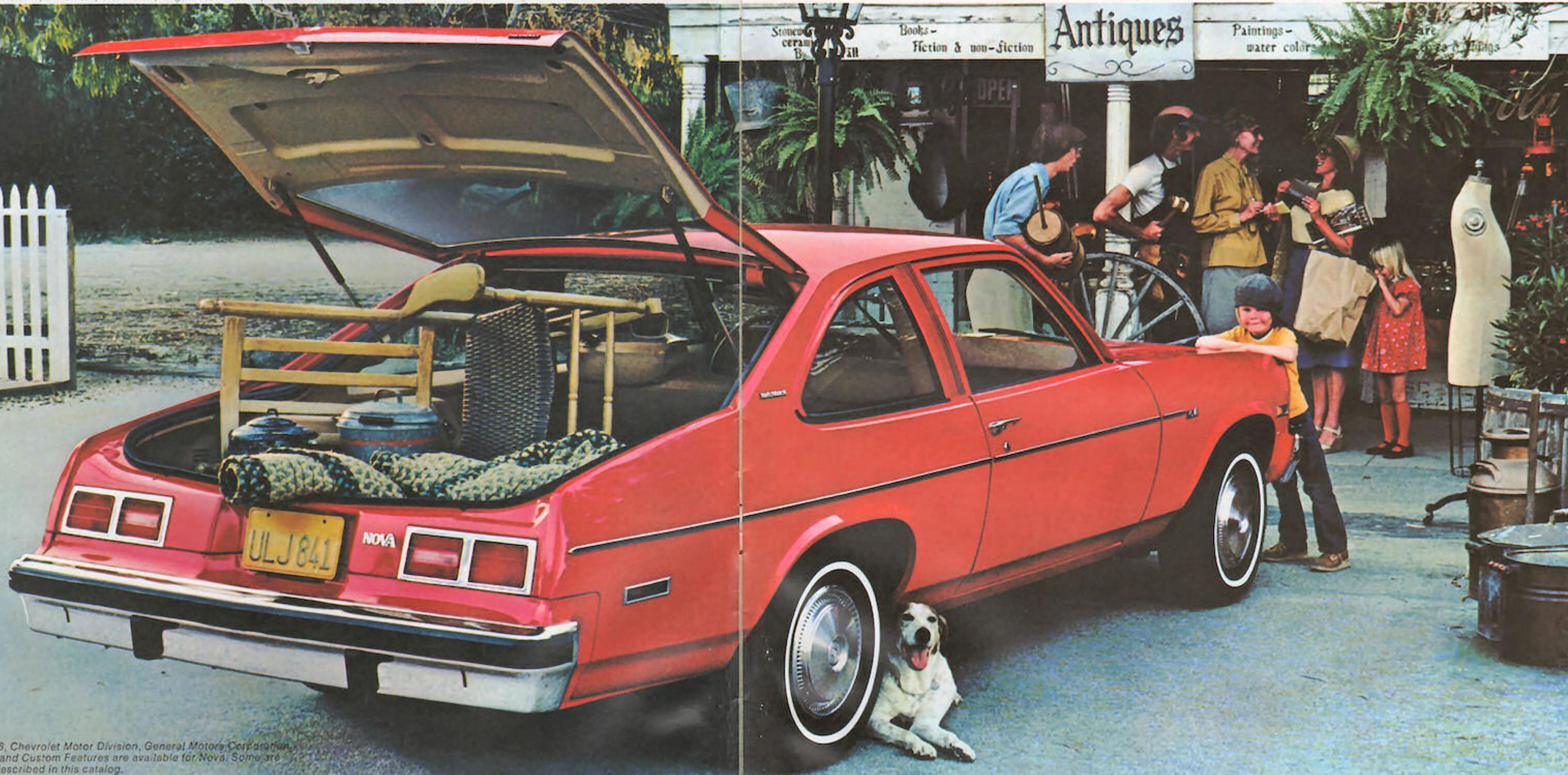
Nova Hatchback Coupe. Shown with available bumper rub strips and guards, body side moldings, white stripe tires and full wheel covers.