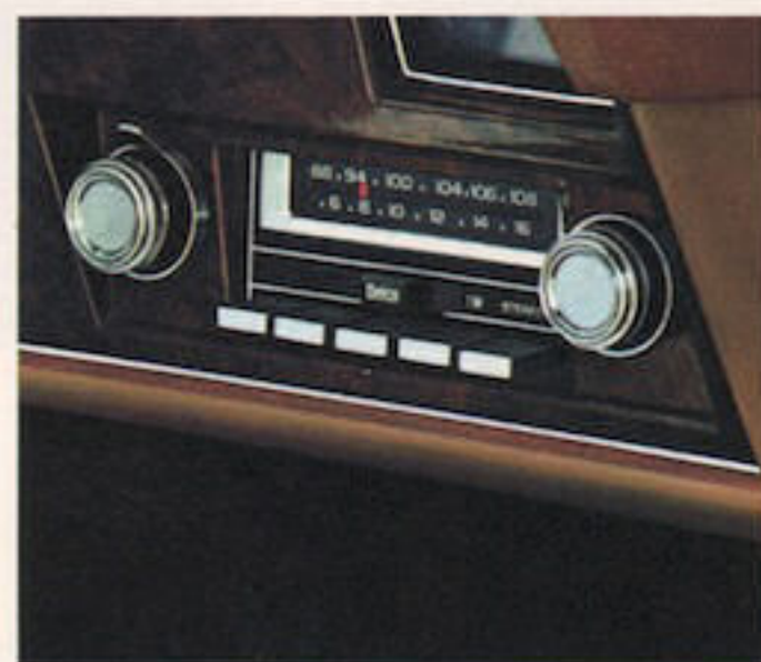
Delco-GM AM/FM stereo radio.