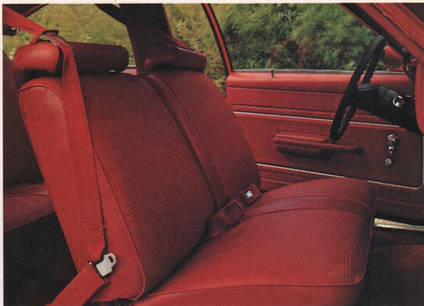
Nova's interior features standard all-vinyl trim, as shown, or available plaid cloth-and-vinyl.