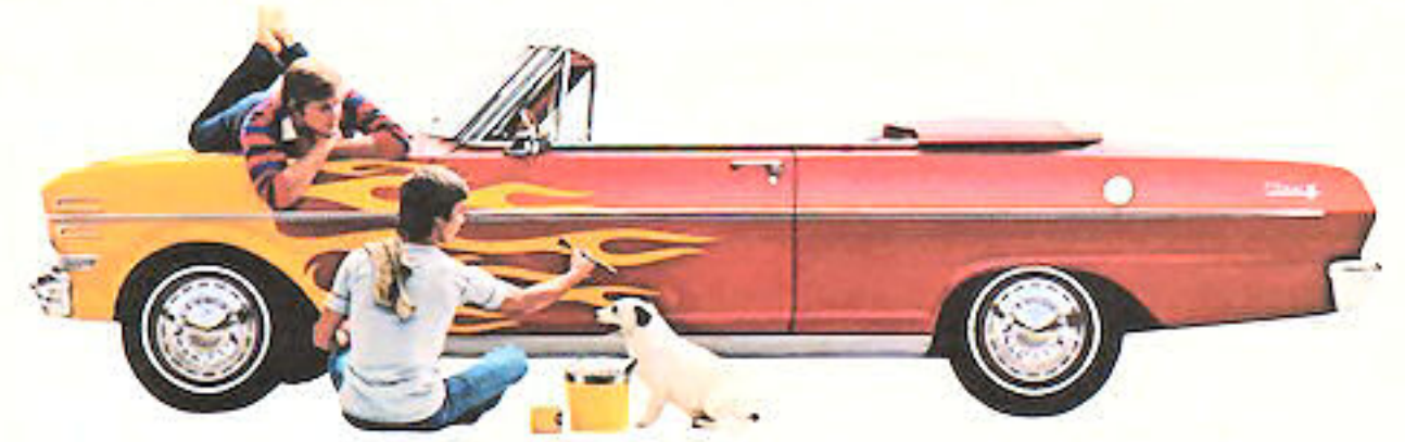
1962 Nova Convertible

In fact, we've made improvements in virtually every single area of the car. To bring you 15 years of thinking and refining that none of Nova's current competitors can offer.