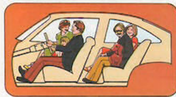
Not too small.

Have you ever discovered something special that was right there all the time? A little restaurant right down the street from home. A song you'd never really listened to before. The girl or boy next door. If this is the first time you've really considered a Nova, it might be quite an experience for you.