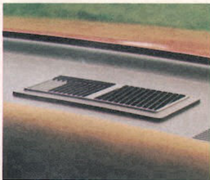
Rear window defogger.