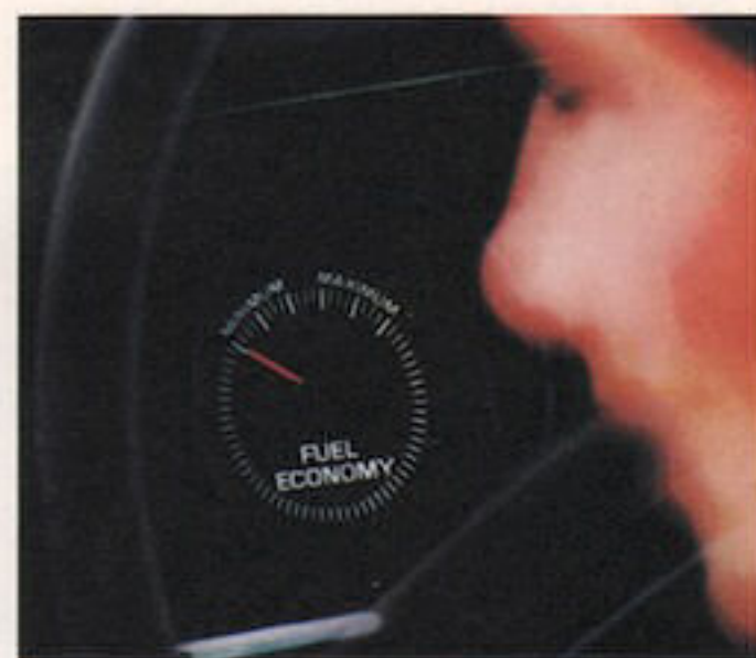
Econominder Gauge Package.