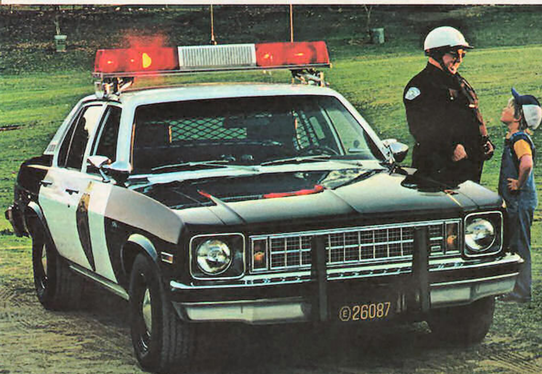
Nova 4-Door Sedan with special police equipment.