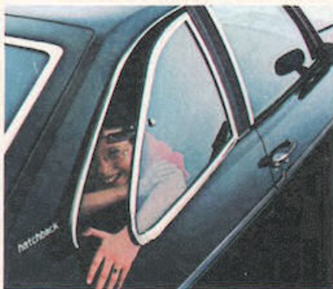
Swing-out rear side windows.