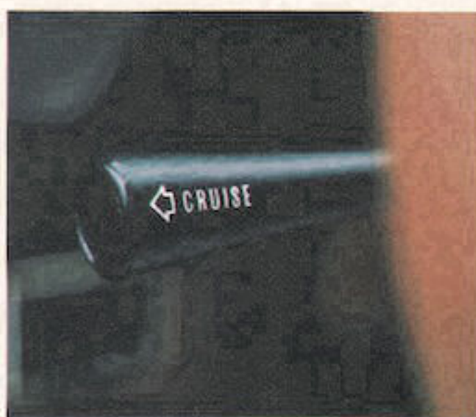
Cruise-Master speed control.