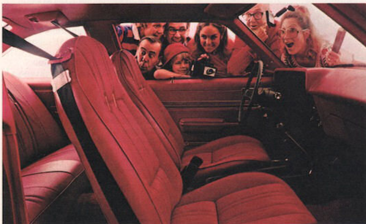
Custom vinyl bucket seat interior and available console.