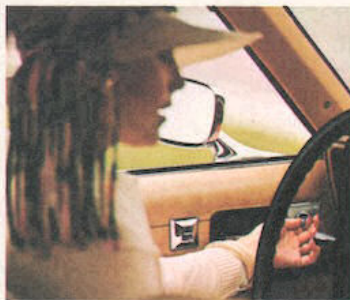
Remote-control outside rearview mirror.