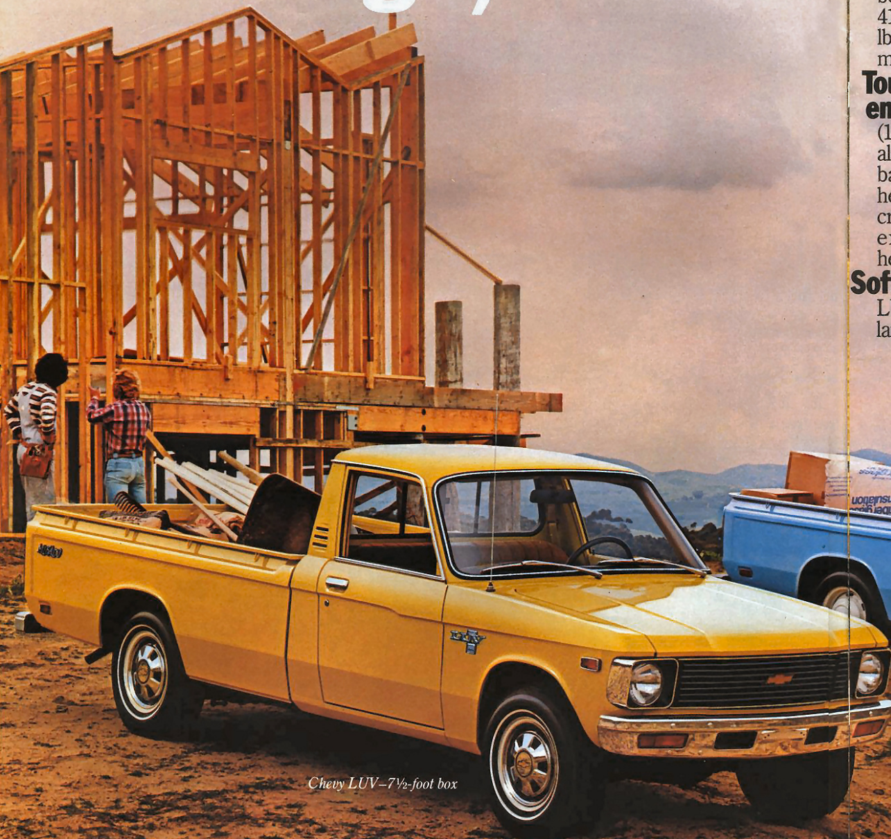
Chevy LUV—7½-foot box

A word about this catalog: We have tried to make this catalog as comprehensive and factual as possible. And we hope you find it helpful. However, since the time of printing, some of the information you'll find here may have been updated. Your dealer has details and, before ordering, you should ask him to bring you up to date.