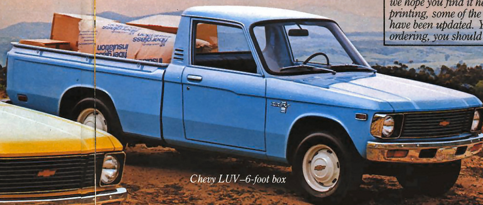
Chevy LUV—6-foot box

Many vehicles in this catalog are shown with available factory-installed options, dealer accessories and specialized equipment from various independent suppliers.