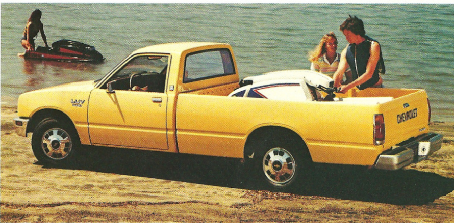
Chevy 2WD Diesel LUV, 7½-ft. cargo box model in Marigold Yellow.

To obtain EPA fuel economy estimates for Chevrolet light-duty trucks, check the wall poster at your dealer's showroom.