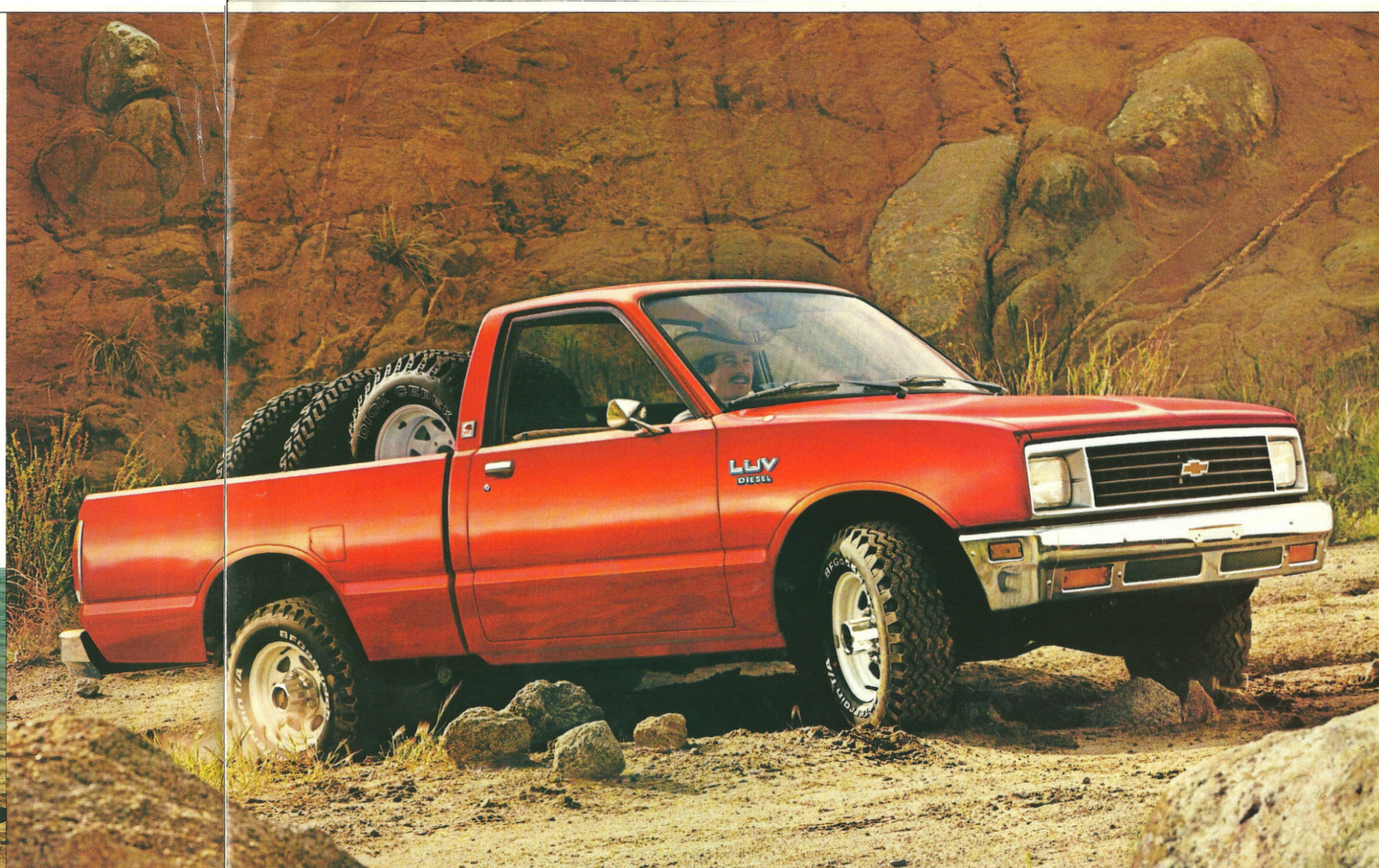
Chevy 4WD Diesel LUV with 6-ft. cargo box in Scarlet Red. Longer box not available on four-wheel-drive model. Tires supplied by various manufacturers.