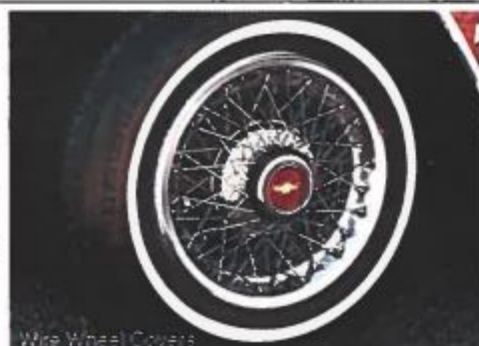
Wire Wheel Covers