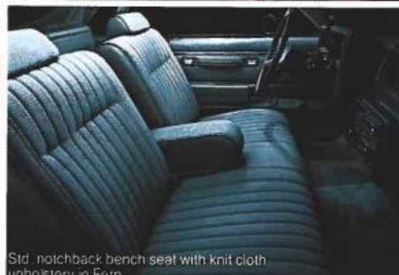
Std. notchback bench seat with knit cloth upholstery in Fern