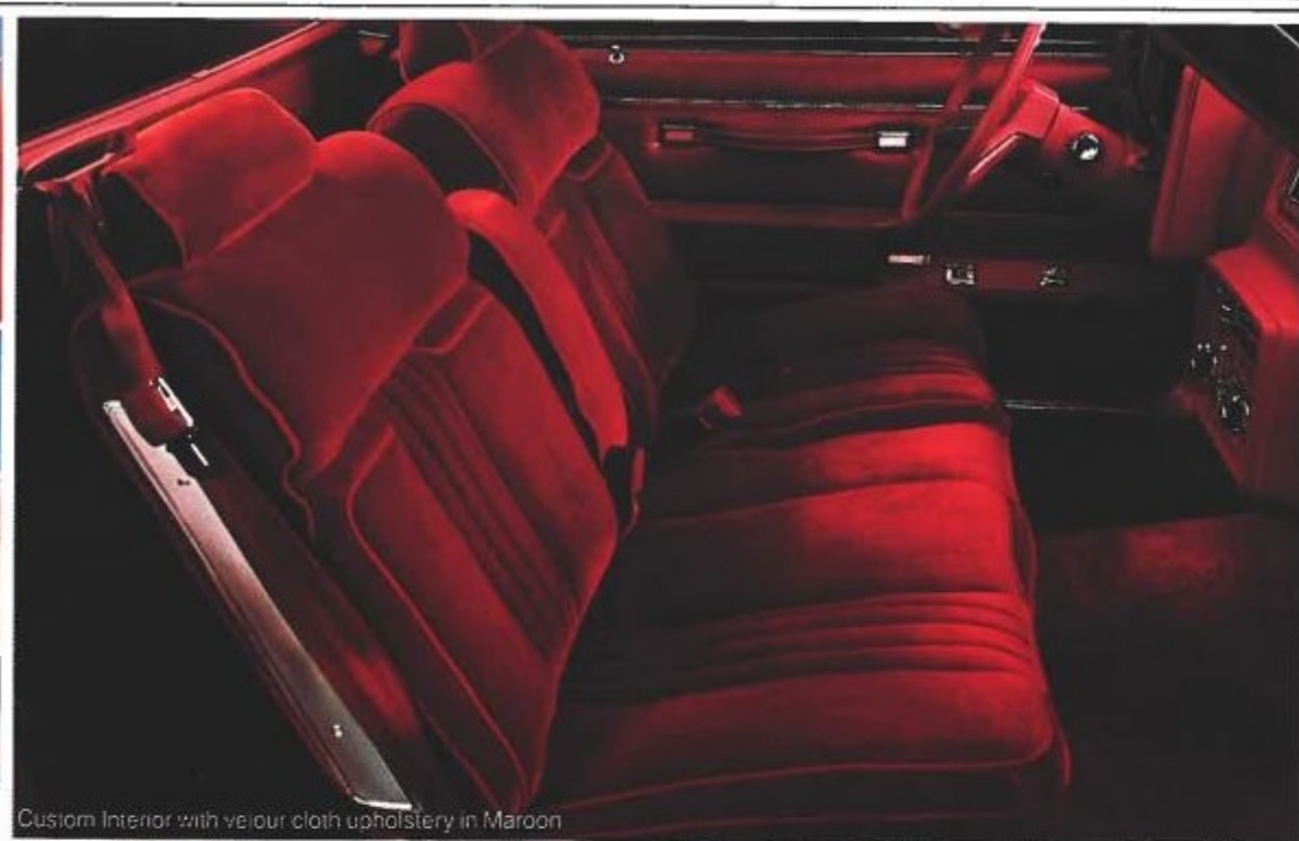
Custom Interior with velvet cloth upholstery in Maroon