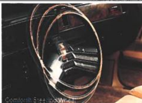
Comfort Steering Wheel