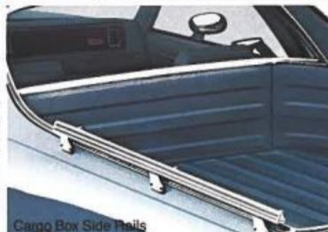
Cargo Box Side Rails