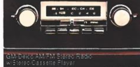
GM-DeLo AM-FM Stereo Radio w/ Stereo Cassette Player

A WORD ABOUT ASSEMBLY, COMPONENTS AND OPTIONAL EQUIPMENT IN THESE CHEVROLET PRODUCTS. The Chevy El Caminos described in this catalog are assembled at facilities of General Motors Corporation operated by GM Assembly Division. These vehicles incorporate thousands of different components produced by various divisions of General Motors and by various suppliers to General Motors. From time to time during the manufacturing process, it may be necessary, in order to meet public demand for particular vehicles or equipment, or to meet federally mandated