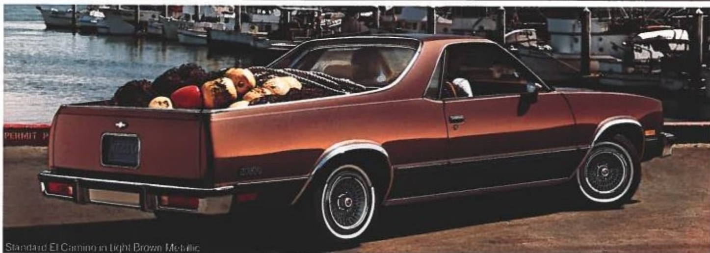
Standard El Camino in Light Brown Metallic