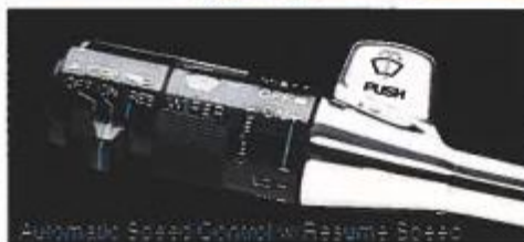
Automatic Speed Control w/Resume Speed