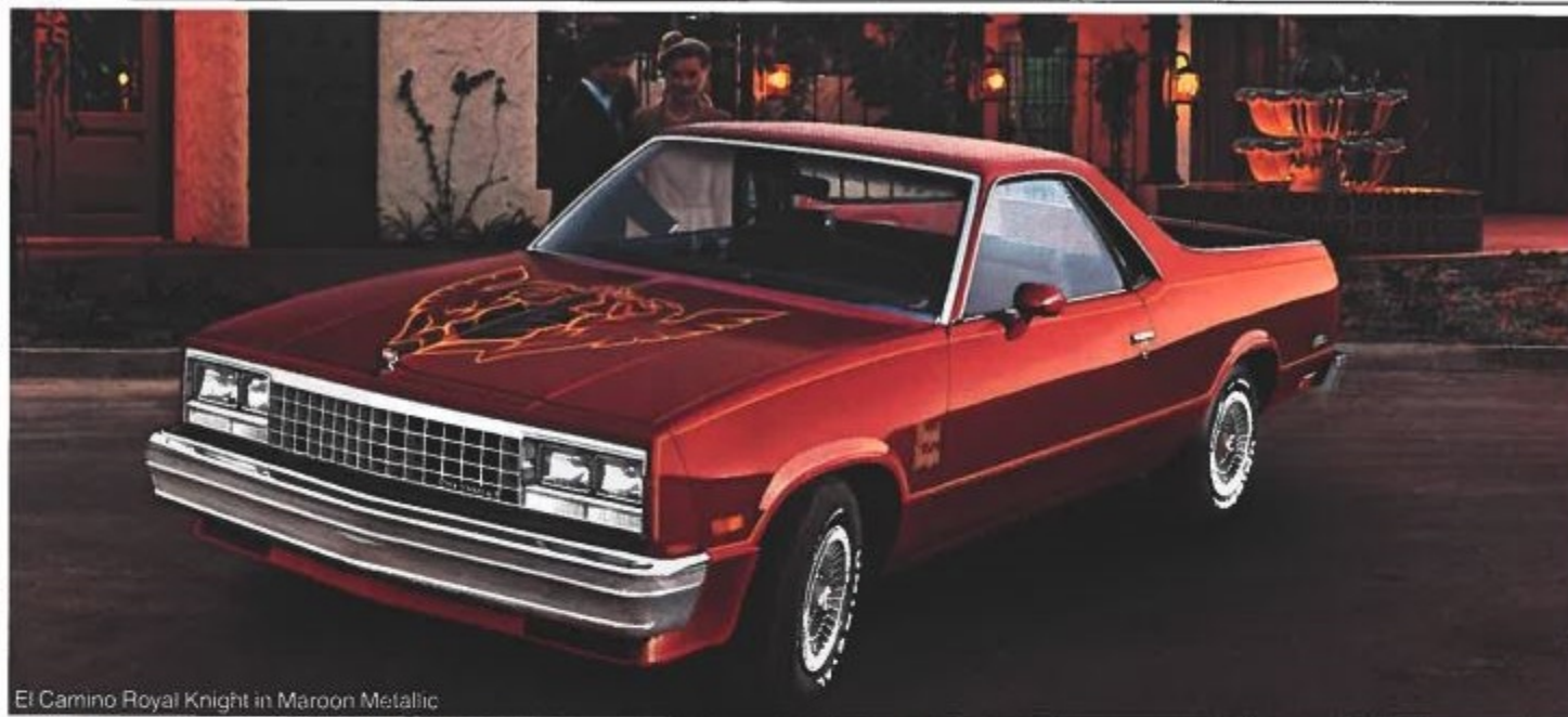
El Camino Royal Knight in Maroon Metallic