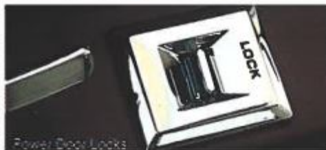
Power Door Locks