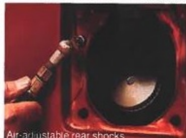
Air-adjustable rear shocks