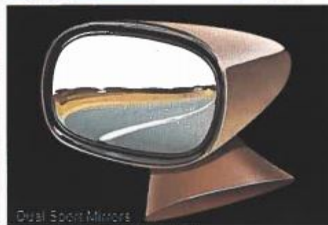
Dual Sport Mirrors