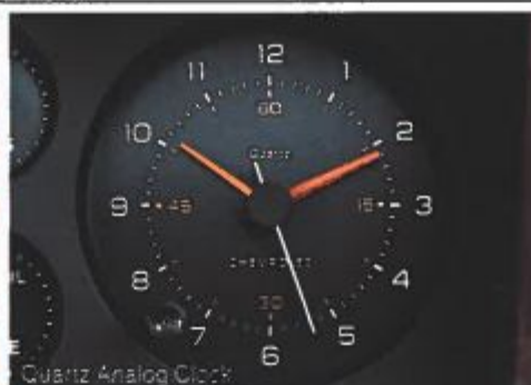
Quartz Analog Clock