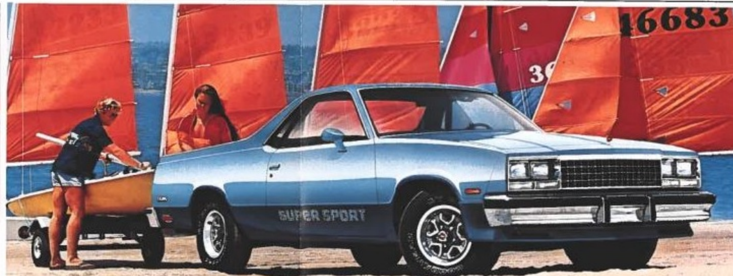
El Camino Super Sport in Light Blue Metallic and Dark Blue Metallic