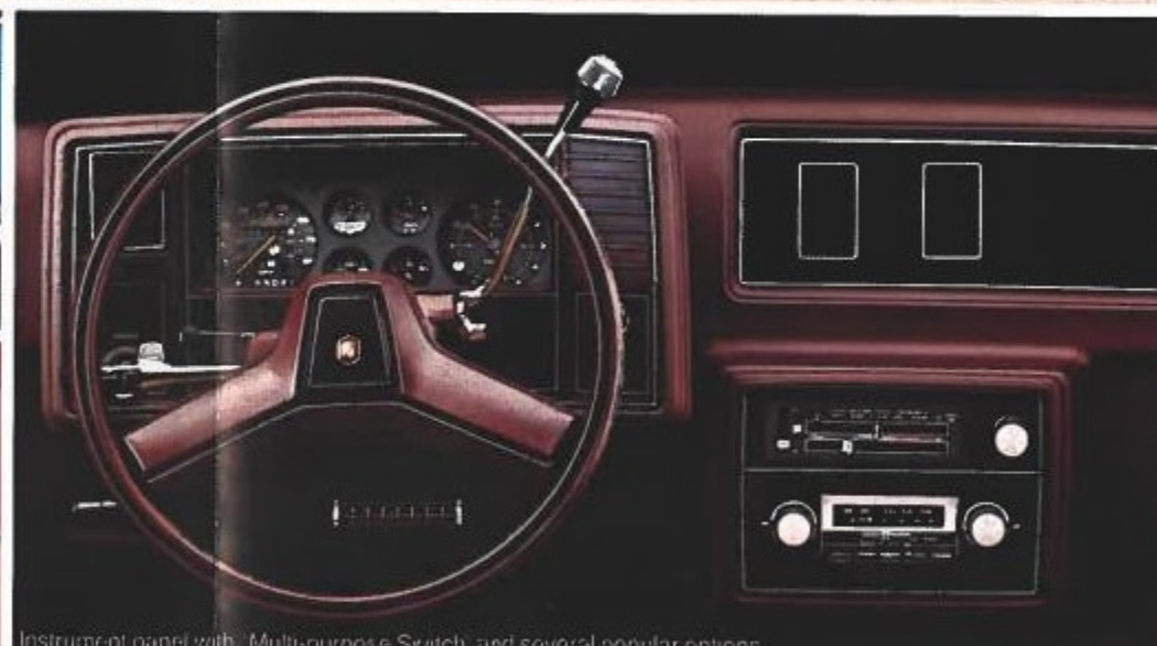
Instrument panel with "Multi-purpose Switch" and several popular options