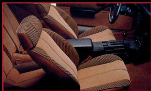
Camaro's available Custom Interior for grand touring comfort.

manual transmission with Electronic Fuel Injection. Or the available 2.8 Litre V6 or 5.0 Litre V8 engines, F41 Sport Suspension and Quiet Sound Group. The choice is yours.