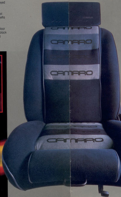
Z28's available L/S Contour driver's seat provides 18 adjustment variations to position yourself perfectly within the car's ergonomic design.