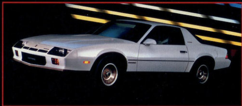
Camaro Berlinetta Coupe. Elegant Performance.

Inside Berlinetta. A New Dimension of Car Control.