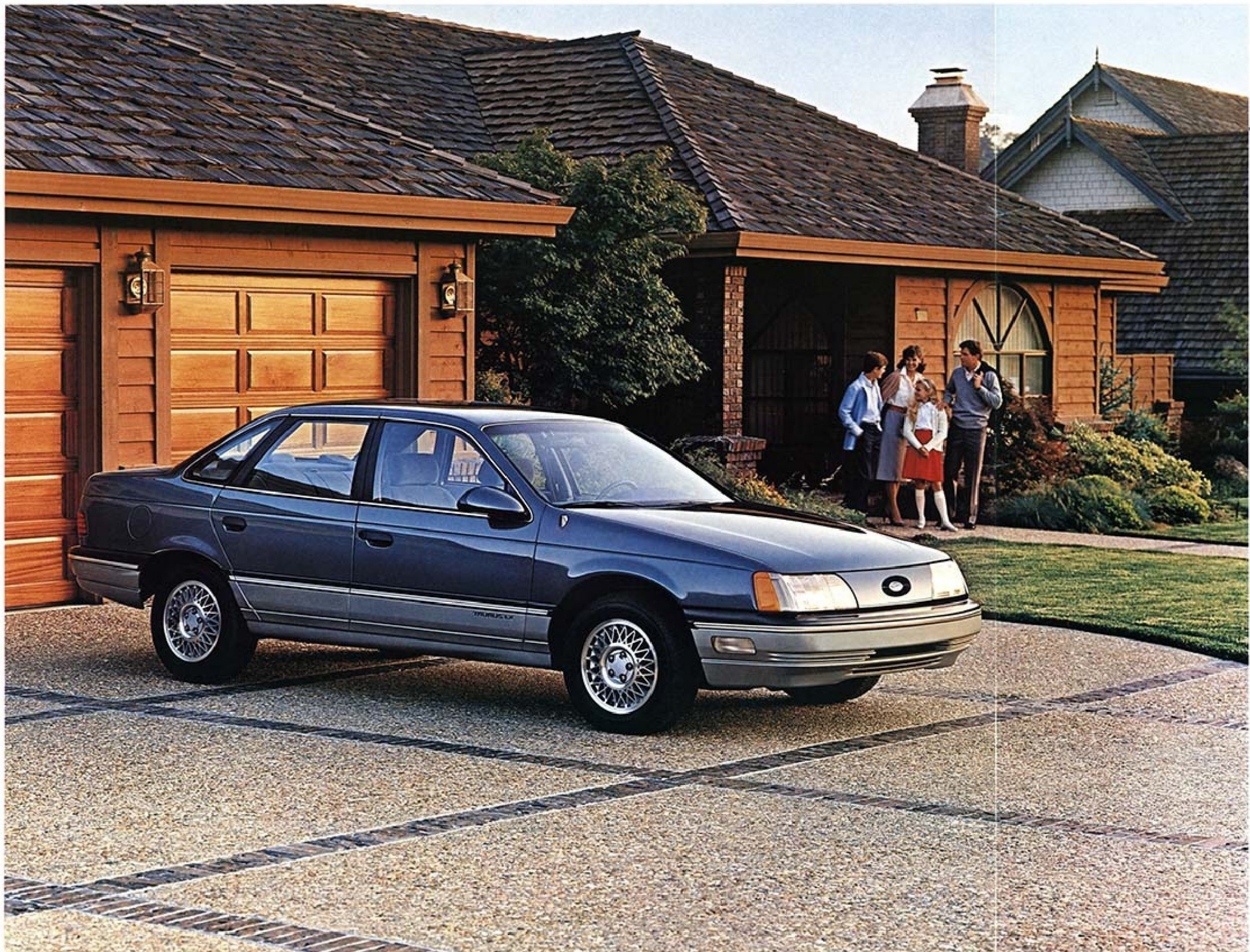
Left: Taurus LX Sedan shown in Medium Grey Clearcoat Metallic.