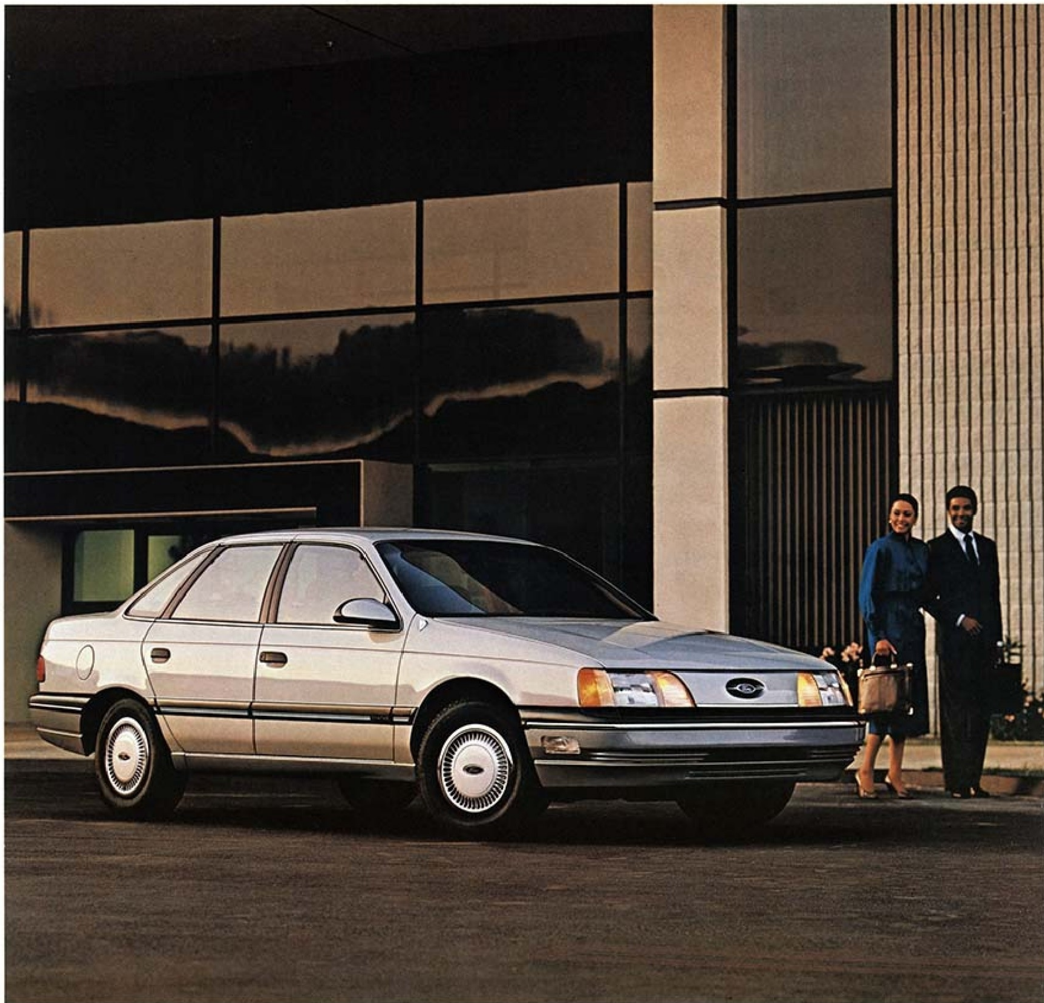
Left: Taurus GL Sedan shown in Silver Clearcoat Metallic.