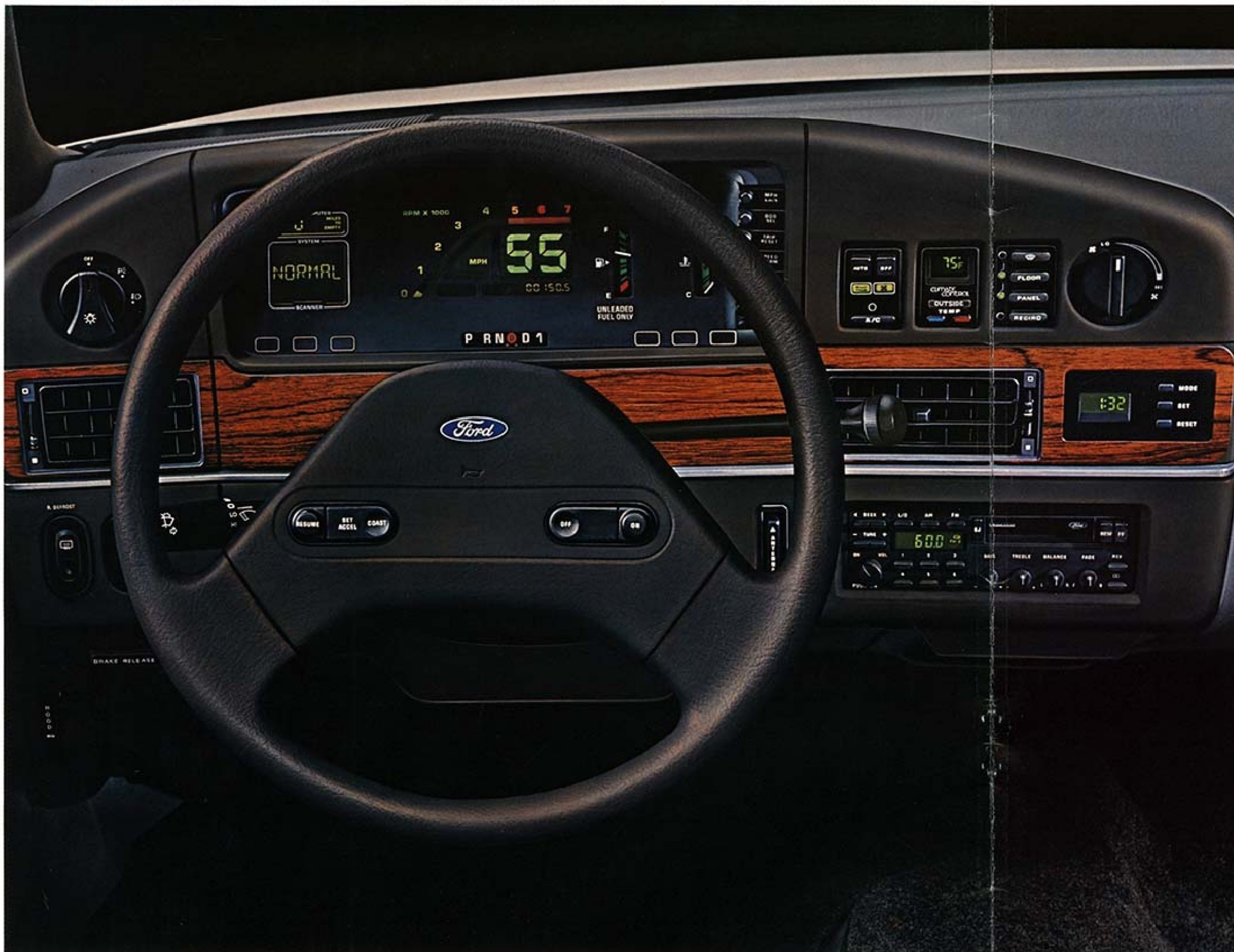
Left: Electronic Instrument Cluster. Optional on L, GL and LX models.