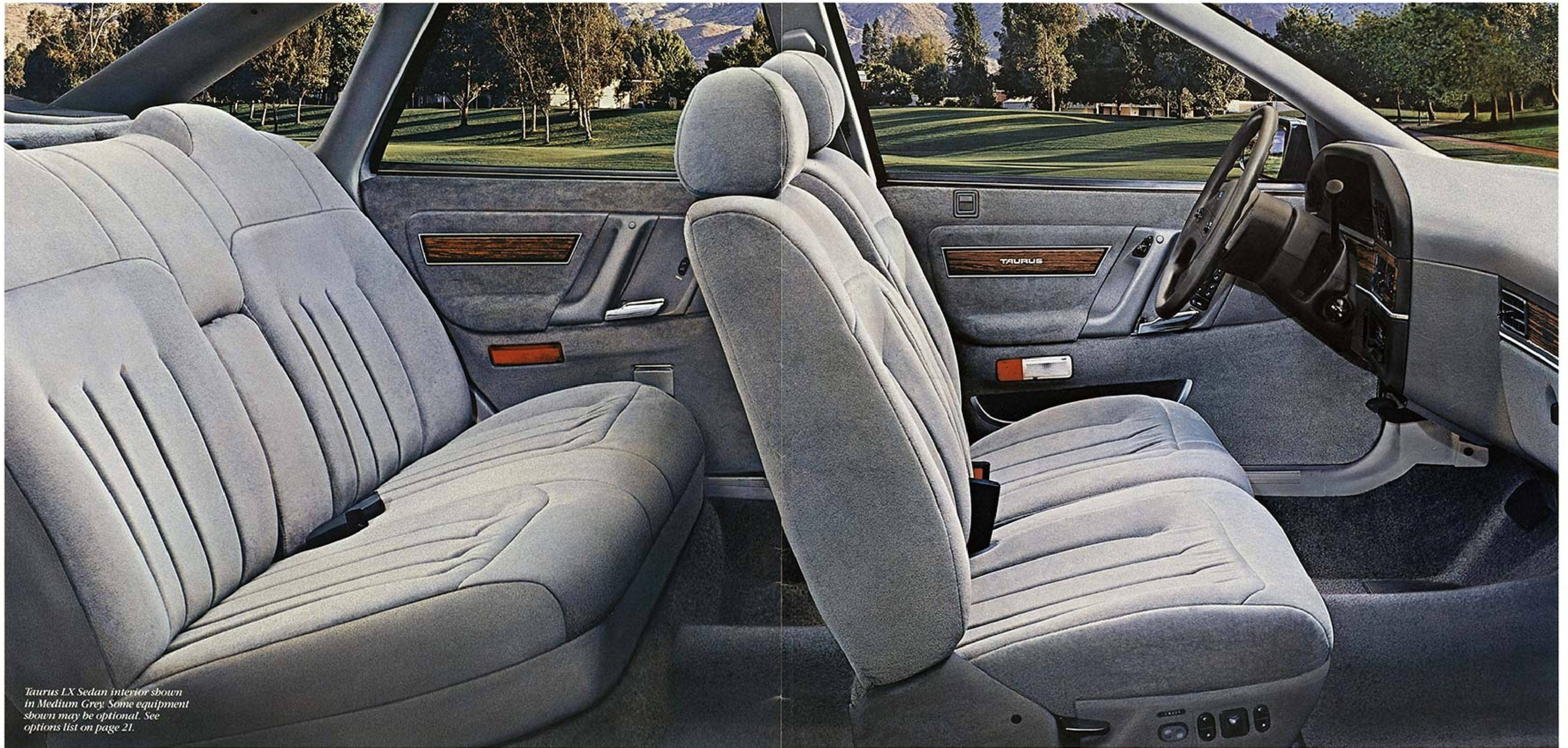
Taurus LX Sedan interior shown in Medium Grey. Some equipment shown may be optional. See options list on page 21.