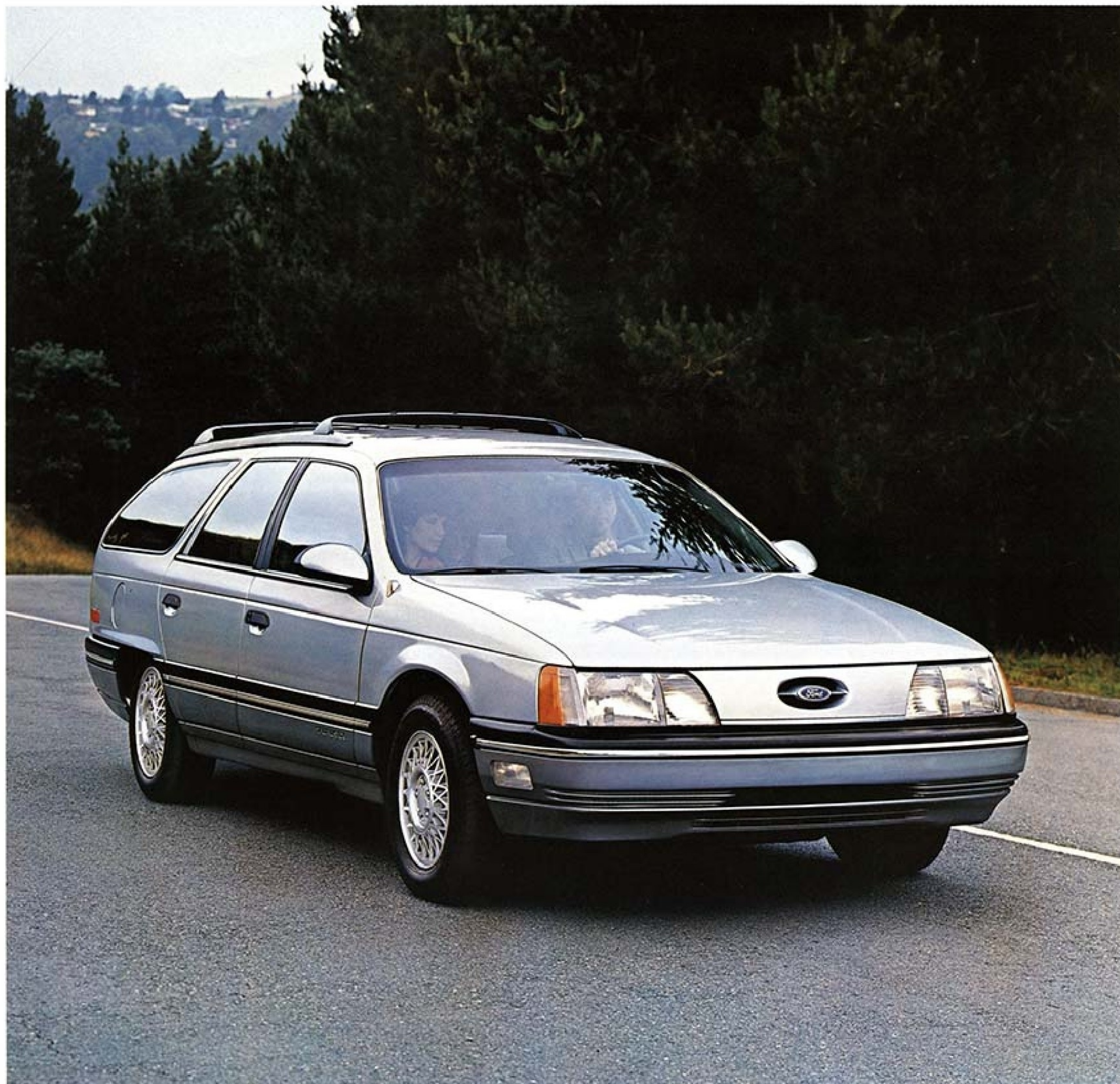
Left: Taurus LX Wagon shown in Silver Clearcoat Metallic.