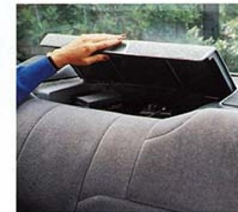
Some equipment shown may be optional. See options list on page 21.