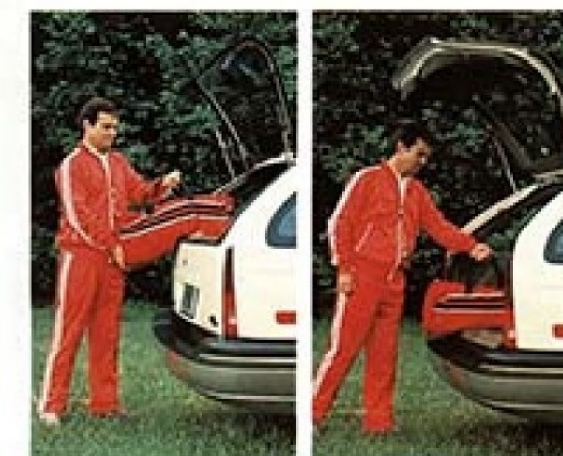
Some equipment shown may be optional. See options list on page 21.