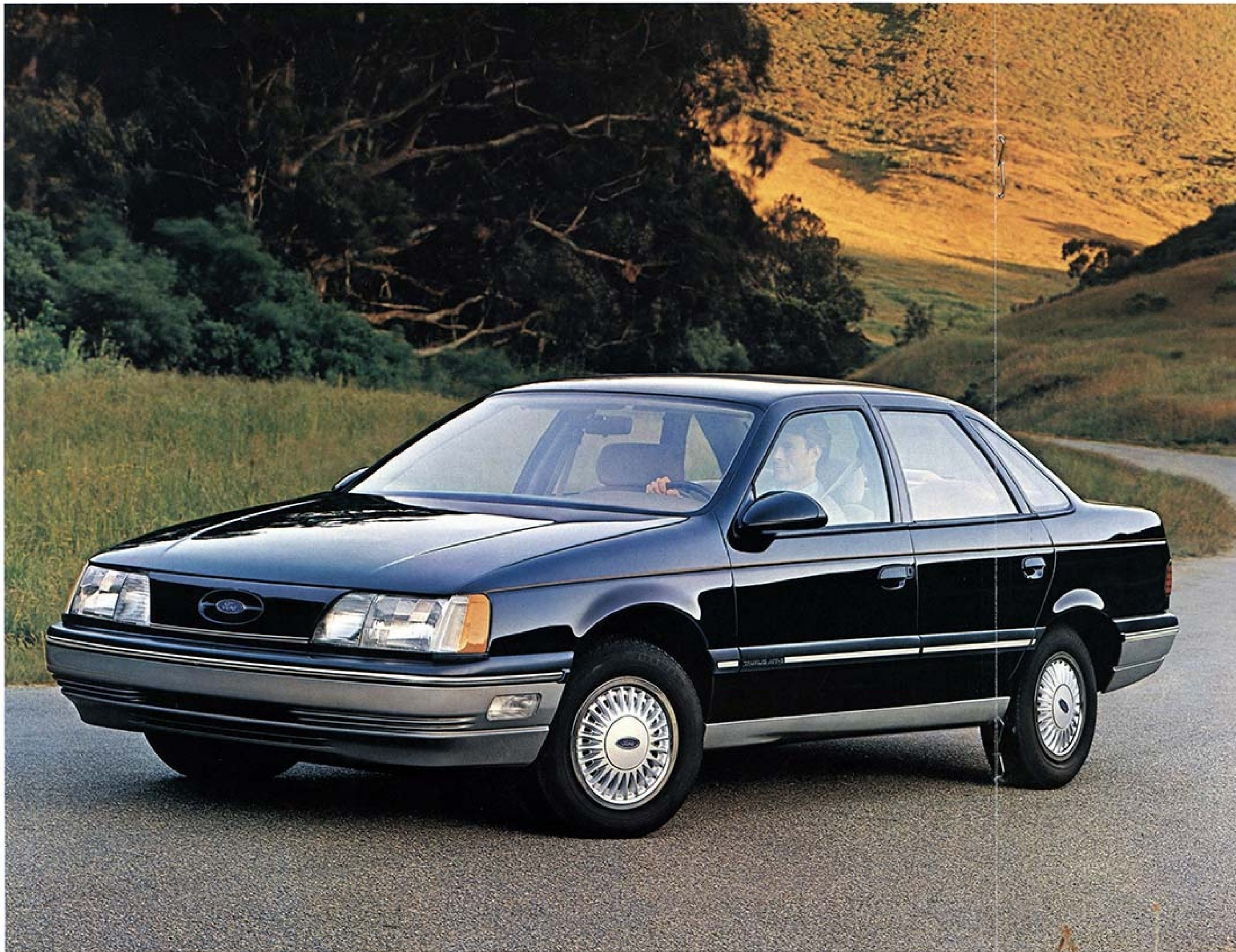
Left: Taurus MT-5 shown in Black.