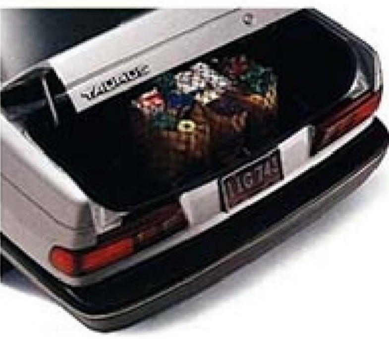
Below: Taurus LX Sedan luggage compartment with cargo net. Some equipment shown may be optional. See options list on page 21.