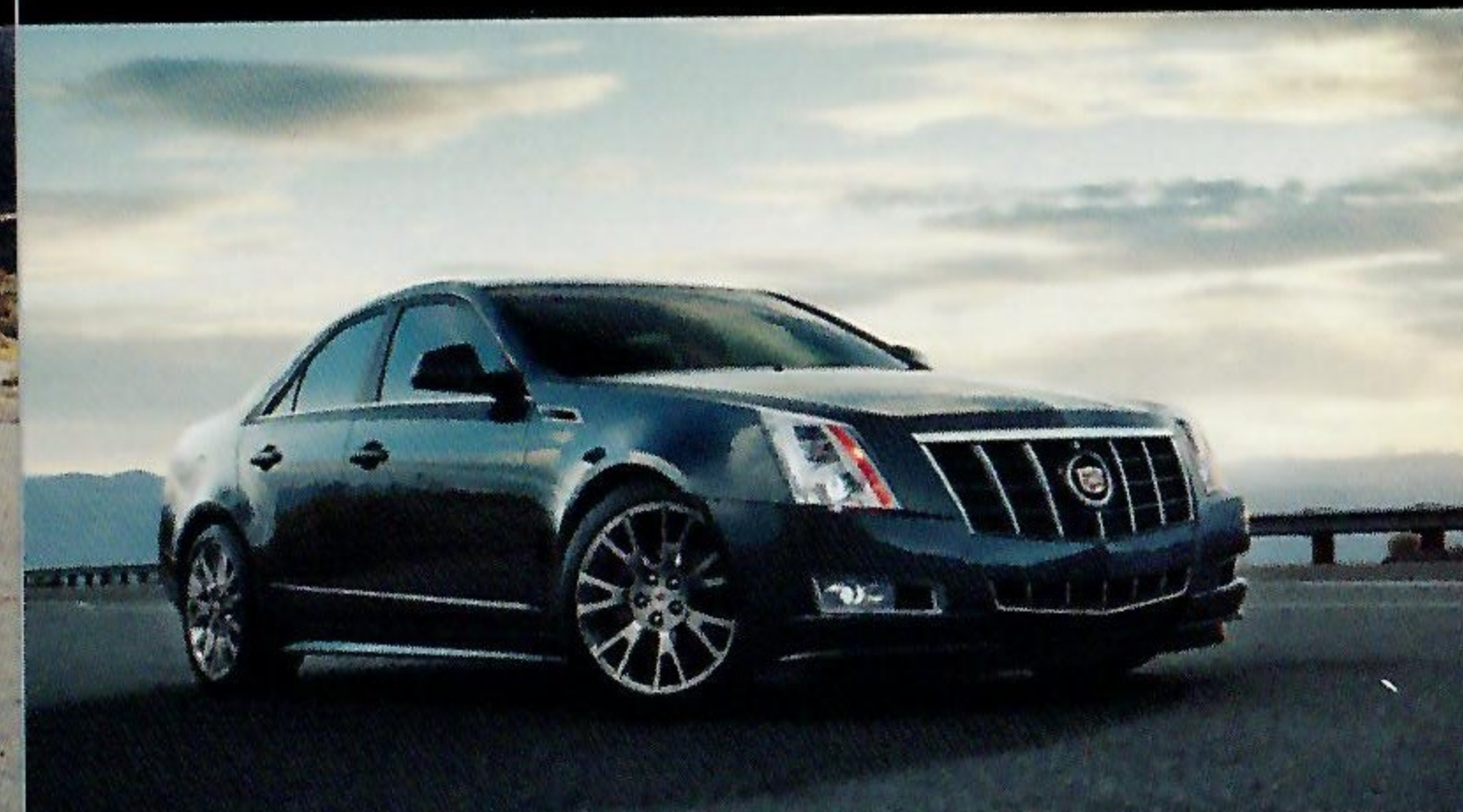
CTS SPORT SEDAN