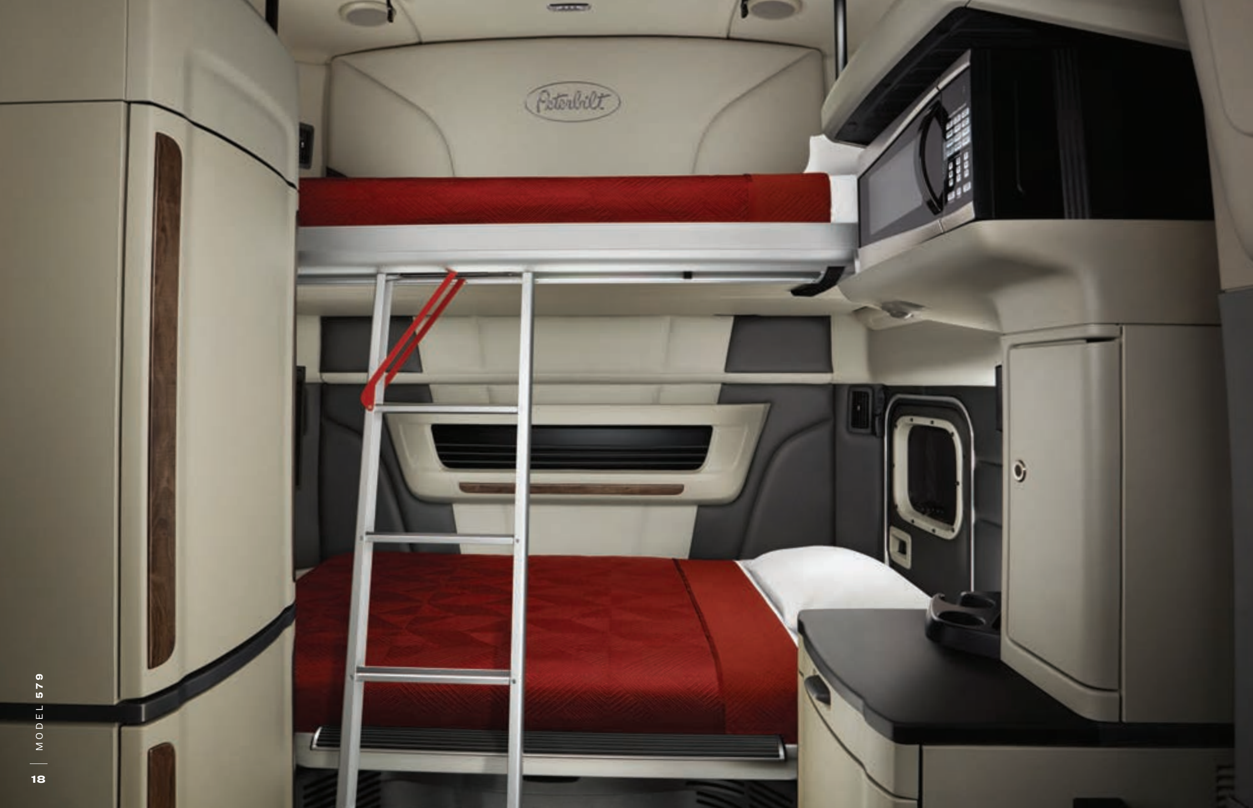
Flat-Panel TV Provision