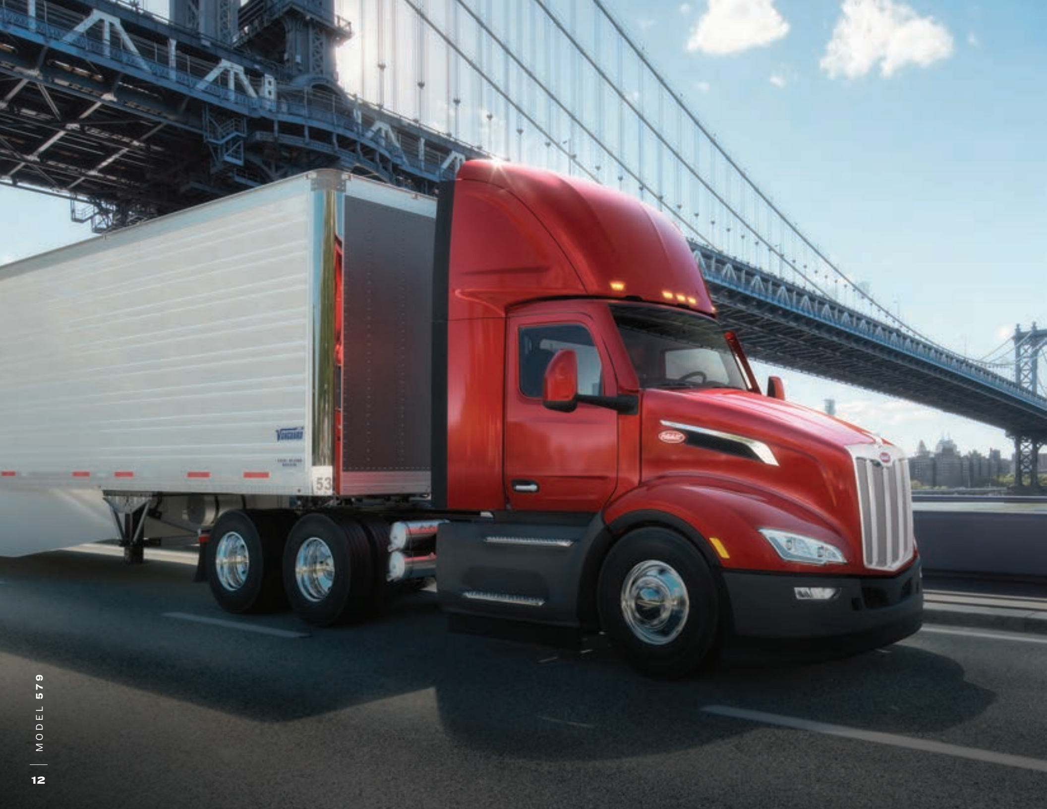
Lane Keeping Assist