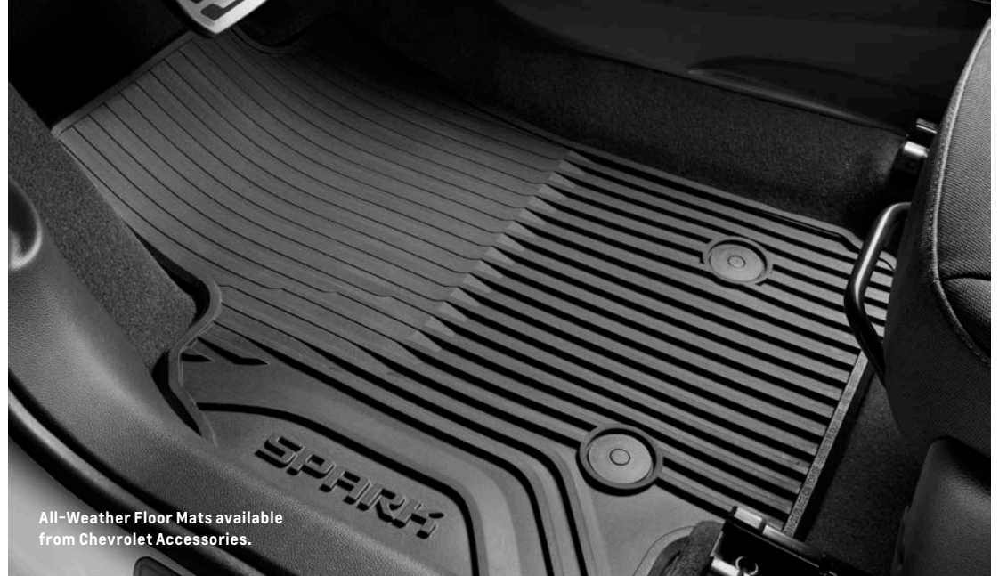
All-Weather Floor Mats available from Chevrolet Accessories.