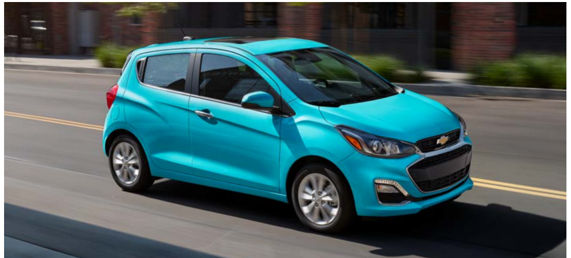
Spark 2LT in Mystic Blue (extra-cost color).

1 Chevrolet Infotainment System functionality varies by model. Full functionality requires compatible Bluetooth and smartphone, and USB connectivity for some devices. 2 Vehicle user interface is a product of Apple and its terms and privacy statements apply. Requires compatible iPhone and data plan rates apply. 3 Vehicle user interface is a product of Google, and its terms and privacy statements apply. Requires the Android Auto app on Google Play and a compatible Android smartphone. Data plan rates apply. You can check which smartphones are compatible at g.co/androidauto/requirements . 4 Service varies with conditions and location. Requires active service and paid AT&T data plan. Visit onstar.com for details and limitations. 5 Not compatible with all devices. 6 Cargo and load capacity limited by weight and distribution. 7 Safety or driver assistance features are no substitute for the driver's responsibility to operate the vehicle in a safe manner. Read the vehicle Owner's Manual for important feature limitations and information.