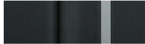
Jet Black Leatherette with Dark Anderson Silver Accent Stripe and Accent Trim