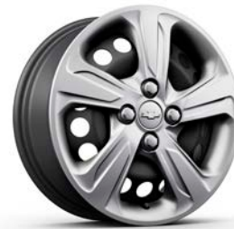
15" Steel Wheels with Painted Wheel Covers Standard on LS