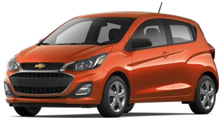
Cayenne Orange 1