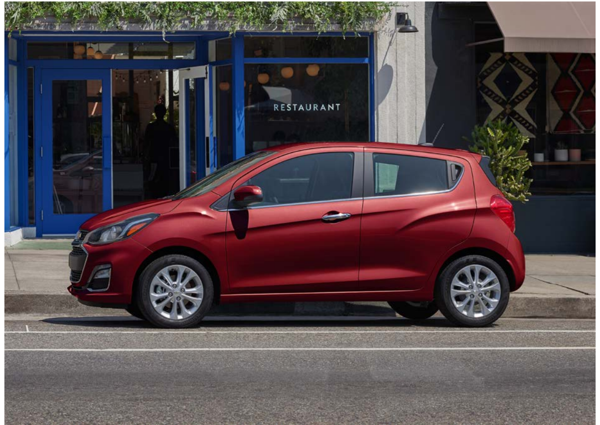
Spark 2LT in Crimson.

Going small can be the fastest way to keep up in today's world. Chevrolet Spark is not only fun to drive, but it also fits almost anywhere you want to go, with space for friends and fun. Spark offers innovative safety features and smart technologies that help keep you connected along the way. Better yet, you'll now have your pick of all those too-small-for-everybody-else parking spots.