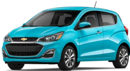
Mystic Blue 1