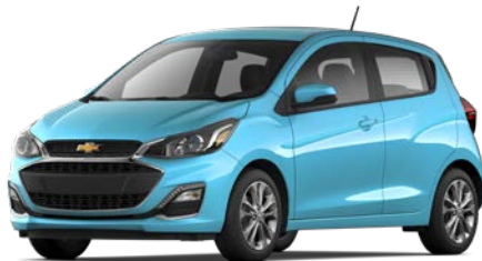
Mystic Blue 1