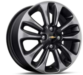
15" Black-Painted Machined-Finish Aluminum Wheels Available on 1LT with Spark Special Edition