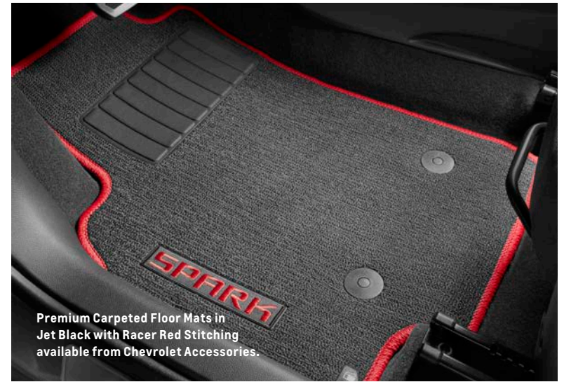
Premium Carpeted Floor Mats in Jet Black with Racer Red Stitching available from Chevrolet Accessories.