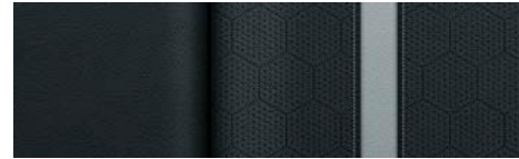
Jet Black Leatherette with Dark Anderson Silver Accent Stripe and Accent Trim