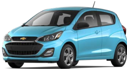
Mystic Blue 1