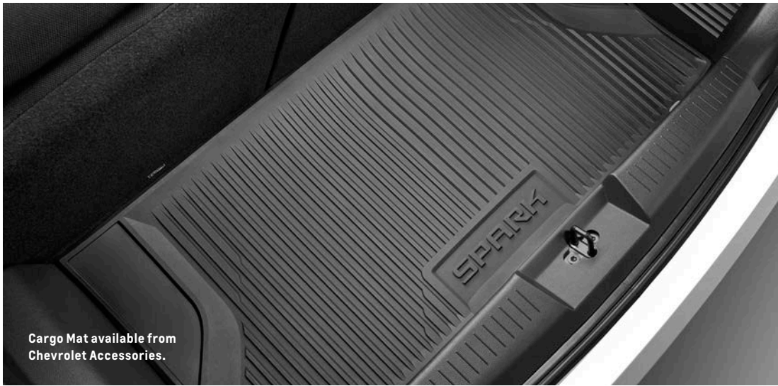
Cargo Mat available from Chevrolet Accessories.