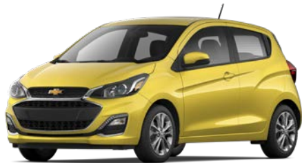
Nitro Yellow 1