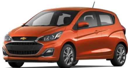
Cayenne Orange 1