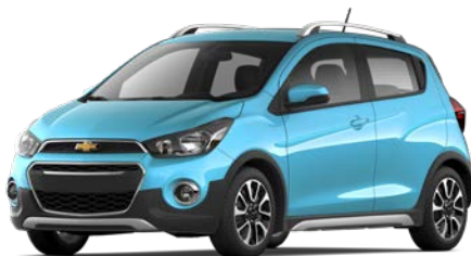
Mystic Blue 1