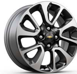
15" Gunmetal Silver-Painted Aluminum Wheels Standard on ACTIV