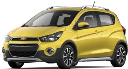
Nitro Yellow 1