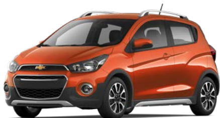
Cayenne Orange 1