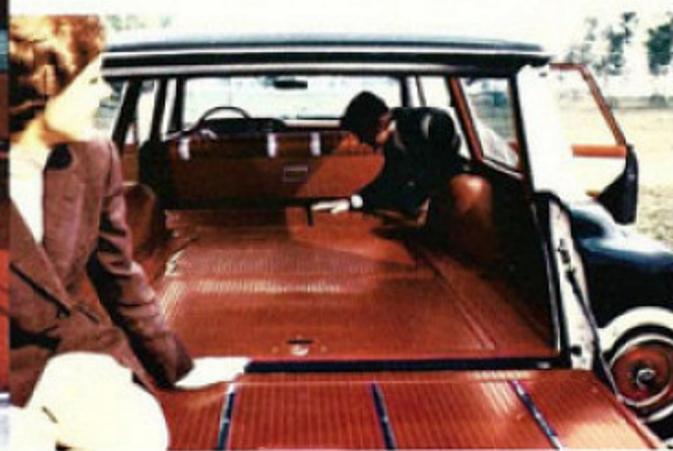
8. BOWLING ALLEY LOADSPACE