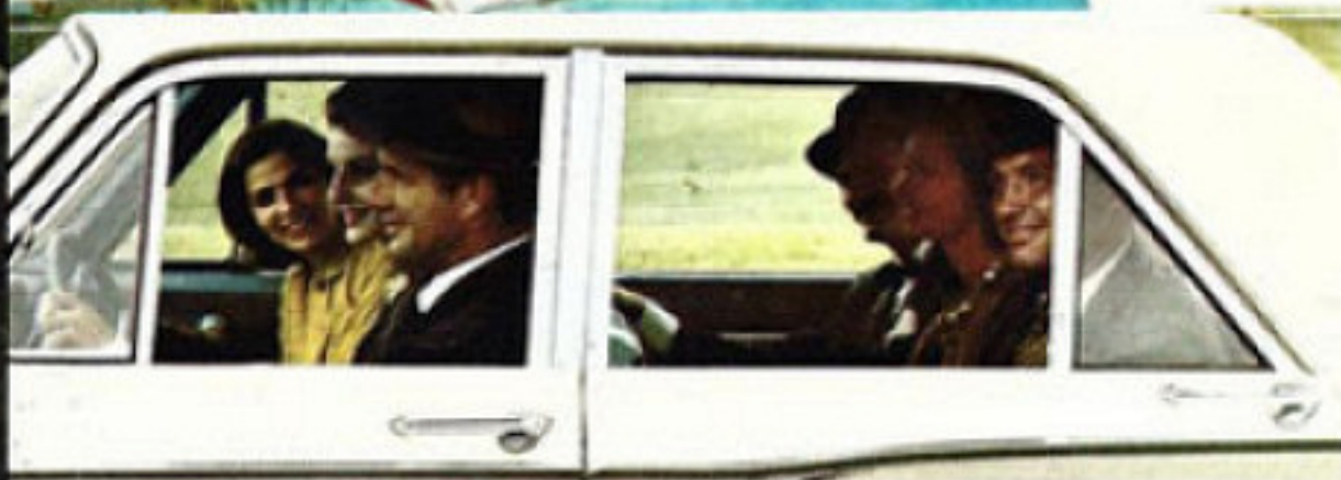
14. ROOMY 6-PASSENGER COMFORT... SPACIOUS TRUNK