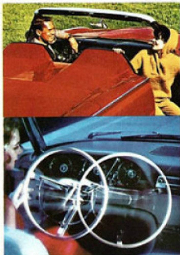
1. STYLING ORIGINALITY: SPORTS ROADSTER