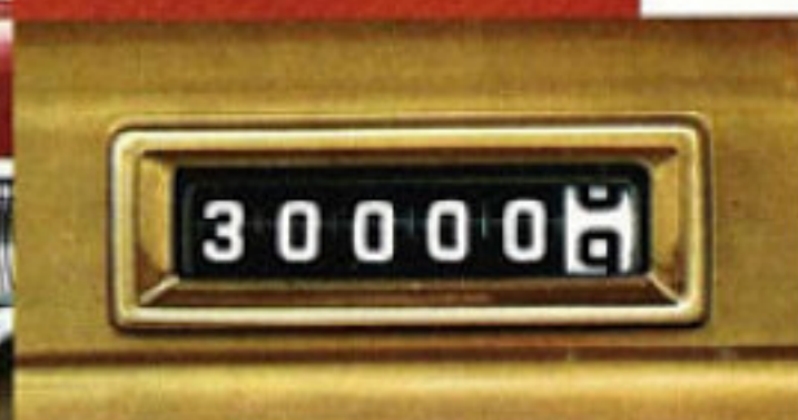
5. 30,000 and 6,000—MAGIC FORD NUMBERS