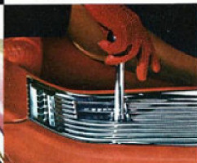
6. GALAXIE 500/XL COMMAND CONSOLE (standard: Cruise-O-Matic with "sports stick")