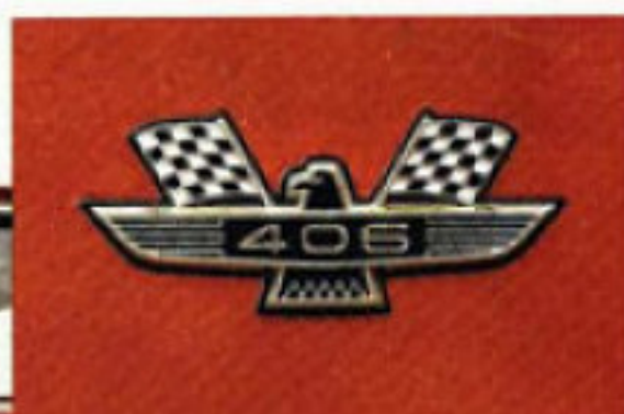
4. THUNDERBIRD V-8 PERFORMANCE