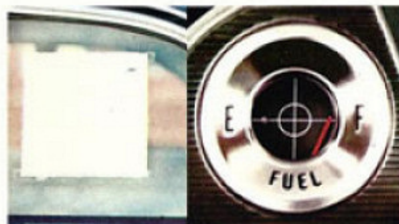
9. TRADITIONAL PRICE TAG SAVINGS