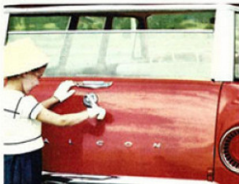
11. MODERN ROLL-DOWN TAILGATE WINDOW