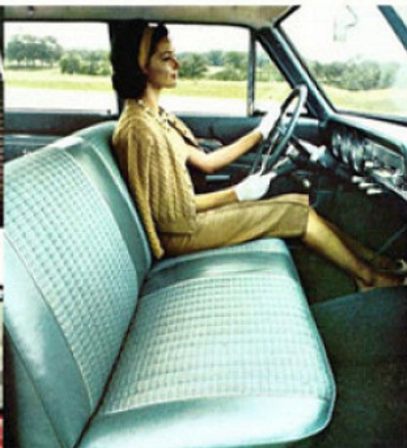
12. FAIRLANES AND FAIRLANE 500's: THE ONLY CARS OF THEIR KIND—IN A CLASS BY THEMSELVES