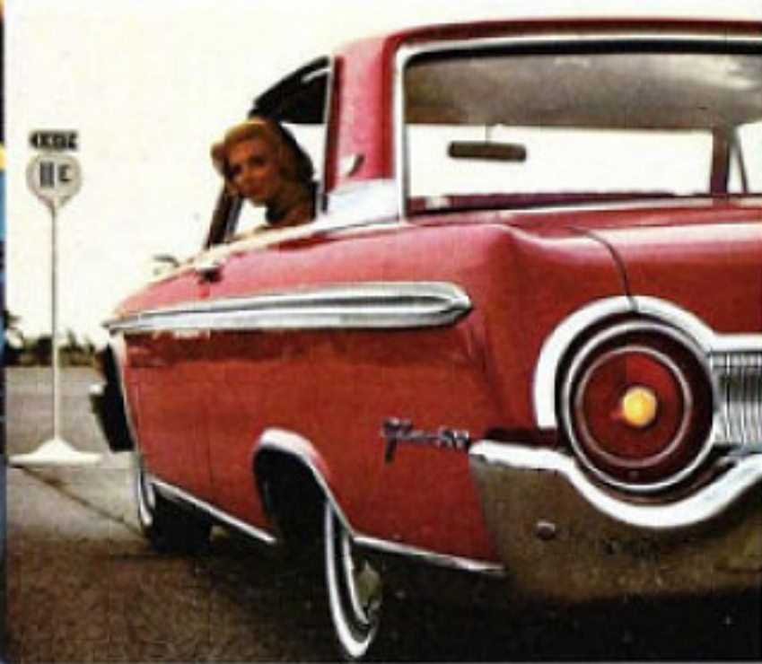
3. SELF-ADJUSTING BRAKES