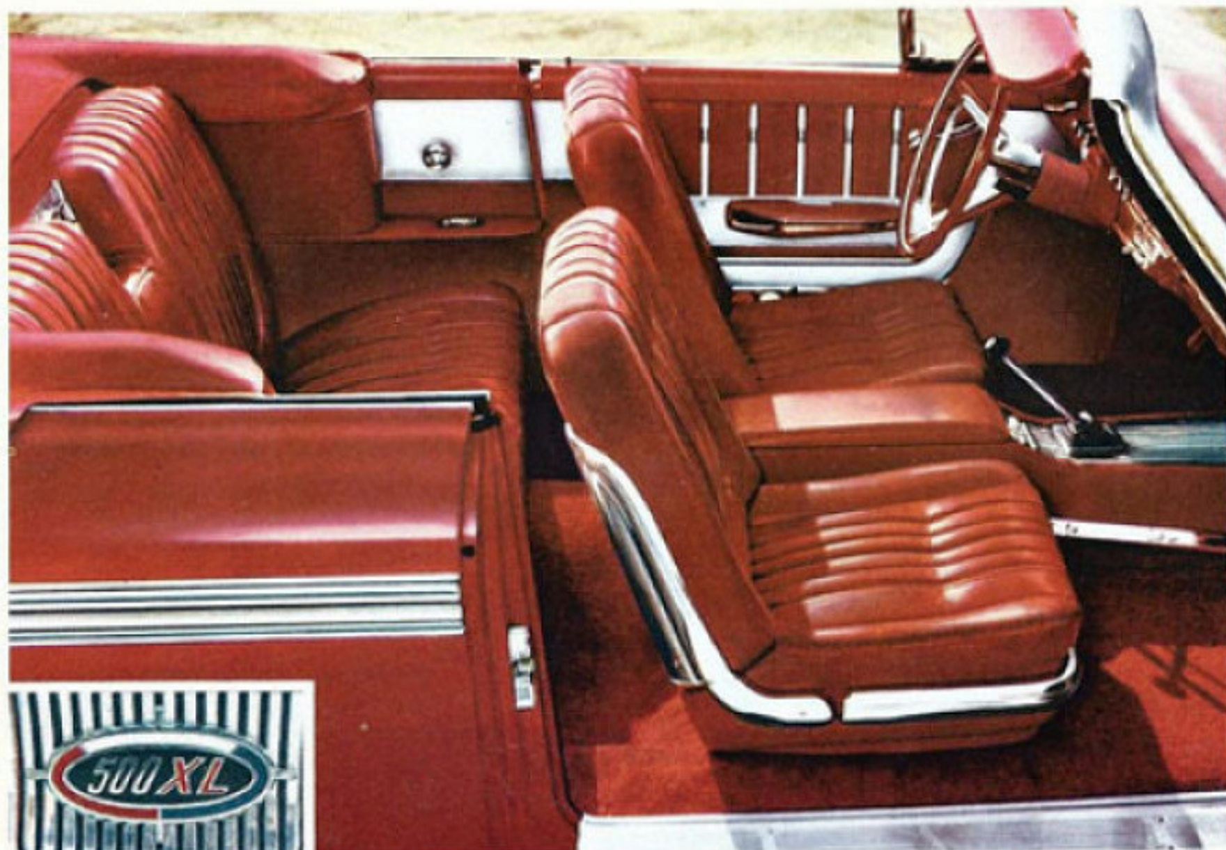
7. GALAXIE 500/XL... QUEEN OF THE "LIVELY ONES" FROM FORD (shown with optional 4-Speed stick shift)