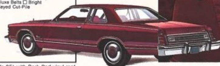
LTD Landau 2-Door Hardtop in Candyapple Red (Code 2E) with Dark Red vinyl roof.

Impressive standard Landau interior features a soft, yet durable, luxurious Niles Knit Cloth shown in Dark Red (Code HD). Black, Blue, Green, Saddle or Tan are other color choices. All-vinyl trim, in the same colors, except Black, is optional. White all-vinyl can be ordered on 2-Door models. Flight bench seat, with a single plush center armrest, is deep-cushioned for comfort. Note padded door panels with woodtone accents. Convenience Group refinements like right- and left-hand remote control mirrors, automatic parking brake release, electric trunk lid release, and more.