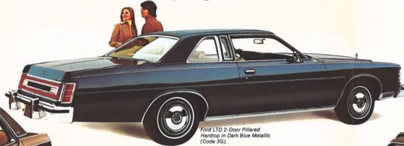
Ford LTD 2-Door Pillared Hardtop in Dark Blue Metallic (Code 3G).

Roomy, six-passenger comfort. In 2-Door or 4-Door Pillared Hardtop. With the luxury and convenience features that have long been associated with LTD. Plus even greater news.