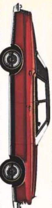
LTD BROUGHAM 4-Door Pillared Hardtop, Candyapple Red (Code 2E)