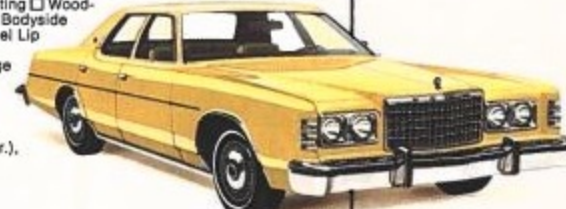
LTD 4-Door Pillared Hardtop in Light Green (Code 47).

Wheelbase 121.0" □ Length 223.9" □ Height 53.7" (2-Dr.), 54.3" (4-Dr.) □ Width 79.5" □ Fuel Capacity (gal.) 20 □ Curb Weight (lb.) 2-Dr. Pillared Hardtop 4528, 4-Dr. Pillared Hardtop 4580 □ Passenger Capacity—6.