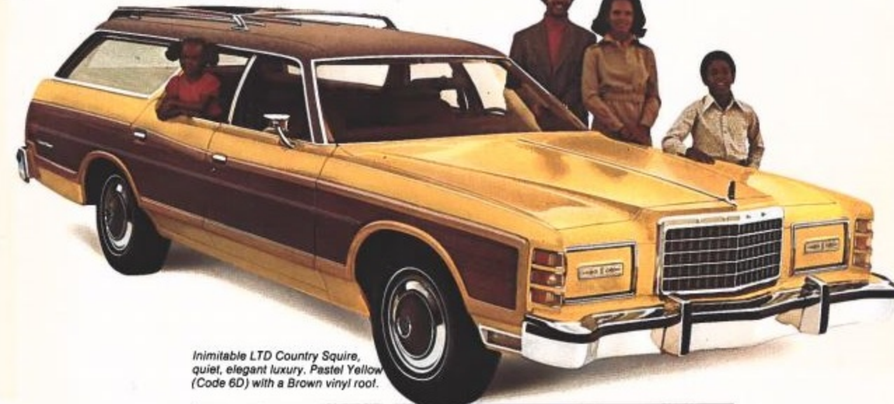
Inimitable LTD Country Squire, quiet, elegant luxury. Pastel Yellow (Code 6D) with a Brown vinyl roof.

A wide array of options is listed on page 11. Complete Wagon details are in the 1975 Wagon catalog, available at your Ford Dealer's.