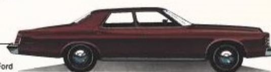
Ford Custom 500 4-Door Pillared Hardtop in Ginger Glow (Code 5J).