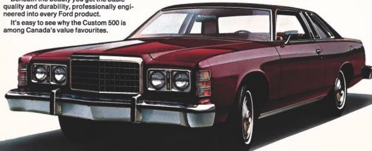
Ford Custom 500 2-Door Pillared Hardtop in Maroon Metallic (Code 2Q) with Red vinyl roof.

It's easy to see why the Custom 500 is among Canada's value favourites.