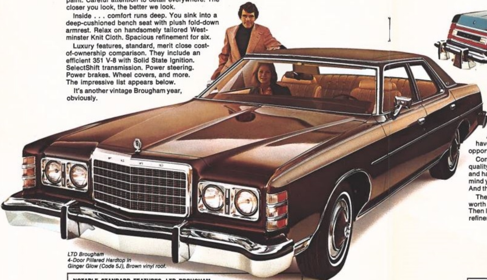
LTD Brougham 4-Door Pillared Hardtop in Ginger Glow (Code 5J), Brown vinyl roof.

It's another vintage Brougham year, obviously.