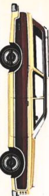
Wagonmaster Wagons: LTD Country Squire, 4-Door, Pastel Yellow (Code 6D), LTD Wagon, Custom 500 Wagon

The closer you look, the better we look.