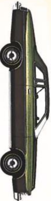
FORD LTD 2-Door Pillared Hardtop, Dark Yellow Green Metallic (Code 4V)