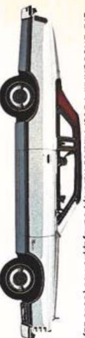
LTD LANDAU 2-Door Pillared Hardtop, Silver Metallic (Code 1G)