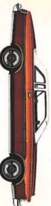
LTD BROUGHAM 2-Door Pillared Hardtop, Dark Copper Metallic (Code 5Y)