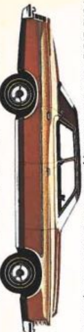
FORD-LTD 4-Door Pillared Hardtop, Tan Glow (Code 5U)