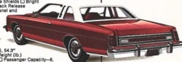
LTD Brougham 2-Door Pillared Hardtop in Candyapple Red (Code 2E), White vinyl roof.

Wheelbase 121.0" □ Length 223.9" □ Height 53.7" (2-Dr.), 54.3" (4-Dr.) □ Width 79.5" □ Fuel Capacity (gal.) 20 □ Curb Weight (lb.) 2-Dr. Pillared Hardtop 4585, 4-Dr. Pillared Hardtop 4598 □ Passenger Capacity—6.