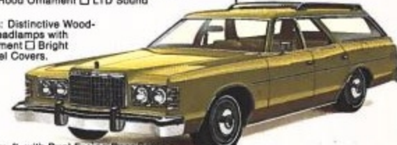
Popular LTD Wagon in Green Glow (Code 4T) is big on quality, comfort and ride.

*Plus 9.1 cu. ft. of lockable below-deck storage, and 5.4 cu. ft. with Dual Facing Rear Seats.