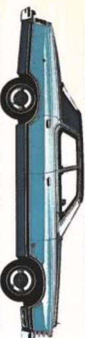
LTD LANDAU 4-Door Pillared Hardtop, Silver Blue Glow (Code 3M)