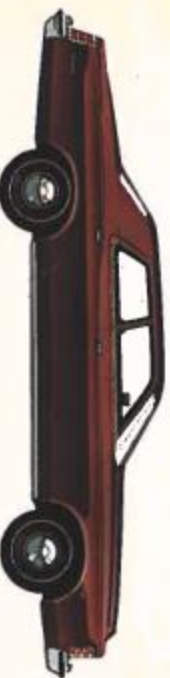
Custom 500 4-Door Pillared Hardtop, Ginger Glow (Code SJ) Custom 500 2-Door Pillared Hardtop