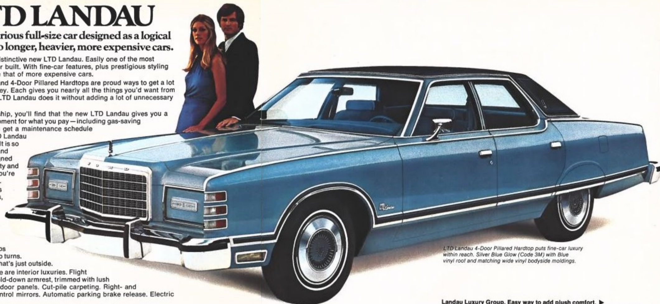
LTD Landau 4-Door Pillared Hardtop puts fine-car luxury within reach. Silver Blue Glow (Code 3M) with Blue vinyl roof and matching wide vinyl bodyside moldings.

Wheelbase 121.0" □ Length 223.9" □ Height 53.7" (2-Dr.), 54.6" (4-Dr.) □ Width 79.5" □ Fuel Capacity (gal.) 20 □ Curb Weight (lb.) 2-Dr. Pillared Hardtop 4625, 4-Dr. Pillared Hardtop 4657 □ Passenger Capacity—6.