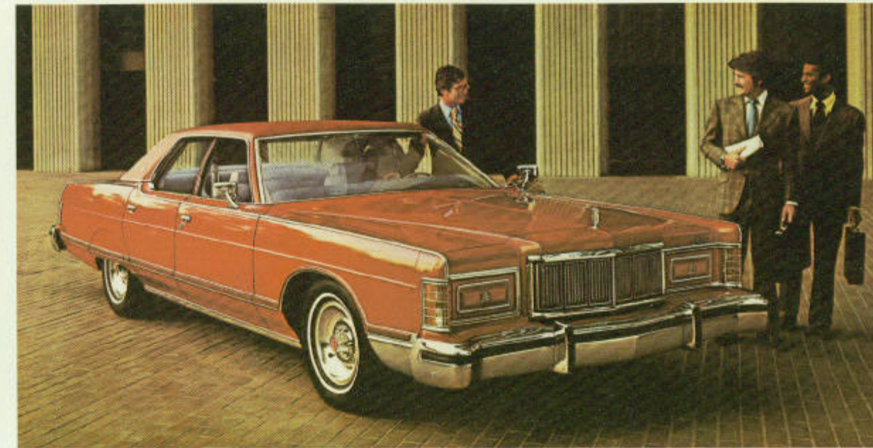
Mercury Grand Marquis