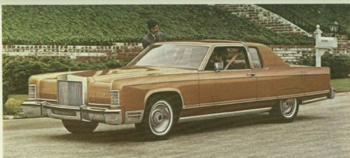
Continental Town Coupé

The Town Car shown in the lower illustration to the right also offers a full measure of comforts you've come to rely on. Thoughtful features such as a six-way power assist seat. There's an AM/FM monaural radio with four speakers and power antenna to keep you company. Plus an Automatic Temperature Control system for your comfort all year long. The Lincoln Continental Town Car also features a full vinyl roof complete with coach lamps. As in all Continentals for 1977, you'll feel right at home. Wide, deeply padded seats. Ample headroom. Accommodatingly wide doors. The interior shown to the right is the optional leather/vinyl Twin Comfort Lounge Seats. This luxurious interior provides both you and your passenger with the convenience of illuminated visor vanity