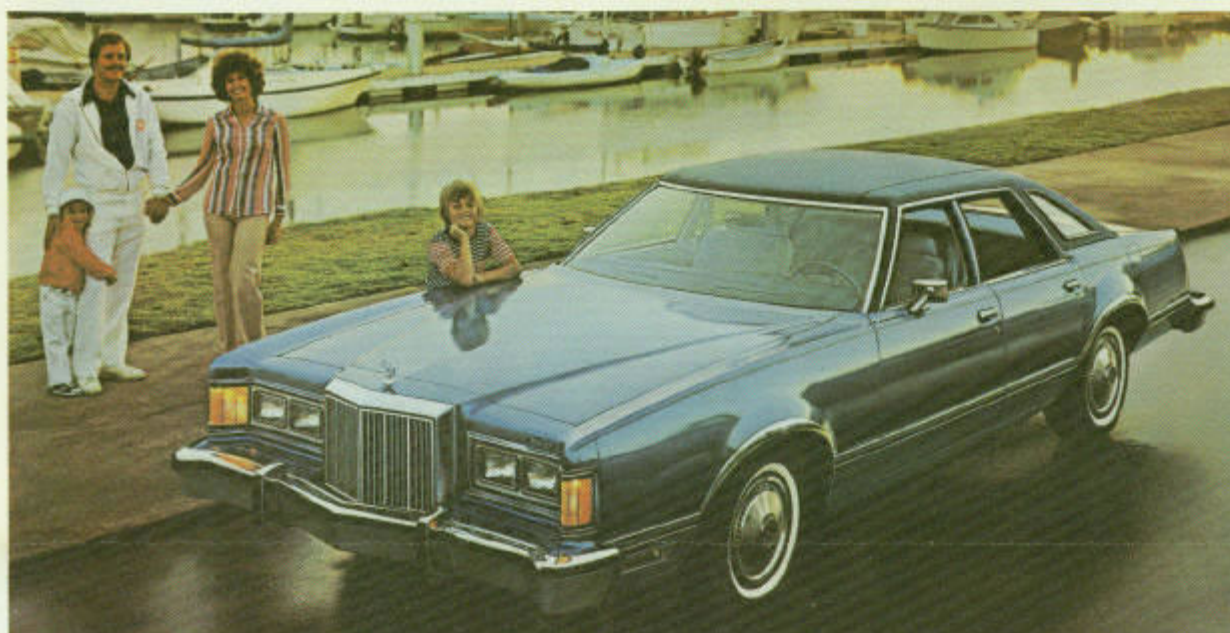
Mercury Cougar Brougham 4-door

Here for '77, is a bold new symbol of driving excitement: Mercury Cougar XR-7. Bold. Aggressive. New. With stunning looks, sporty lines and a sweeping list of exciting standard appointments. A car so unique that it has inspired the Cat Set—that loyal group of Cougar owners who will settle for nothing less than the superb craftsmanship and styling inherent in the Cougar XR-7 and its six new running mates. And they are all "Ride-Engineered by Lincoln-Mercury."