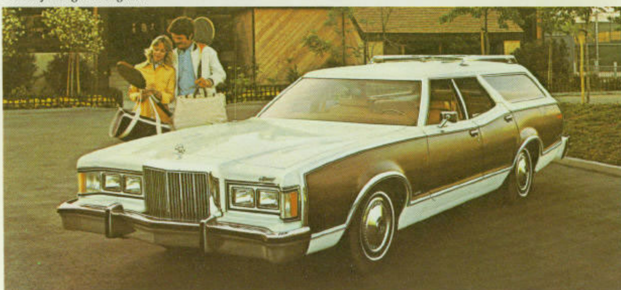
Mercury Cougar Villager