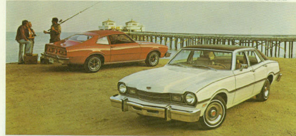
Comet 2-door and Comet 4-door with Custom Option