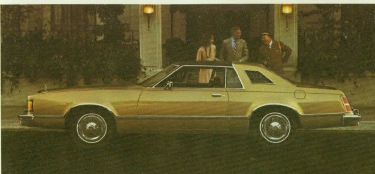
Mercury Cougar Brougham

This is the Brougham Decor option with Twin