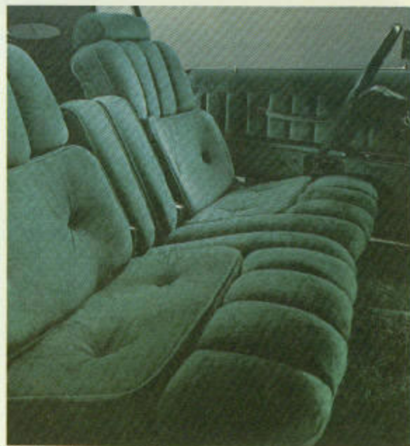
Optional Majestic Velour Luxury Group

Options shown are dual wide-band white sidewalls, remote control right-hand mirror, illuminated entry system, turbine-styled cast aluminum wheels and custom paint stripes.