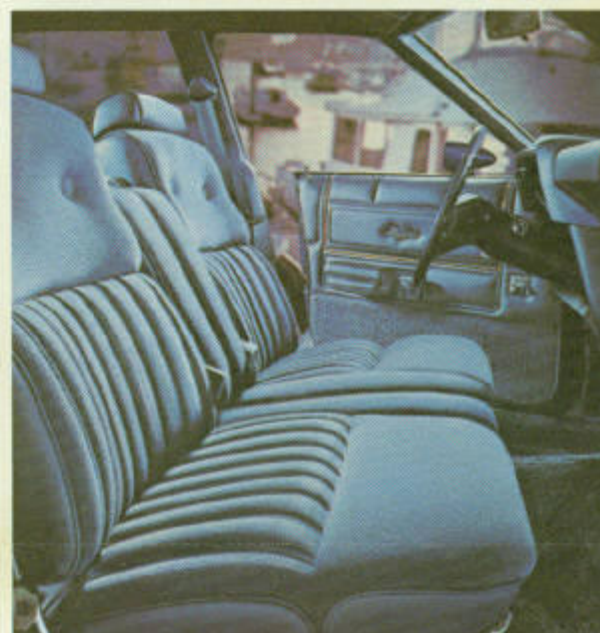
Optional Twin Comfort Lounge Seats

Options shown are decor group, bumper protection group, white sidewall tires, cornering lamps.