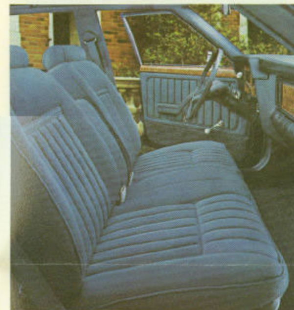
Flight Bench Seat Interior

Marquis is artfully designed to delight the senses