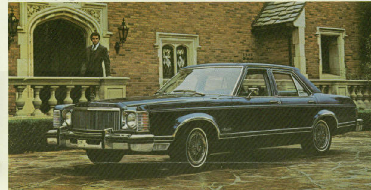
Mercury Monarch Ghia