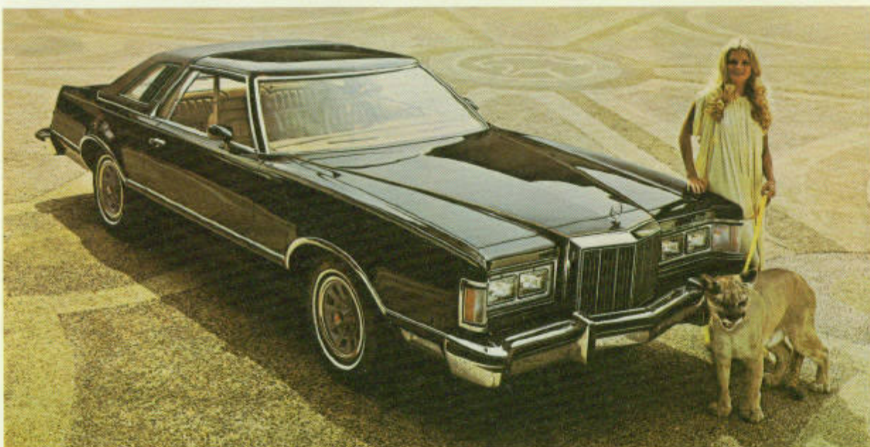
Cougar XR-7 with Decor Option