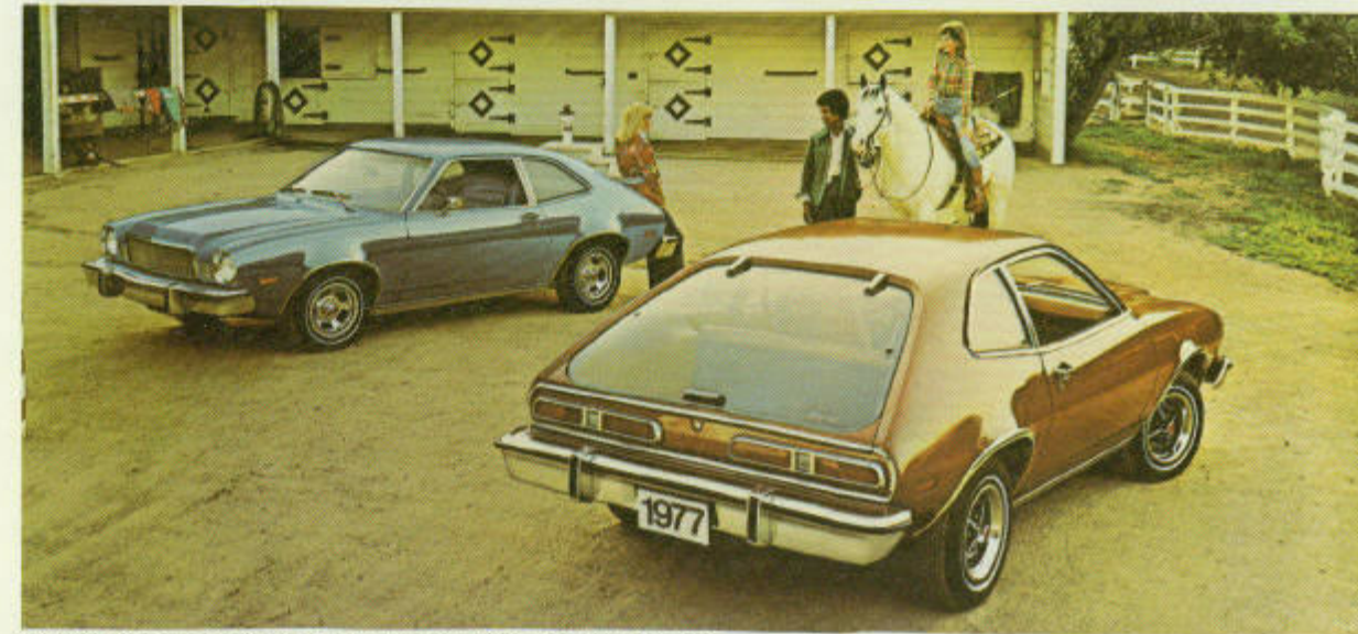
Bobcat 3-door and Bobcat 3-door with optional Glass Third Door.

Options shown on car on right are all-glass third door, styled steel wheels and trim rings, bumper protection group, white sidewall tires.