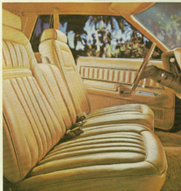
Optional Twin Comfort Lounge Seats

Consideration for your comfort and convenience is everywhere. Shown above is the optional XR-7 Decor Group with Twin Comfort Lounge Seats in chamois colored leather with vinyl, also available in dove grey, dark red, medium blue, jade, saddle or saddle/white, and white with your choice of color coordinated components.