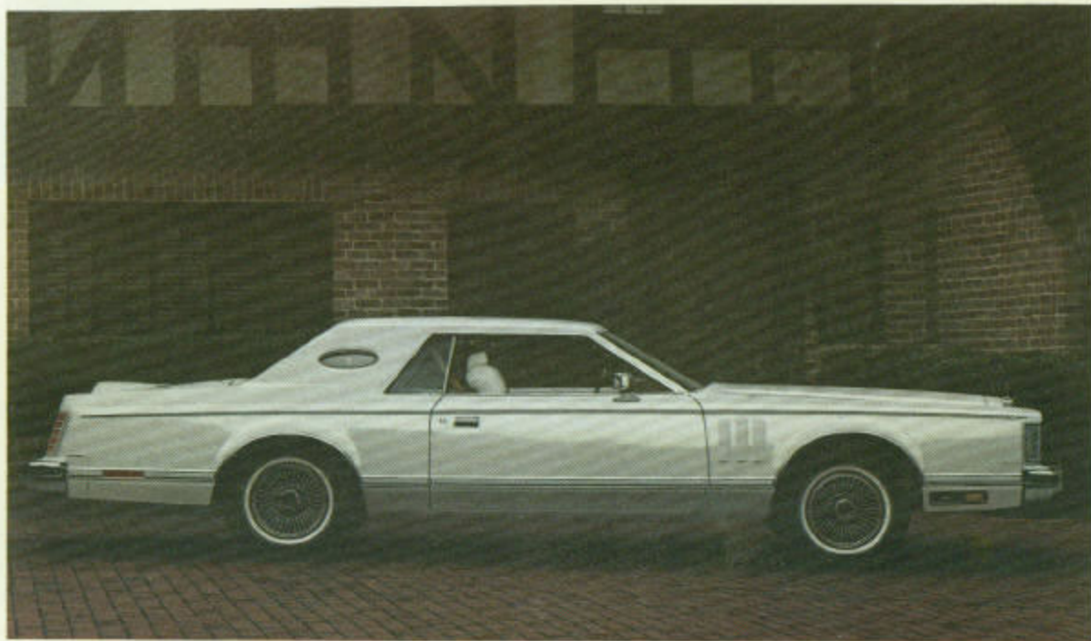
Continental Mark V

Again for 1977, some of the most significant designers in the world coordinated the colors and put their names on limited editions of the new Mark V. There's the Givenchy Edition Mark V... the Bill Blass Edition Mark V... the Pucci Edition Mark V... and the Cartier Edition Mark V. Each an expression of its creator's individuality and creativity. Each outstanding in its dramatic concept of personal luxury. And worthy of note, all Designer Series Marks feature turbine-styled cast aluminum wheels, six-way power seat for driver and passenger, and an owner personalized 22-karat gold finish instrument panel plaque.