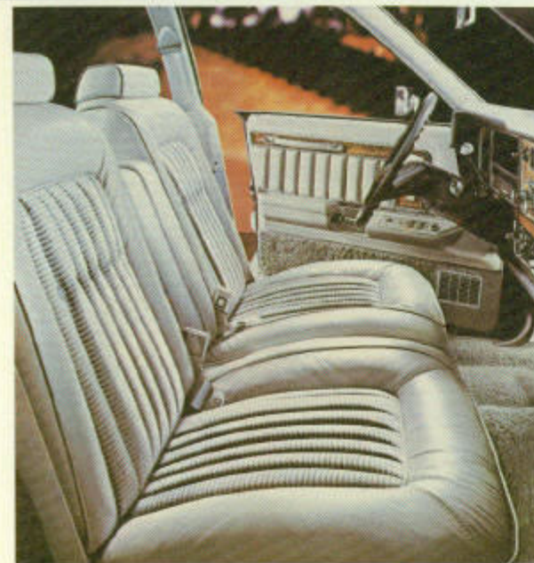
Twin Comfort Lounge Seats

Options shown are decor group, wide-band white sidewall tires, bumper protection group, cornering lamps, convenience group.