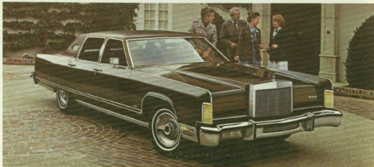
Continental Town Car

mirrors and six-way power seats. There's a recliner on the passenger side for extra comfort on long trips.