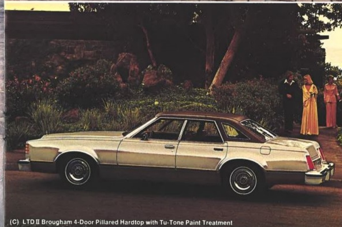
(C) LTD II Brougham 4-Door Pillared Hardtop with Tu-Tone Paint Treatment