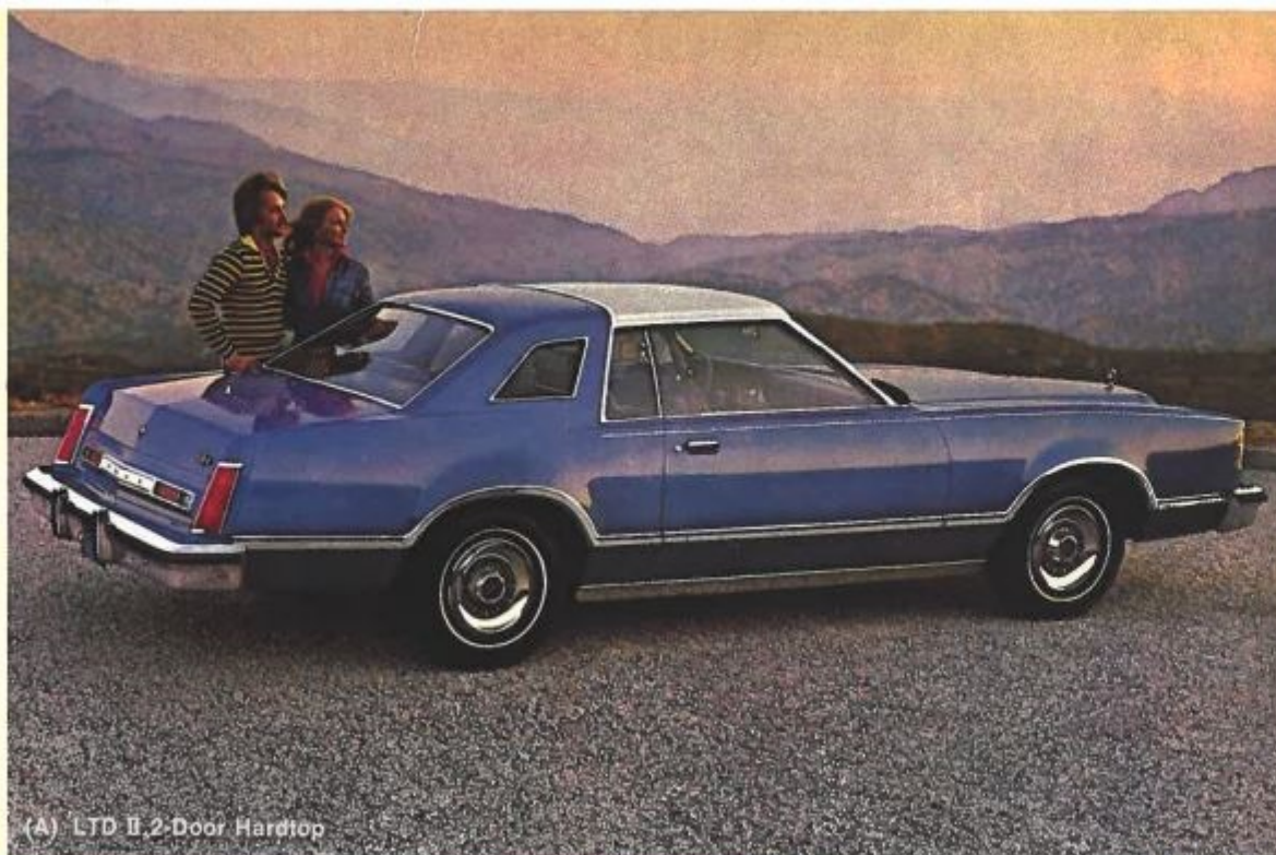
(A) LTD II 2-Door Hardtop

Some items shown are optional, such as dual sport mirrors, deluxe bumper group, left-hand remote control mirror, dual accent paint stripes, deluxe wheel covers, wide bright bodyside molding, cast aluminum wheels and WSW tires.