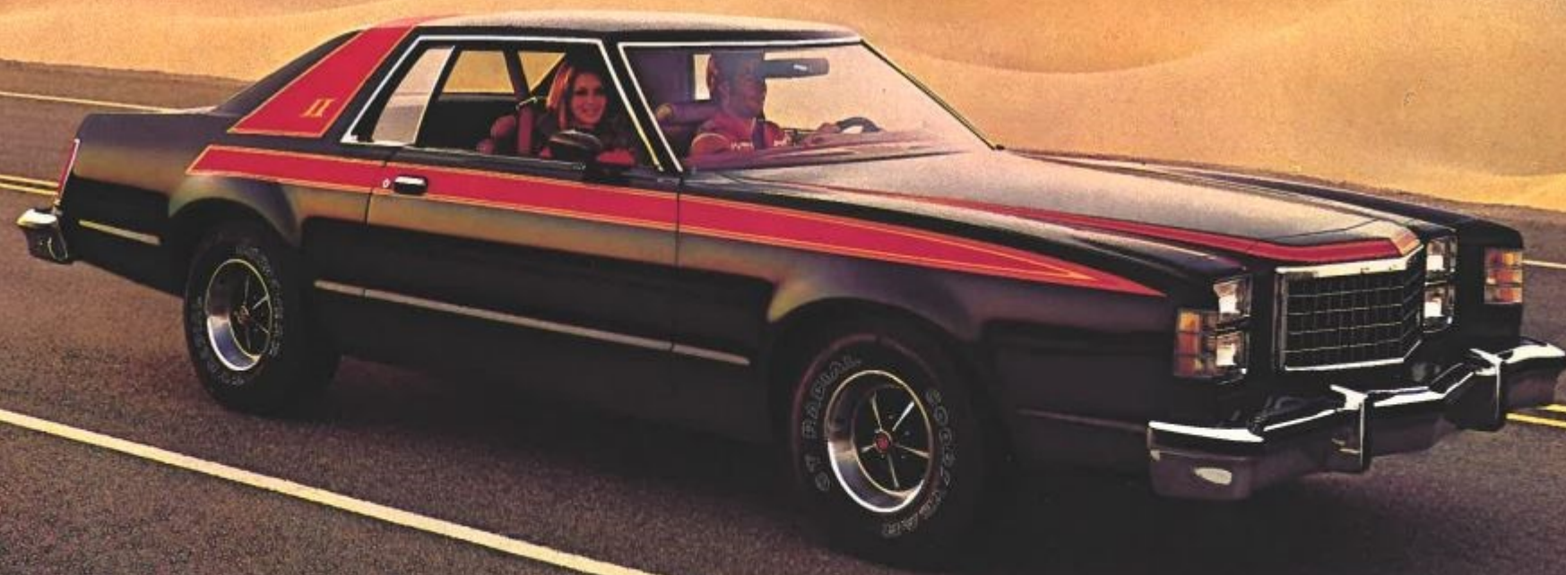
(A) LTD II S 2-Door Hardtop with Sports Appearance Package