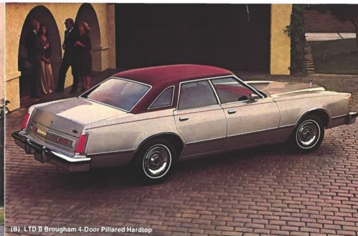
(B) LTD II Brougham 4-Door Pillared Hardtop