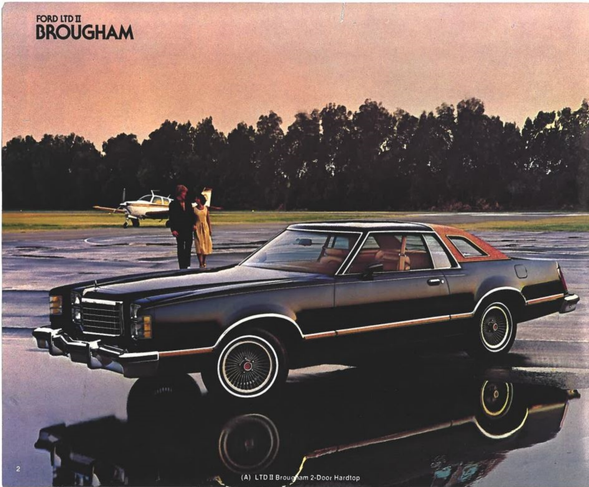
(A) LTD II Brougham 2-Door Hardtop