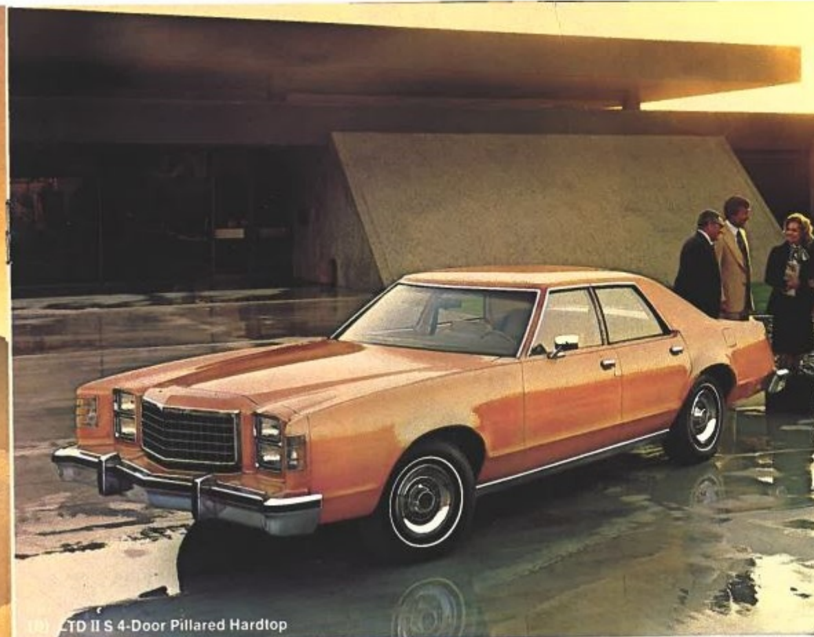
LTD II S 4-Door Pillared Hardtop