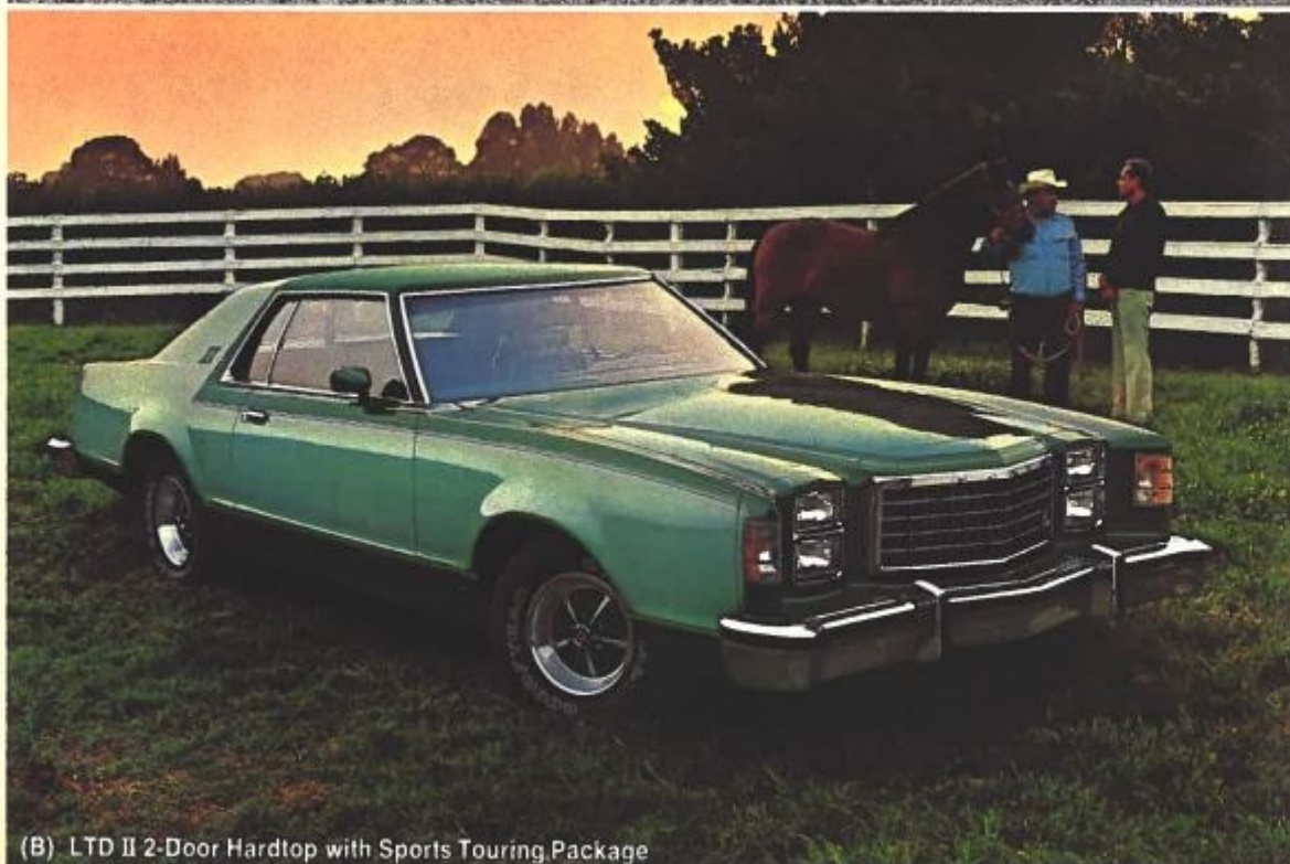
(B) LTD II 2-Door Hardtop with Sports Touring Package