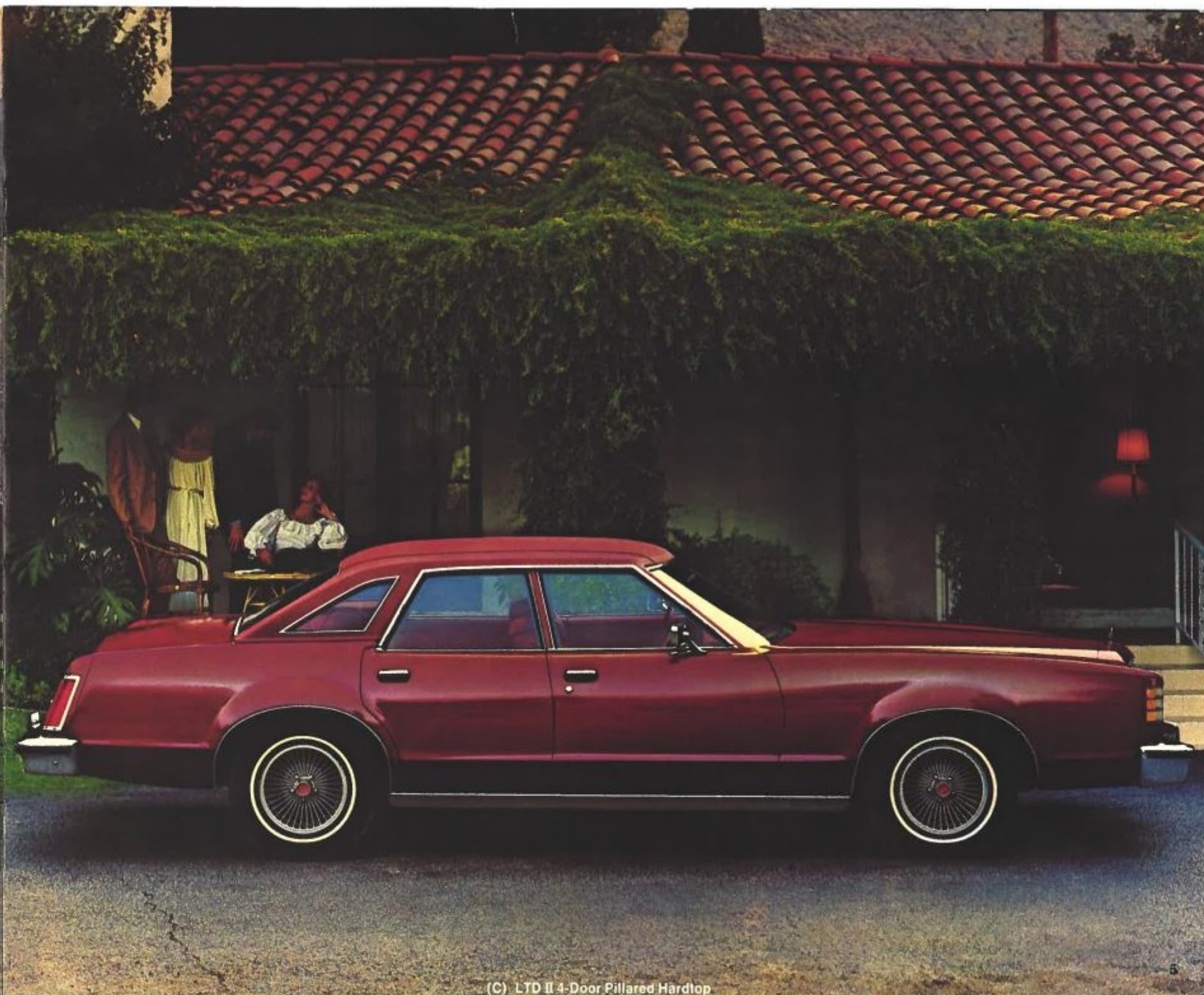
(C) LTD II 4-Door Pillared Hardtop