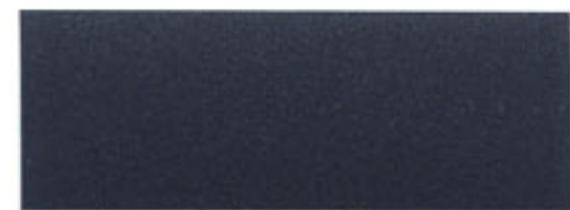
Amethyst Pearlescent Clearcoat Metallic KB Mark VII, Town Car, Continental