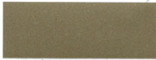
Champagne Pearlescent Clearcoat Metallic AD Town Car