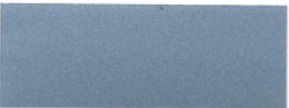
Crystal Blue Pearlescent Clearcoat Metallic MD Mark VII, Town Car, Continental