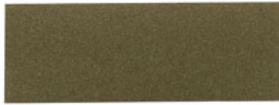
Aztec Gold Clearcoat Metallic AC Town Car