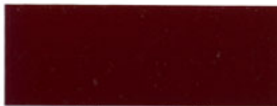
Garnet Red Clearcoat Metallic EG Mark VII, Continental