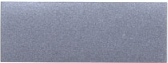
Silver Rosé Clearcoat Metallic EW Town Car, Continental