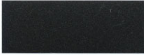
Graphite Clearcoat Metallic YG Mark VII, Town Car, Continental