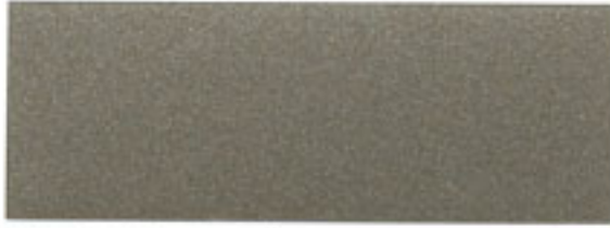
Light Mocha Pearlescent Clearcoat Metallic DD Mark VII, Continental