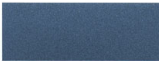
Regatta Blue Clearcoat Metallic ME Mark VII, Town Car