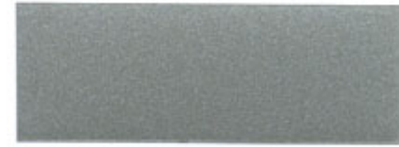
Titanium Pearlescent Clearcoat Metallic YX Mark VII, Town Car, Continental