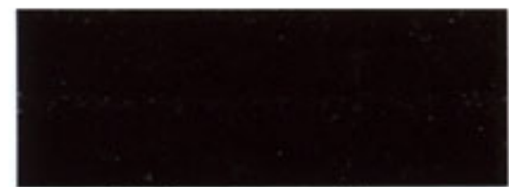
Burgundy Clearcoat Metallic ER Mark VII, Town Car, Continental