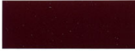
Cranberry Clearcoat Metallic EX Mark VII, Town Car, Continental