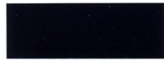
Twilight Blue Clearcoat Metallic MK Mark VII, Town Car, Continental