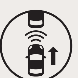
Forward Collision-Avoidance Assist (available with Pedestrian Detection)