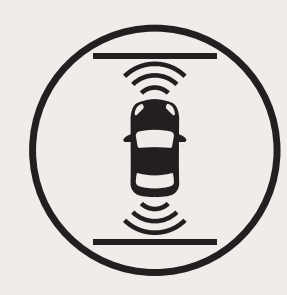
Parking Distance Warning – Front and Reverse