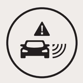
Blind-Spot Collision Warning with Lane Change Assist