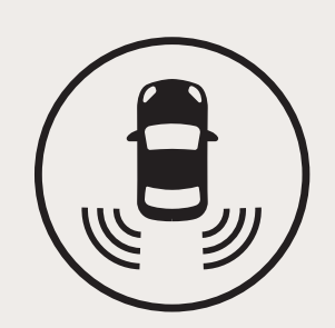
Rear Cross-Traffic Collision Warning