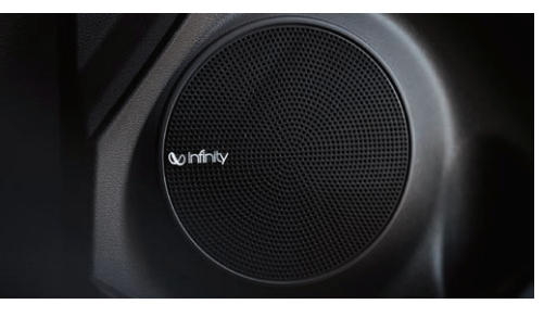
Available 8.0" Head-Up Display Available Infinity® premium audio system