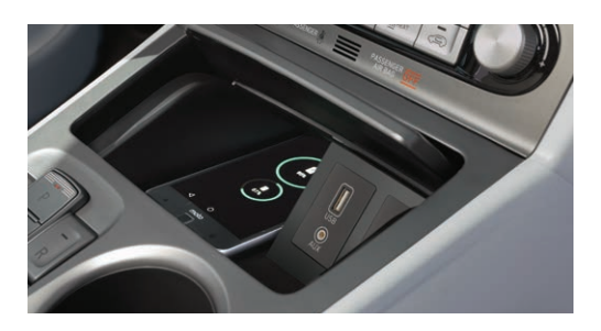
Available 10.25" touch-screen with navigation system Available wireless charging pad*