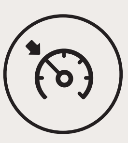
Adaptive Cruise Control with traffic stop and go