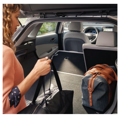
Available heated front seats Available ventilated front seats Standard 60/40 split-fold rear seats

Available heated steering wheel Available power sunroof