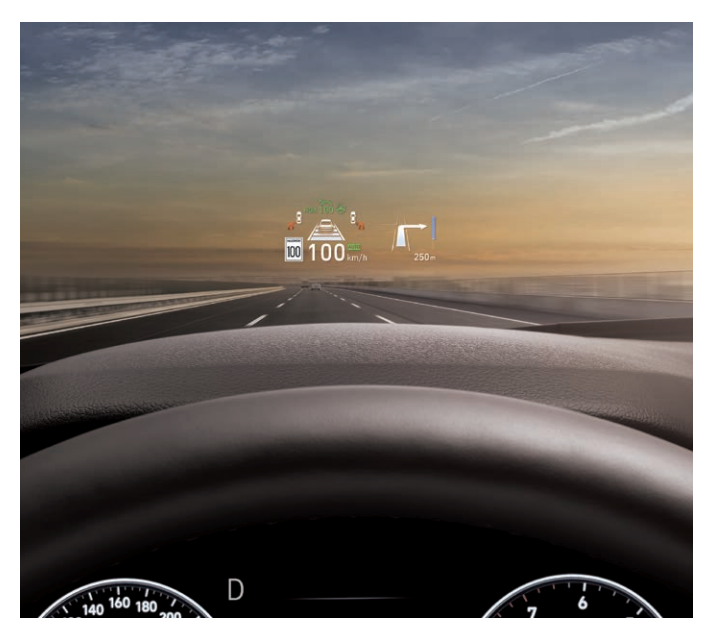
Available Head-Up Display

Front and centre is the available 12.3" full digital instrument cluster with a confidence-inspiring Blind View Monitor<sup>2</sup>. It provides you with added perspective on the road by streaming a live video of your blind spot when your turn indicator is on.