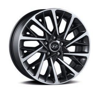
18" alloy wheel Standard on Luxury and Ultimate models