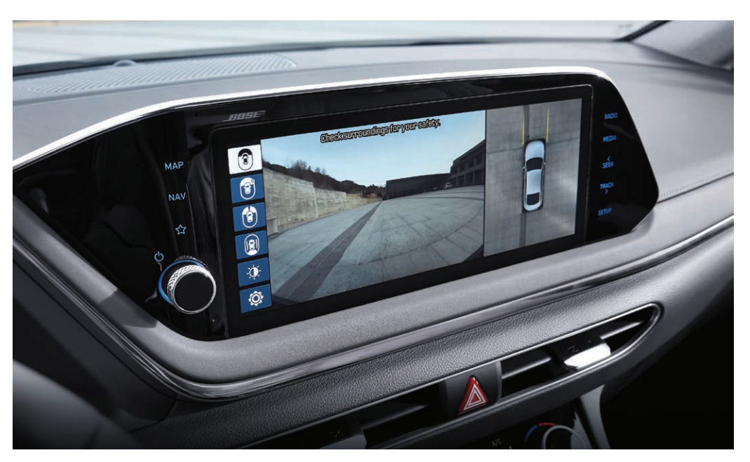
Available 10.25" touch-screen display with Surround View Monitor and navigation system

Standard Apple CarPlay<sup>TMΔ</sup> and Android Auto<sup>TMO</sup> smartphone connectivity let you access your favourite mobile apps — music, maps, messages and more — seamlessly and safely through voice commands and the touch-screen display. Preferred, Sport and Luxury models feature convenient wireless connection, no cable required.