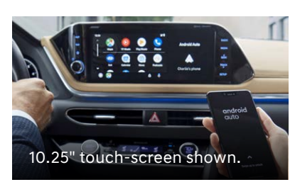
Standard Apple CarPlay™ and Android Auto™ with available wireless connectivity.

Standard Apple CarPlay<sup>TMΔ</sup> and Android Auto<sup>TMO</sup> smartphone connectivity let you access your favourite mobile apps — music, maps, messages and more — seamlessly and safely through voice commands and the touch-screen display. Preferred, Sport and Luxury models feature convenient wireless connection, no cable required.