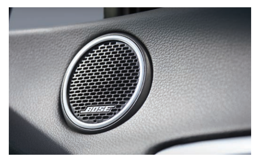
Standard 8.0" touch-screen display Available Bose® premium audio with 12 speakers