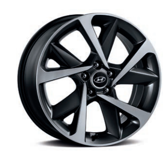
19" alloy wheel Standard on Sport model