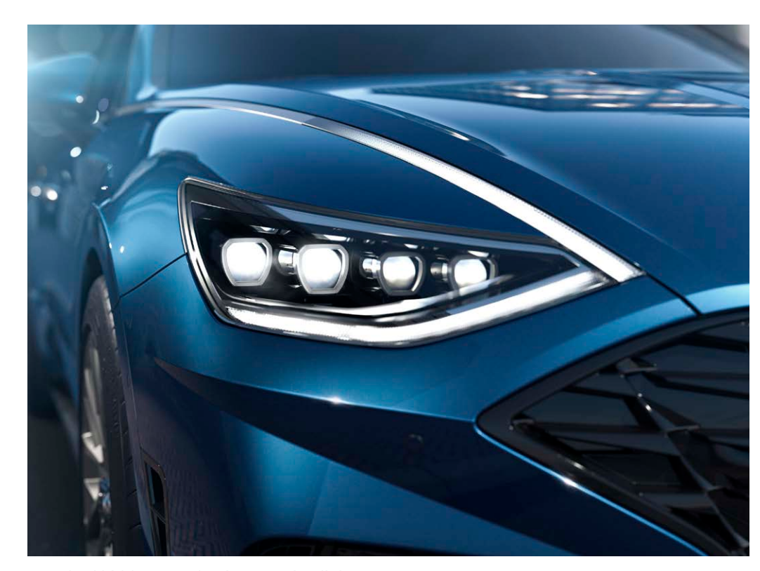
Standard hidden LED daytime running lights

Elevated athletic aesthetics paired with 1.6L Turbo models include sport-designed front and rear bumpers, a glossy black mesh front grille and a chrome twin-tip exhaust outlet.