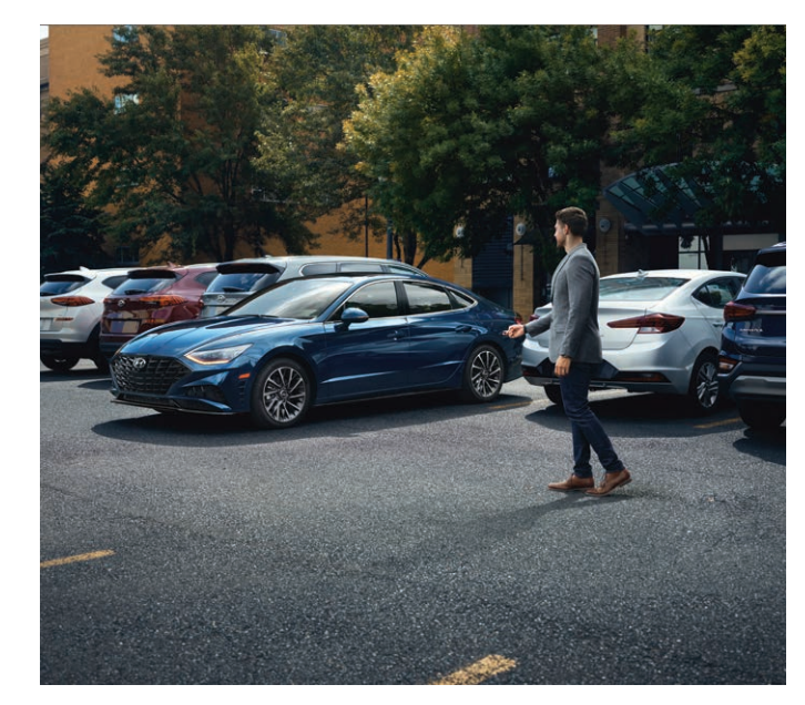
Available Remote Smart Parking Assist

Step inside and access available personalized profile settings for up to three drivers for ultimate convenience. The technology will keep settings for the driver seat and side mirror positions, multimedia, drive mode, Head-Up Display settings and more, all stored and accessible at the press of a button.