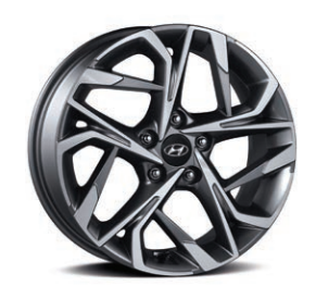
17" alloy wheel Standard on Preferred model