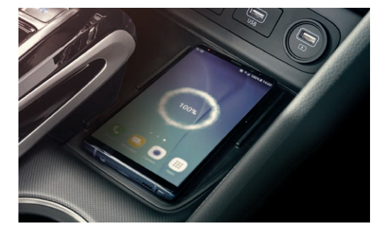
Available interior ambient lighting Available wireless charging pad<sup>▼</sup>