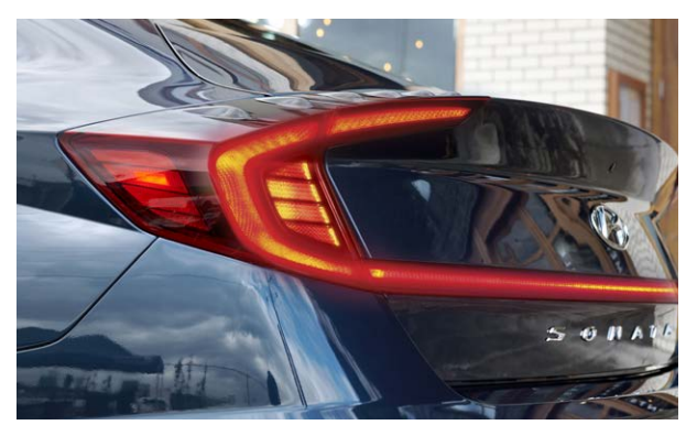
Available 19" alloy wheels Available premium full LED tail lights