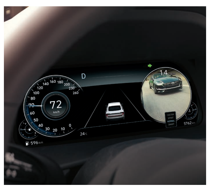
Available 12.3" full digital instrument cluster with Blind View Monitor

The Sonata features the segment-exclusive Remote Smart Parking Assist system<sup>1</sup>. This driver assistance technology allows you to remotely move the Sonata when you are outside of the vehicle, a convenient feature when you have passengers or if you have luggage to load in a tight area. Simply use the key fob to move the Sonata forward or backward, into or out of the parking space.