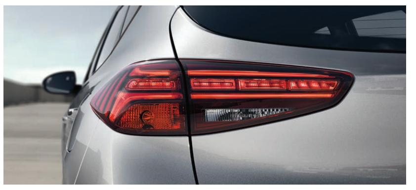
Available LED headlights Available LED tail lights