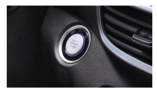
Standard 7.0" touch-screen with Apple CarPlay<sup>™∆</sup> and Android Auto<sup>™◊</sup> Available proximity keyless entry with push-button ignition