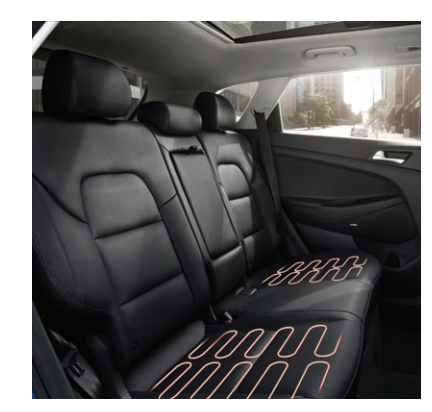
Standard heated front seats Available ventilated front seats Available heated rear seats