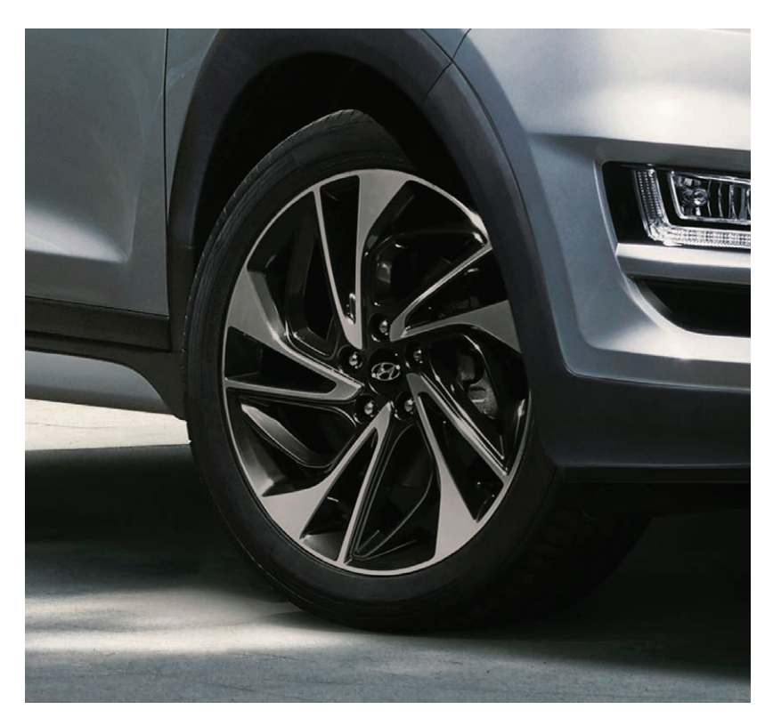
Available 19" alloy wheels