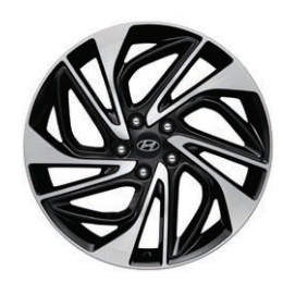
19" alloy wheel Standard on Ultimate model