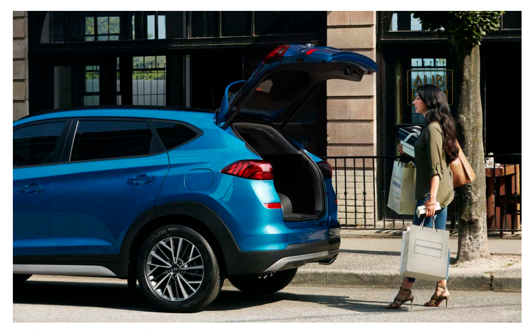
Available Smart Power Liftgate

No need to search for your keys, or kick and shuffle your feet to open the rear liftgate. The available proximity key technology allows you to automatically open the available Smart Power Liftgate and unload your two hands' worth of cargo effortlessly. Load up for your next adventure with 1,754 litres of cargo space when the rear seats are folded down, or split and fold them 60/40 to accommodate longer items and your passengers. Once inside, another feature you will love for its convenience is the available Surround View Monitor that projects a 360° view around your Tucson for easy navigation in tight parking spots.