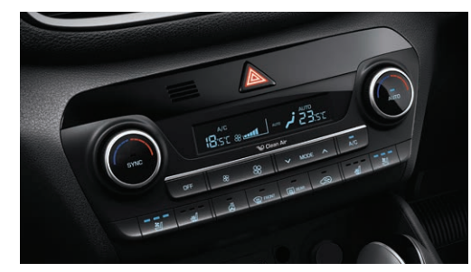
Available 8.0" touch-screen with navigation system and Surround View Monitor Available dual-zone automatic temperature control