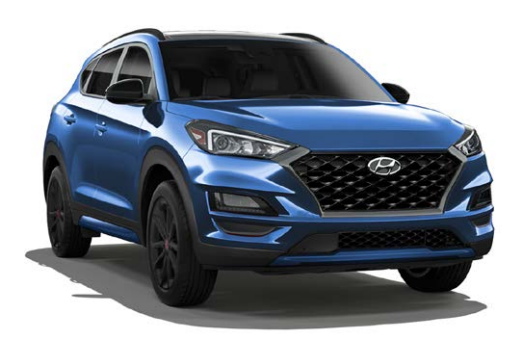
Urban Edition model

The Tucson makes an impressive entrance with its athletic side character line and aggressive, wide stance. Up front, the dominant hexagonal front grille is complemented by stylish and efficient lighting technology — like the available LED headlights with High Beam Assist. The Urban Edition turns heads with features like the glossy black mesh grille and RAYS® 19" alloy wheels.