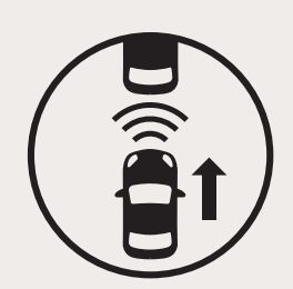
Forward Collision-Avoidance Assist with Pedestrian Detection