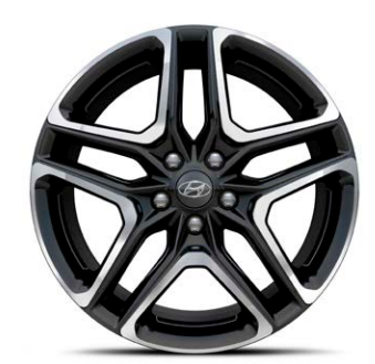
19" alloy wheel