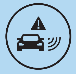
Blind-Spot Collision Warning