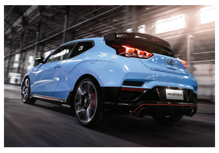
Electronically controlled suspension

The Veloster N provides world-class cornering ability with an electronically controlled mechanical limited-slip differential. This system uses true torque vectoring to intelligently and precisely distribute torque where it's needed most. This increases cornering speed and reduces understeer for enhanced handling agility.