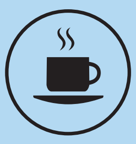
Driver Attention Warning