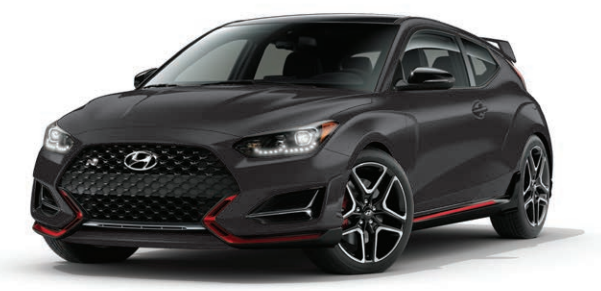
Shooting Star (matte paint)