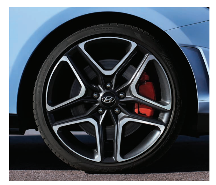
19" alloy wheels with Pirelli high-performance tires

Up front, a wide stance, low centre of gravity and aggressive grille with N badging makes a powerful statement.