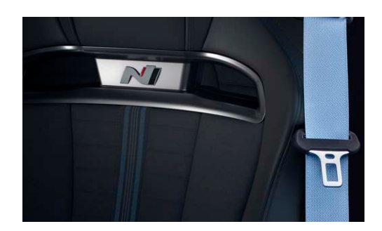
Black cloth and leatherette with Performance Blue seatbelts and accents