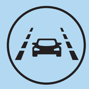
Lane Departure Warning with Lane Keeping Assist