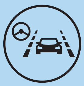
Lane Following Assist