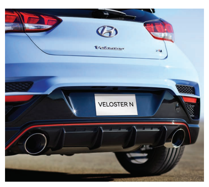
Active sport exhaust

The high-performance 235/35R19 Pirelli P-Zero summer tires were engineered exclusively for the Veloster N. Wrapped around machined finish, lightweight 19" alloy wheels, their tread pattern and nano-composite compound are specifically tailored for optimal grip, lateral stability and stopping power.