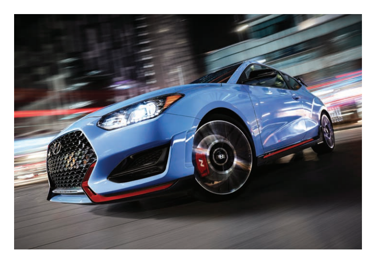
Electronically controlled mechanical limited-slip differential

Choose between six-speed manual transmission with auto rev-matching for quicker and sportier downshifts, or the new N DCT with two separate clutches for increased efficiency, faster shifting and driving convenience.