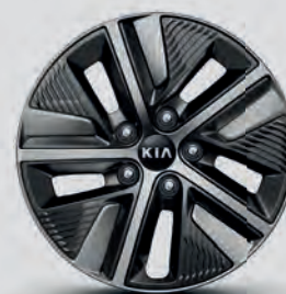
16" alloy wheels