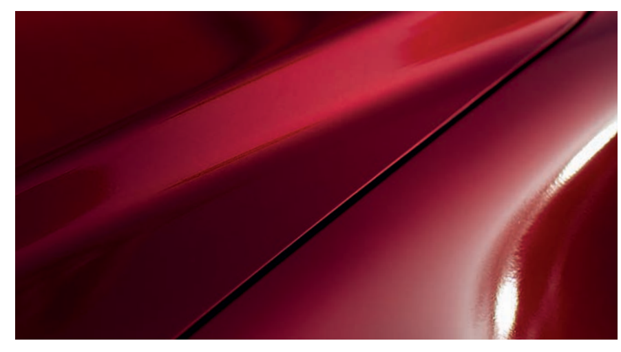
Visit our website to see all the vibrant colour choices available.

Every aspect of our design process is intentional. Including the paint. Before a single drop of colour is applied, master painters first perfect their technique by hand. Ensuring the surface of the Mazda6 has depth and saturation. Illuminating the curves and characteristics of our Kodo design. They apply colour with the precision of highly sharpened senses. Even the machines used to paint the Mazda6 are so well calibrated that they replicate the exact movement of this human technique. Our daring array of lustrous finishes may be the final touch on the Mazda6, but it is the first thing that will catch your eye.