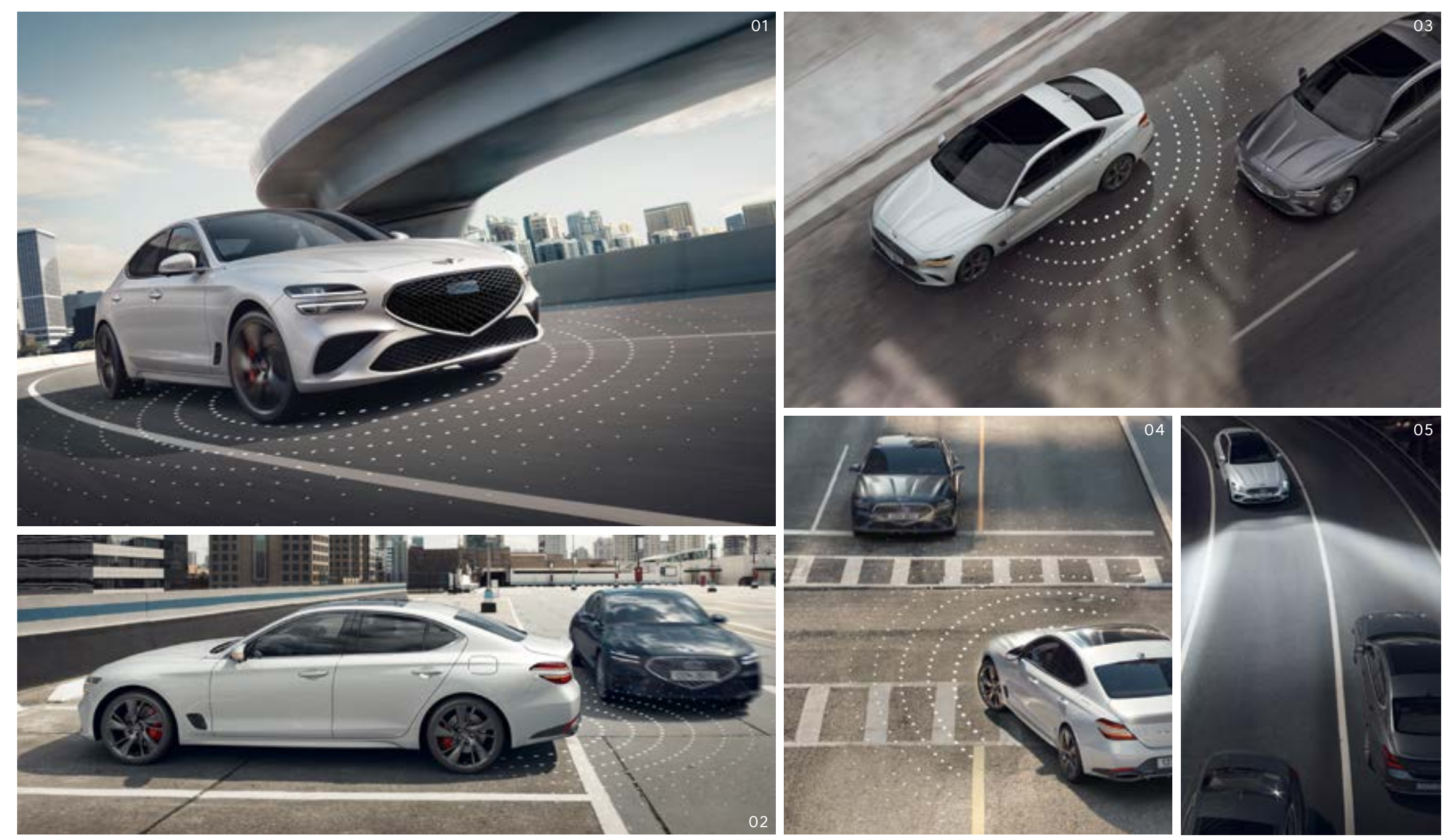
Non-U.S. models with optional features shown

Backing out of a parking space and wondering if it's safe? The new G70 comes equipped with sensors that help detect vehicles approaching from the side while exiting a parking space in reverse gear. If necessary, emergency braking is applied to help avoid a collision with cross traffic from the rear.<sup>12</sup>