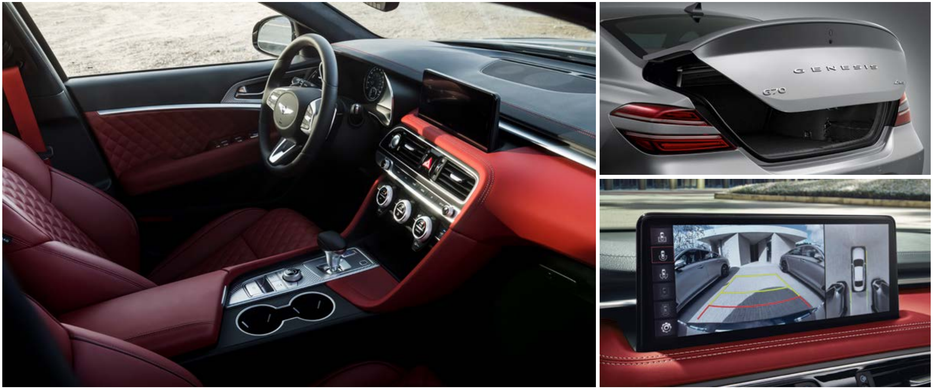
Non-U.S. model with optional features shown

A color 8" screen within the gauge cluster lets you customize the driving vitals being displayed, while an available Heads-up Display projects speed, navigation and safety alerts onto the 3.3T's windshield in fighter-jet fashion. Time to park? An available Surround View Monitor helps navigate tight spaces by displaying multiple angles of your car's perimeter.