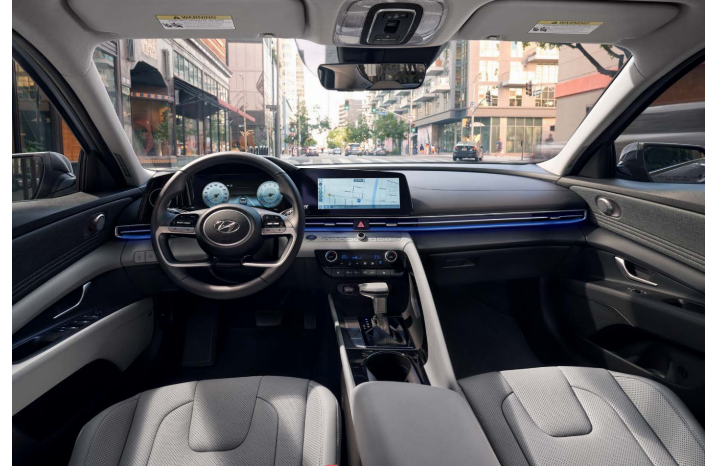
Ultimate model with Tech package shown. May not be exactly as shown.

A number of available features are customizable to your liking, including the 8-way power driver's seat, the interior ambient lighting with 64 colour choices and the dualzone climate control. You can even adjust the depth of the cup holders to better fit your favourite coffee cup or extra-tall water bottle.