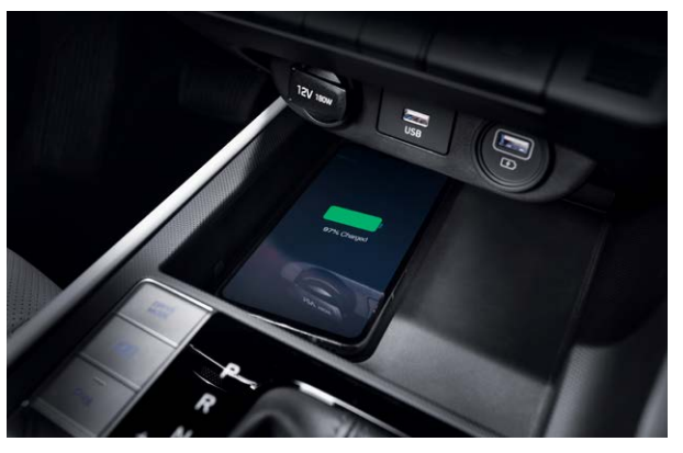
Available wireless charging pad*