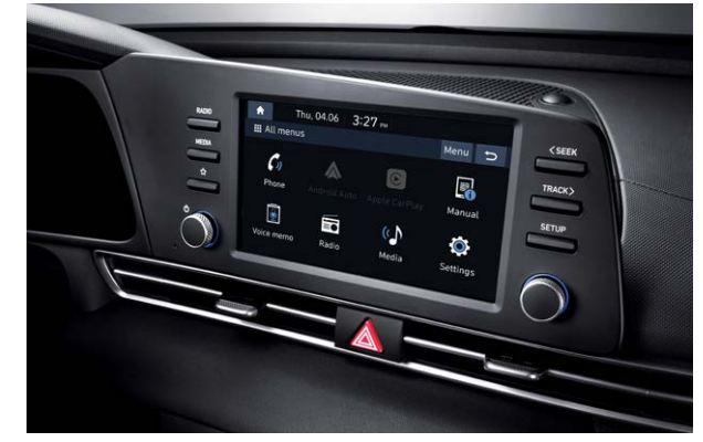
Standard 8.0" touch-screen display