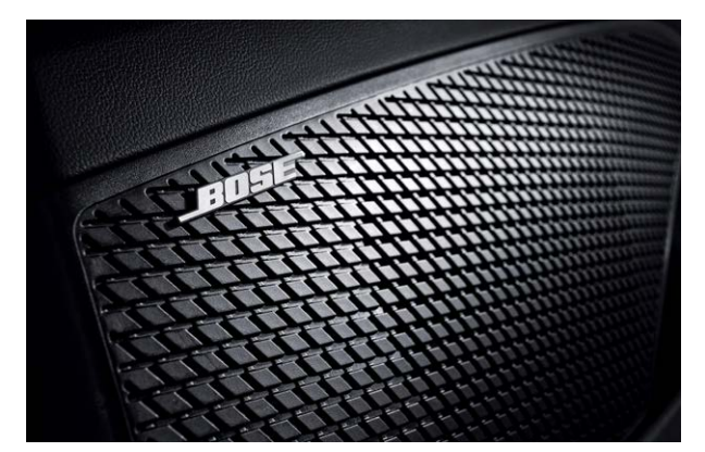
Available Bose® premium sound system