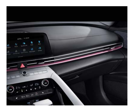
Available interior ambient lighting (64 colour choices)