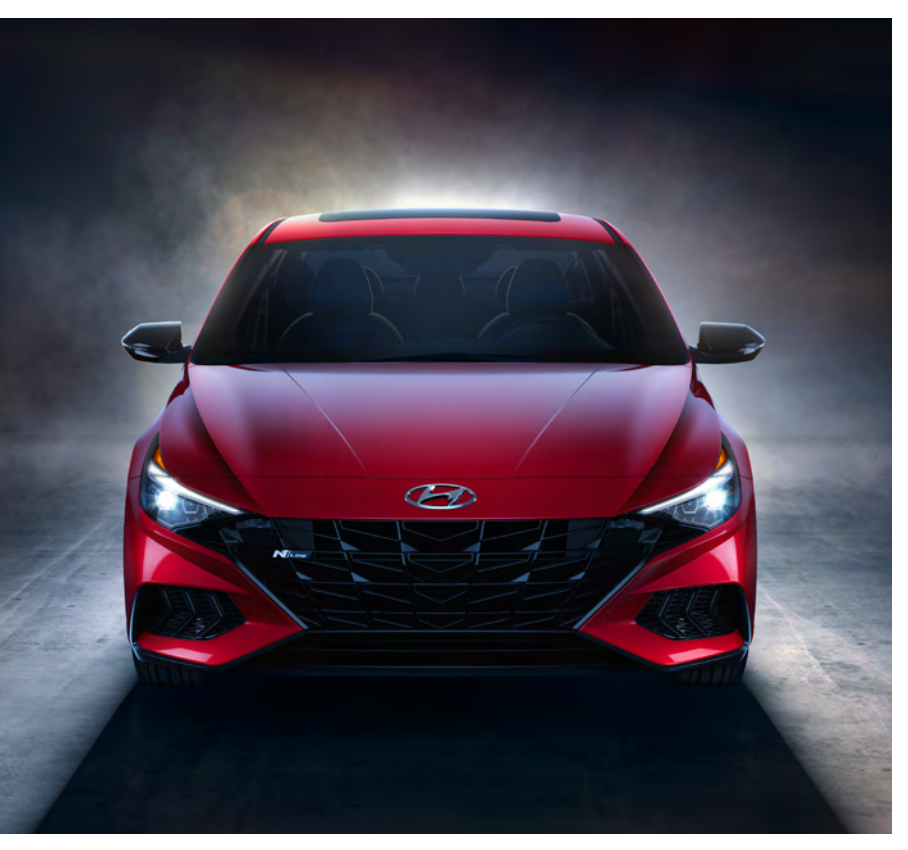
N Line front fascia and glossy black grille with emblem

N Line takes the ELANTRA's sporty design and pushes the limits even more. From its glossy black grille and 18" alloy wheels, to the chrome twin-tip exhaust, the ELANTRA N Line is infused with N-inspired style throughout.