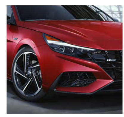
LED daytime running lights and LED headlights