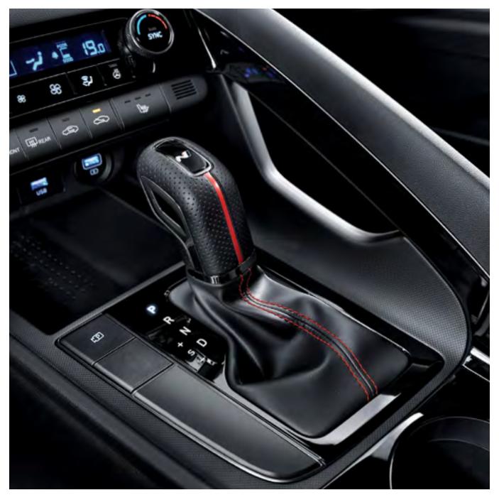
7-speed Dual Clutch Transmission The ELANTRA N Line features a quick-shifting seven-speed Dual Clutch Transmission with steering wheel-mounted paddle shifters.