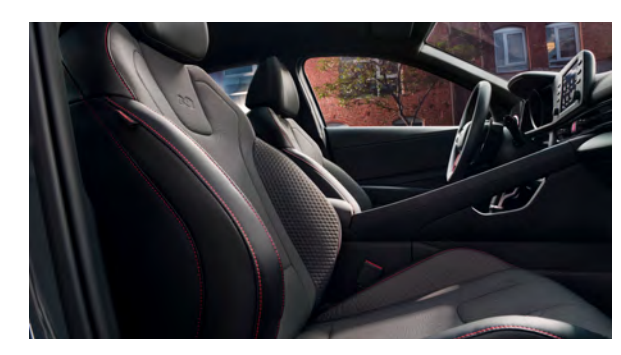
N Line sport seats with red stitching