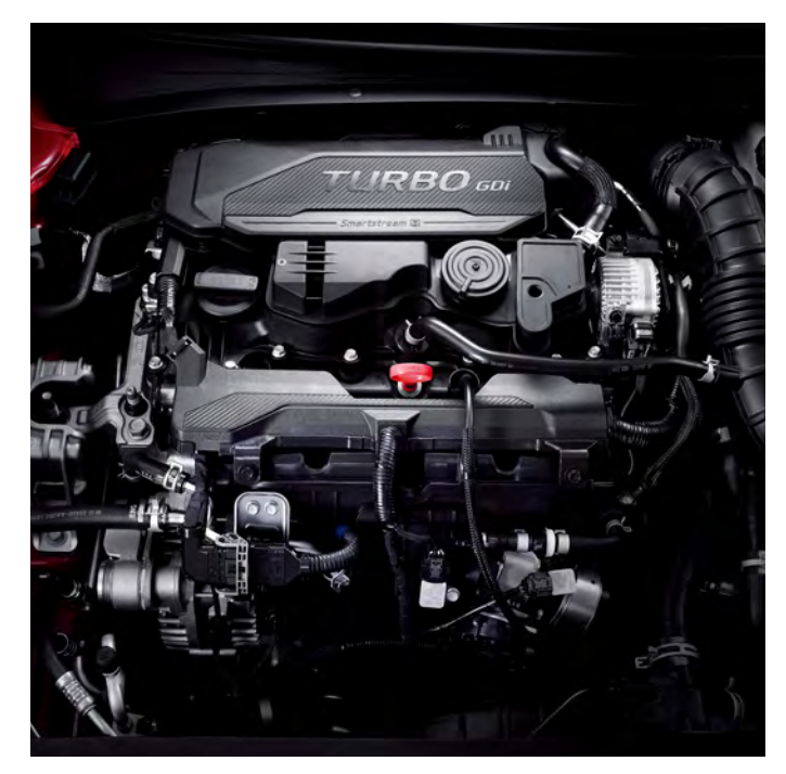
Standard Smartstream 1.6L Turbocharged GDI engine The ELANTRA N Line's Smartstream 1.6T GDI engine delivers 201 horsepower and 195 lb.-ft. of torque.

The ELANTRA N Line delivers an engaging and fun drive with upgraded performance features that elevate on-road dynamics.