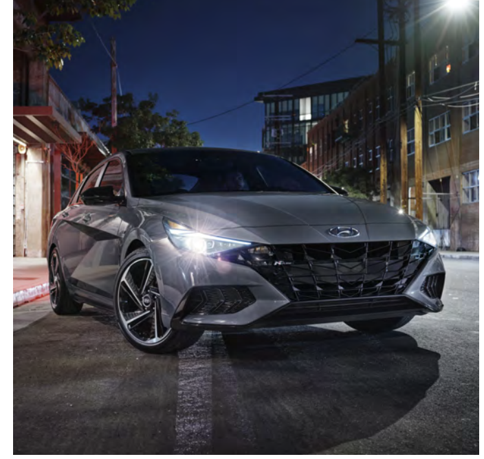
Sport-tuned suspension and steering The sport-tuned suspension with multi-link rear independent suspension is designed to elevate on-road dynamics, responsiveness and feel — which makes cornering a true pleasure.