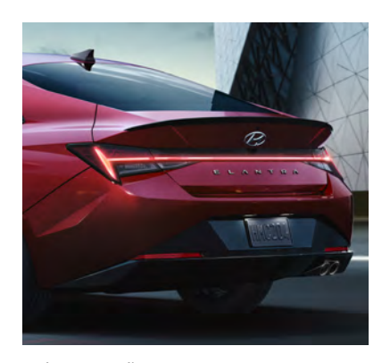
N Line rear spoiler Full LED tail lights