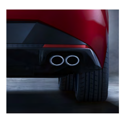
N Line rear fascia with twin-tip exhaust