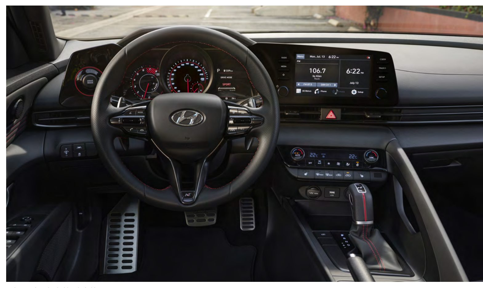
N Line steering wheel with red stitching

The driver-oriented wraparound design combines comfort with N-inspired elements like red stitching and brushed aluminum pedals.