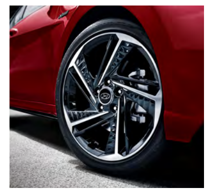
N Line 18" alloy wheels