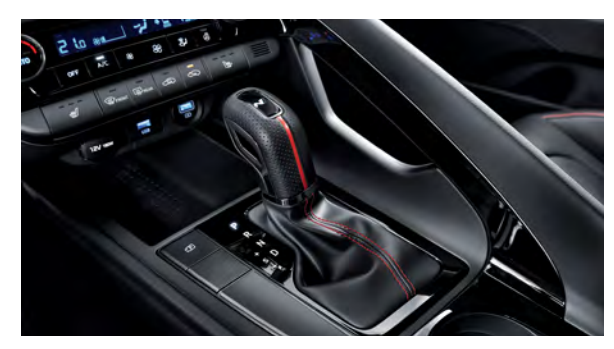
N Line shifter with red stitching and emblem