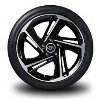
18" alloy wheel