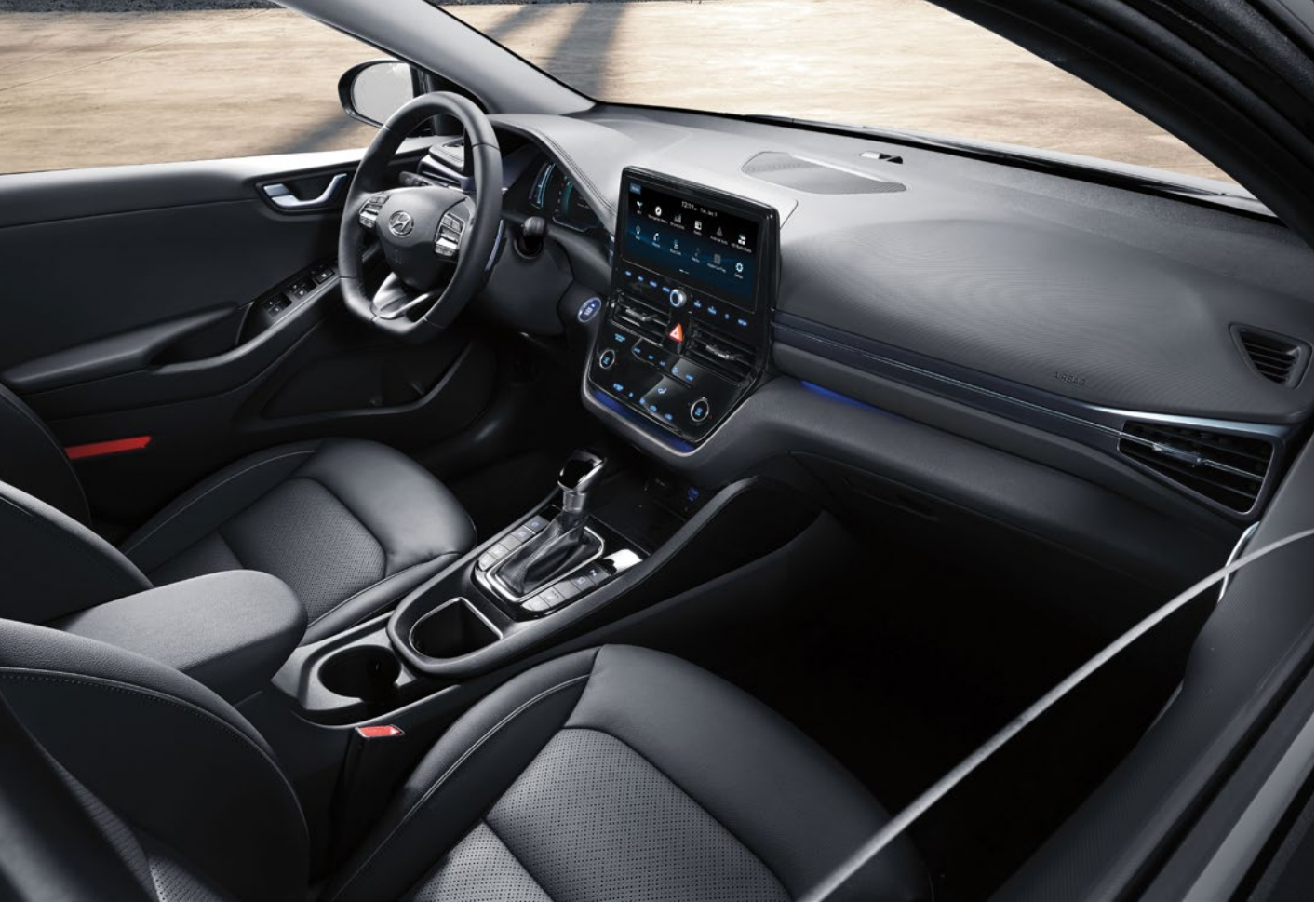
IONIQ Hybrid Ultimate model shown. May not be exactly as shown.

Set the mood with available interior ambient lighting — illuminating the cabin in blue for an added element of style and sophistication. With your comfort as priority, the standard heated front seats and available heated rear seats and heated steering wheel keep you warm on chillier days, while the available power sunroof lets you embrace an outdoor breeze during warmer seasons.