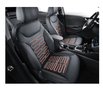
Standard heated front seats and available heated rear seats