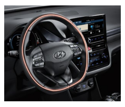
Available heated steering wheel