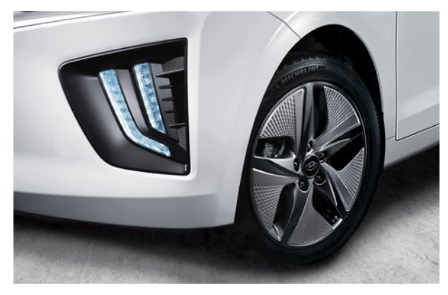
Available 17" eco alloy wheels (available on Hybrid powertrain only)