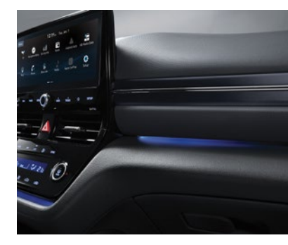
Available interior ambient lighting (single colour — blue)