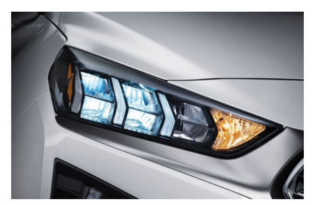
Available LED headlights

An aerodynamic design that marries form with function, the IONIQ's striking coupe-like silhouette creates a powerful first impression. Subtle details like the mesh-type grille with active air shutters that open and close enhance driving dynamics and efficiency.