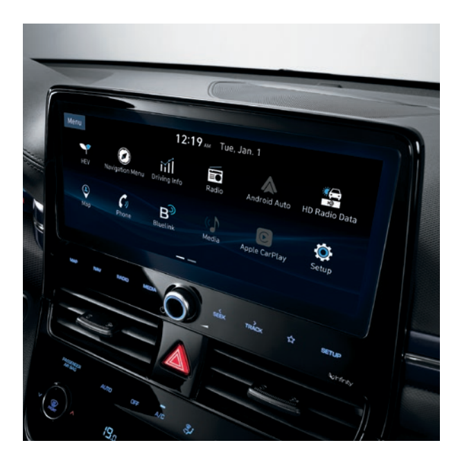
Available 10.25" touch-screen display with navigation system

Shuffle through your songs and listen to your favourite playlist with the impressive sound quality of the available 8-speaker harman/kardon® premium audio system with Clari-Fi™ music restoration technology to help your compressed audio files sound clearer and crisper. And as your smartphone battery starts to get low, simply place it on the wireless charging pad , no connecting cord required.