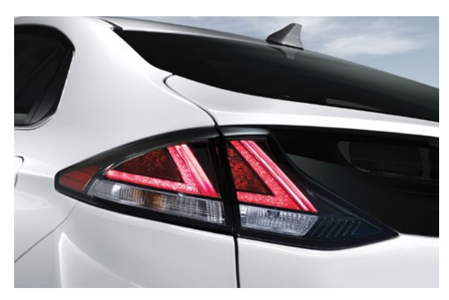
Available LED tail lights