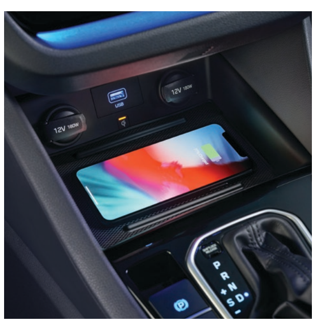
Available wireless charging pad ▼