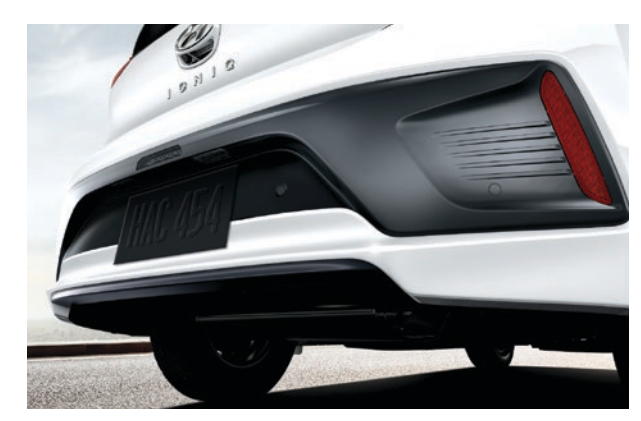
Standard two-tone bumper