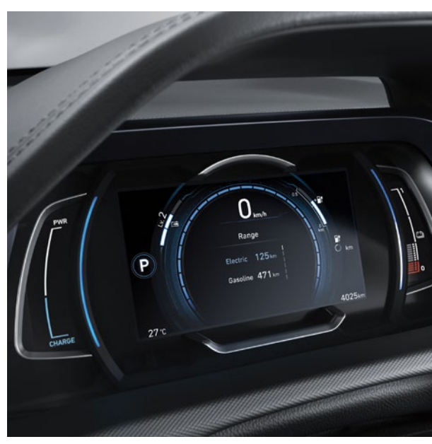
Available 7.0" colour LCD instrument cluster