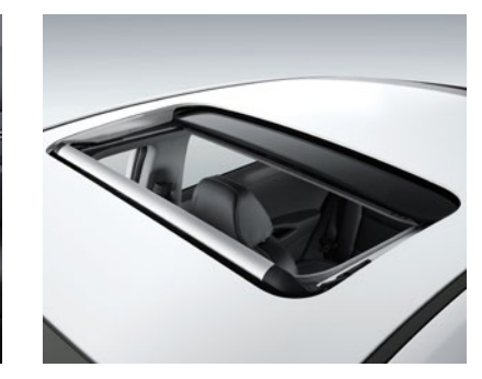
Available power sunroof