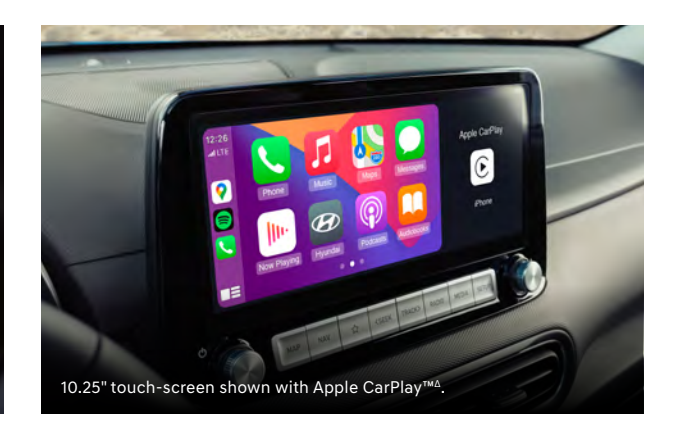
Standard Apple CarPlay {}^{\scriptscriptstyle{\rm TM\Delta}} and Android Auto {}^{\scriptscriptstyle{\rm TMO}} with available wireless connectivity