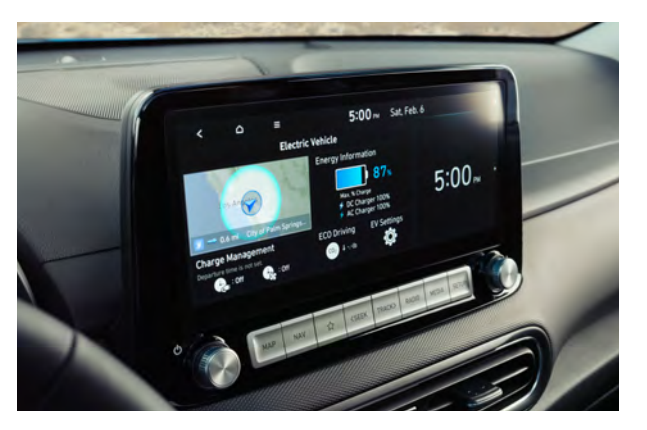
Available 10.25" touch-screen with navigation system