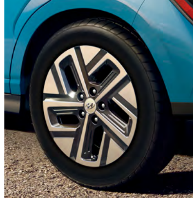
Standard 17" alloy wheels