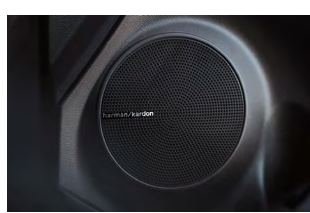
Available harman/kardon® premium audio system