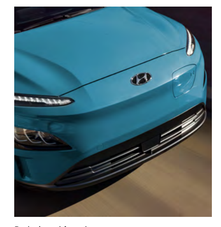
Redesigned front bumper