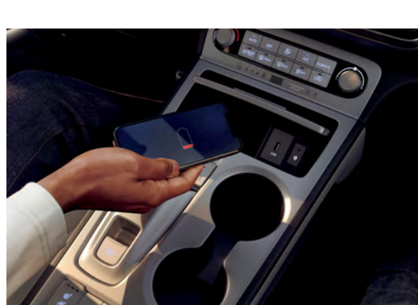
Available wireless charging pad<sup>▼</sup>