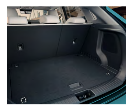
Up to 1,296 litres of cargo capacity with rear seats folded down.