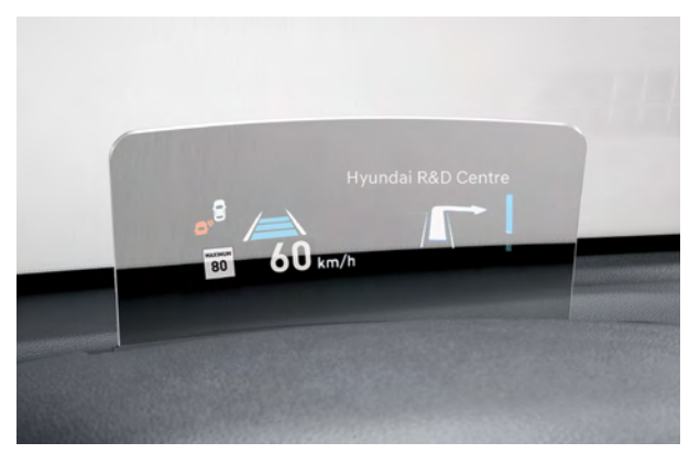
Available head-up display