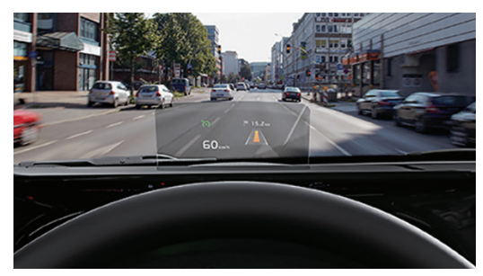
Heads-up display (HUD)<sup>1</sup> subtly projects key driving information on a secondary screen above the steering wheel.