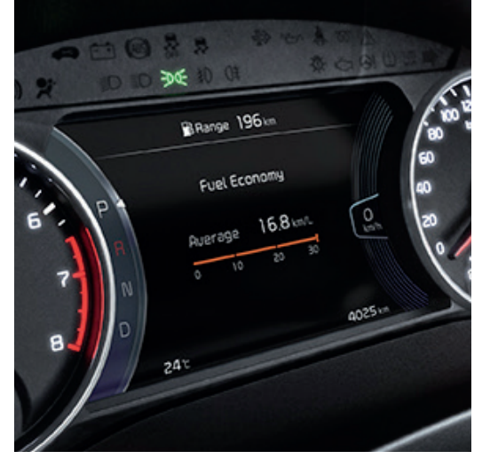
7" TFT LCD supervision cluster <sup>1</sup> provides you with vital driving info, while you stay focused on the road.