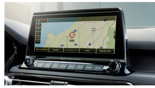
10.25" multimedia interface <sup>1,4</sup> with integrated touch-screen navigation.