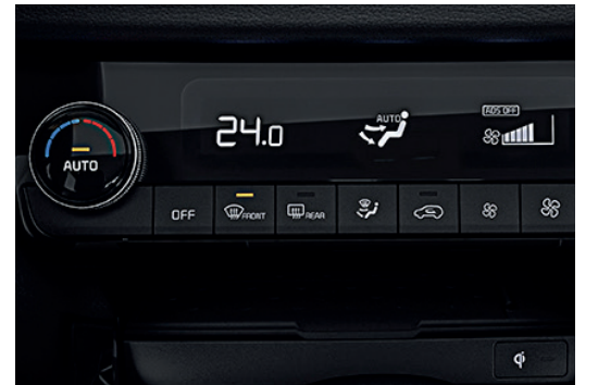
Automatic climate control<sup>1</sup> lets you set your ideal cabin temperature.

The modern cabin has a surprising amount of interior space for both passengers and cargo, while offering comfortable seating and tasteful appointments for everyone inside.