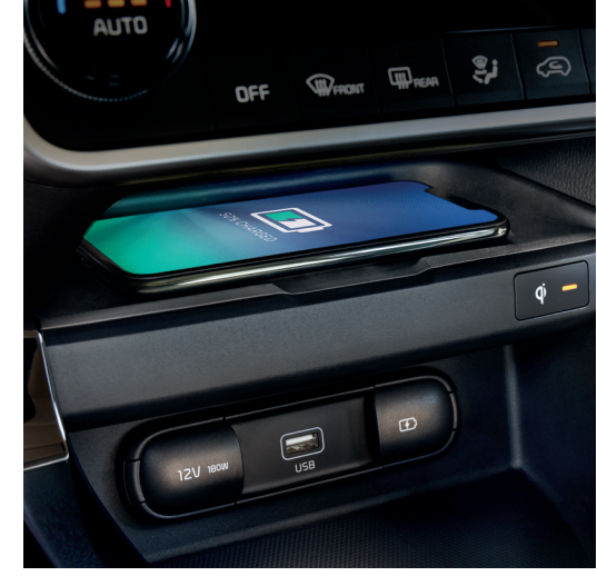
Wireless charging <sup>1,3</sup> keeps your smartphone fully charged while you're on the road.