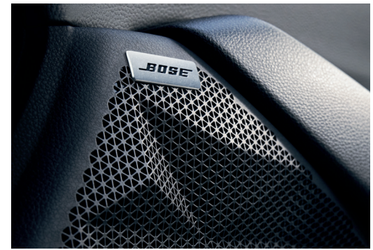
Bose premium audio <sup>1,10</sup> delivers crystal clear and balanced sound.