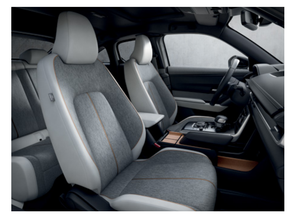
Modern Confidence<sup>1,2</sup> interior color scheme—Light Gray fabric inserts with Pure White leatherette trim