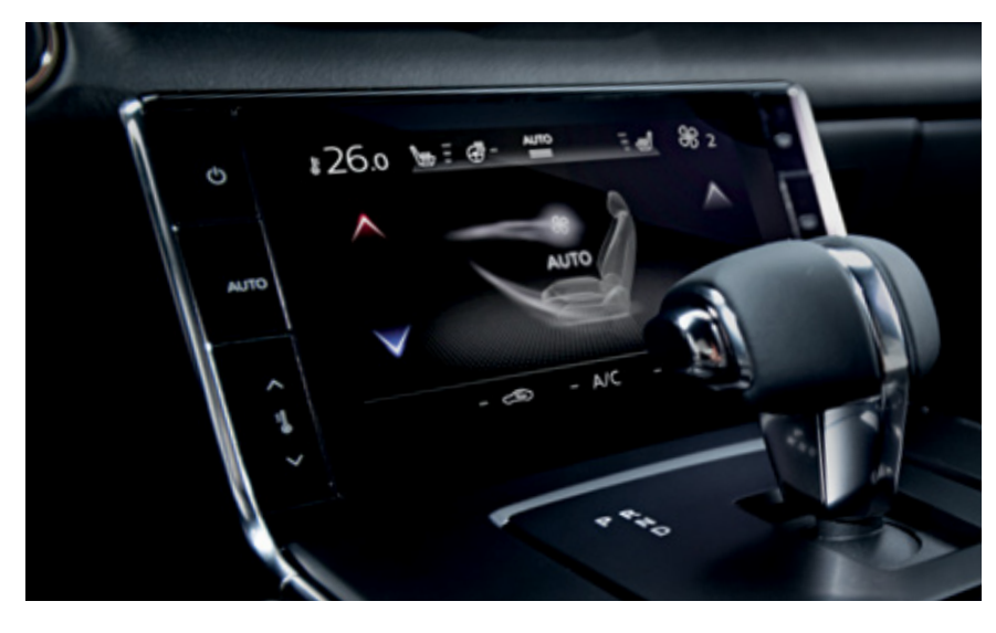
Standard touchscreen automatic climate control