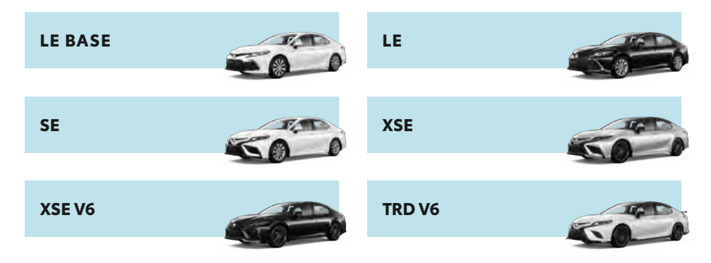
AWD: Specifications & Features