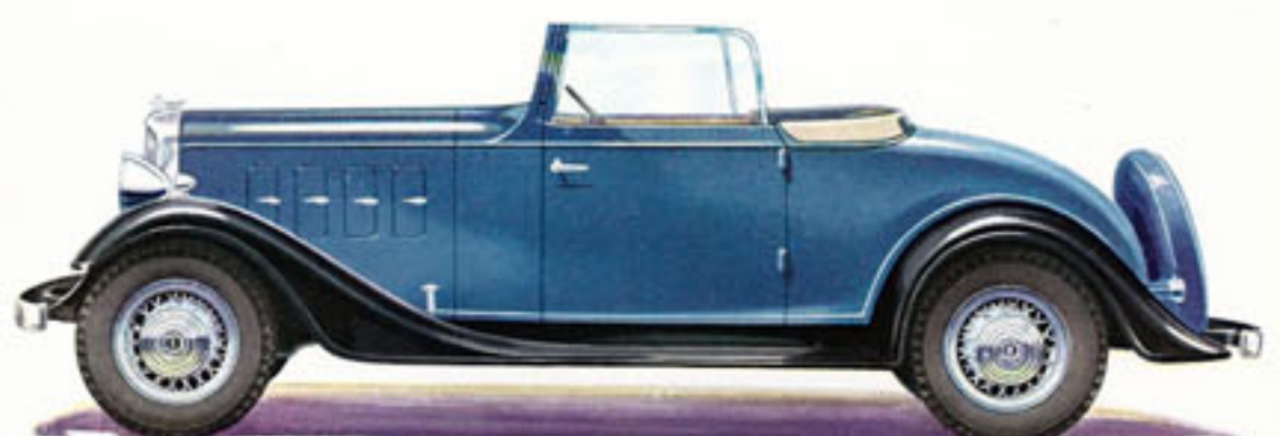
The TERRAPLANE "8" CONVERTIBLE COUPE

Two or Four Passengers • • 94 Horsepower • • 113" Wheelbase A large, comfortable two passenger rumble seat, or a roomy package compartment suitable for luggage, sample cases, etc., is provided in the rear.