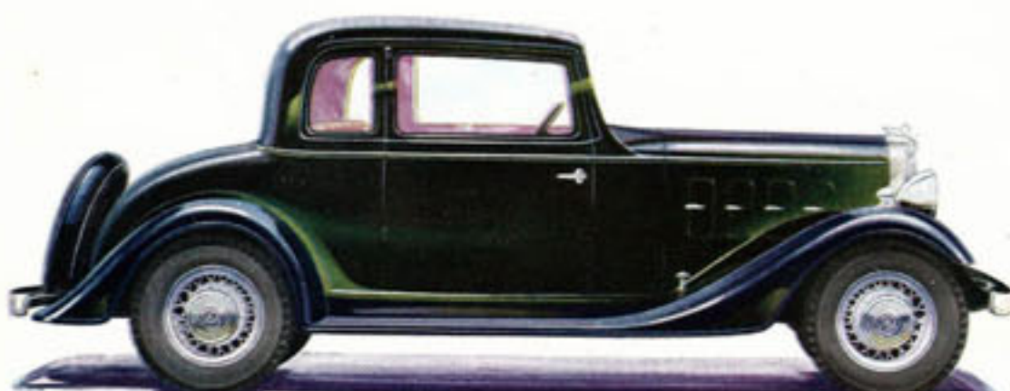
The TERRAPLANE "8" COUPE

Four Passengers • • 94 Horsepower • • 113" Wheelbase With top up, a roomy, comfortable coupe insulated against the weather. Two passenger rumble seat in the rear.