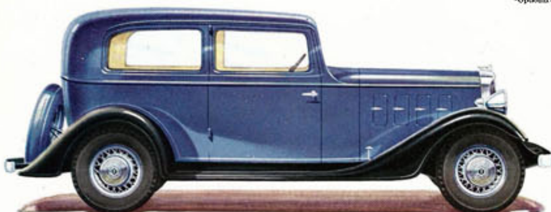
The TERRAPLANE "8" COACH

Five Passengers • • 94 Horsepower • • 113" Wheelbase Equipped with two wide doors and four large windows. Especially practical for families with small children.