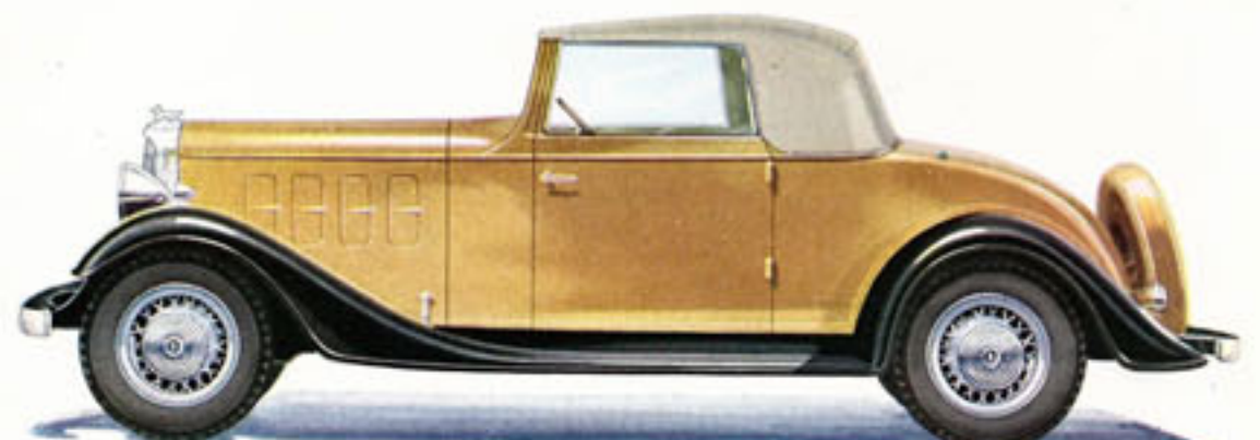
The TERRAPLANE "8" CONVERTIBLE COUPE

Five Passengers • • 94 Horsepower • • 113" Wheelbase Equipped with two wide doors and four large windows. Especially practical for families with small children.