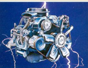
4.3 Liter Vortec V6 Gasoline Engine