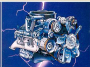
5.0 Liter V8 Gasoline Engine