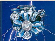
6.2 Liter V8 Diesel Engine