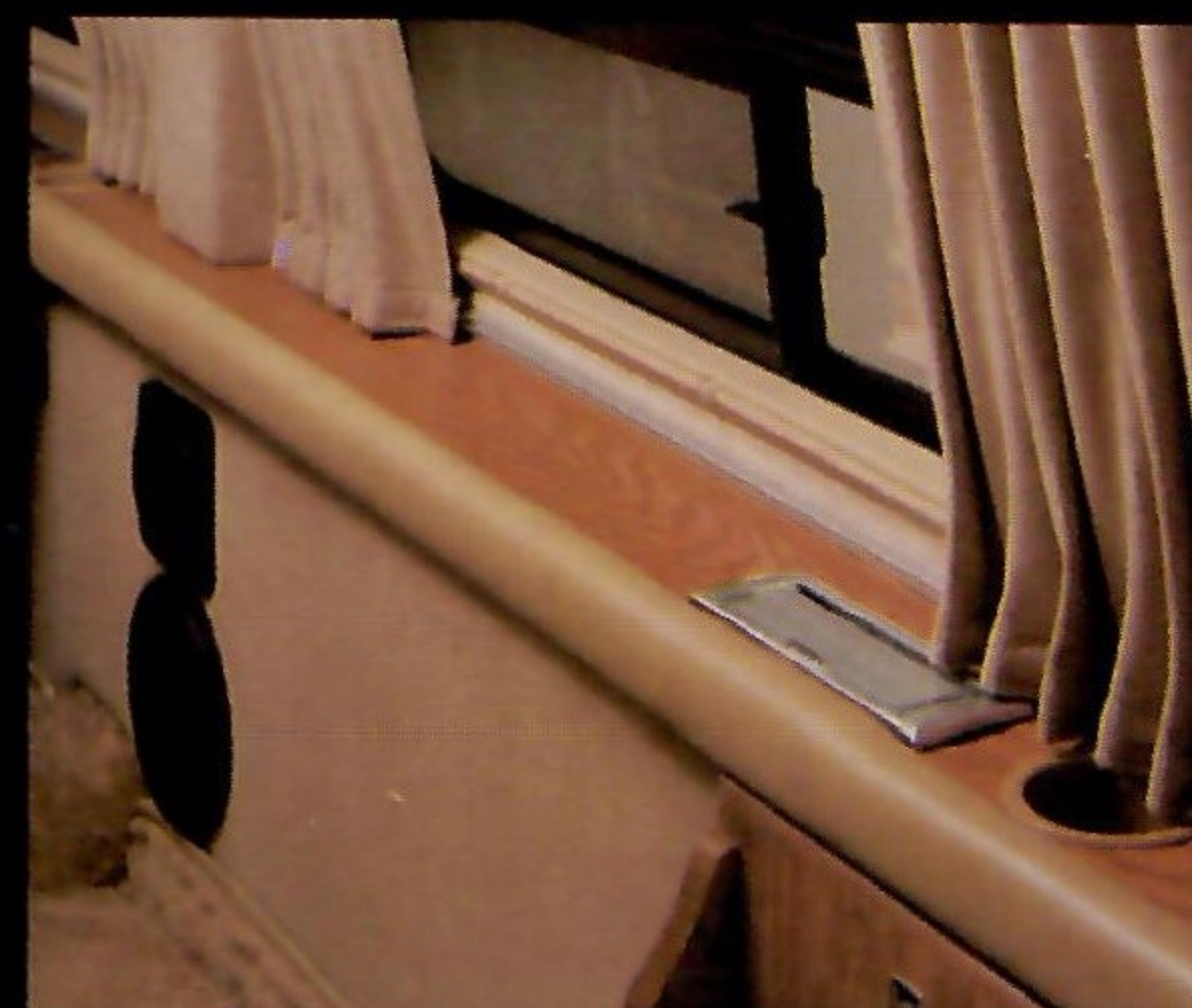
Full-length solid oak side rail with vinyl/foam padded edge, built-in covered cigarette lighter, ashtray and beverage holder (Standard on GTL).