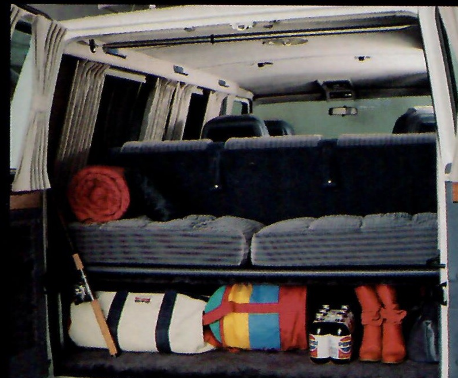
GTL Seville Model with bed extender† in down position makes extra large, comfortable bed when sofa is reclined. Cushions can be removed for tailgating.