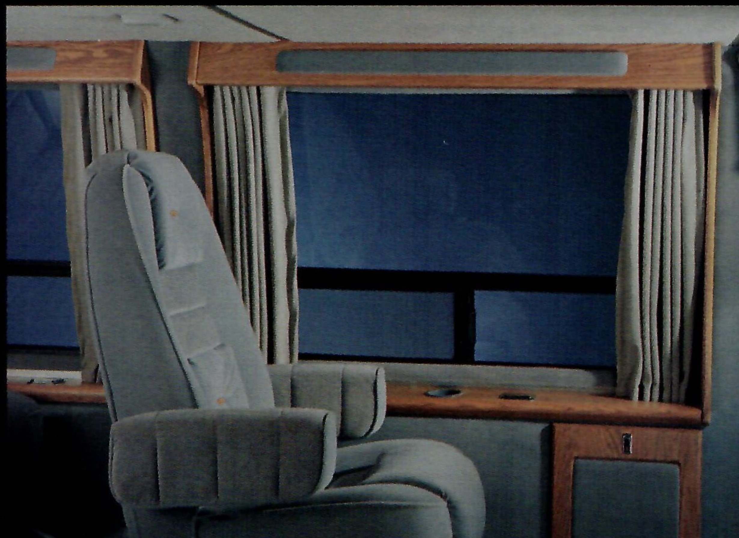
Solid oak side and overhead panels - Solid oak window sill beam has built-in beverage holder and ashtray - "Glide Track" drapery tracks - Drapes slide to cover entire window. Also shown is the video tape player compartment. (Video tape player not included.)

windows ■ Anodized aluminum running boards ■ Ladder ■ Luggage rack with built-in TV antenna ■ Continental spare tire kit with stainless steel tire band and security spare tire lock ■ Full custom paint. The LXT is the greatest buy on worth in the industry.