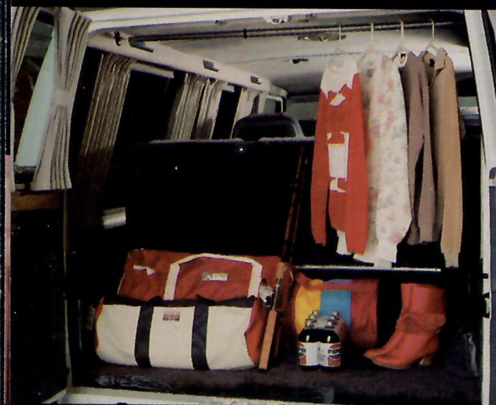
GTL Seville Model with bed extender† in up position for maximum storage. Overhead clothes bar is standard.