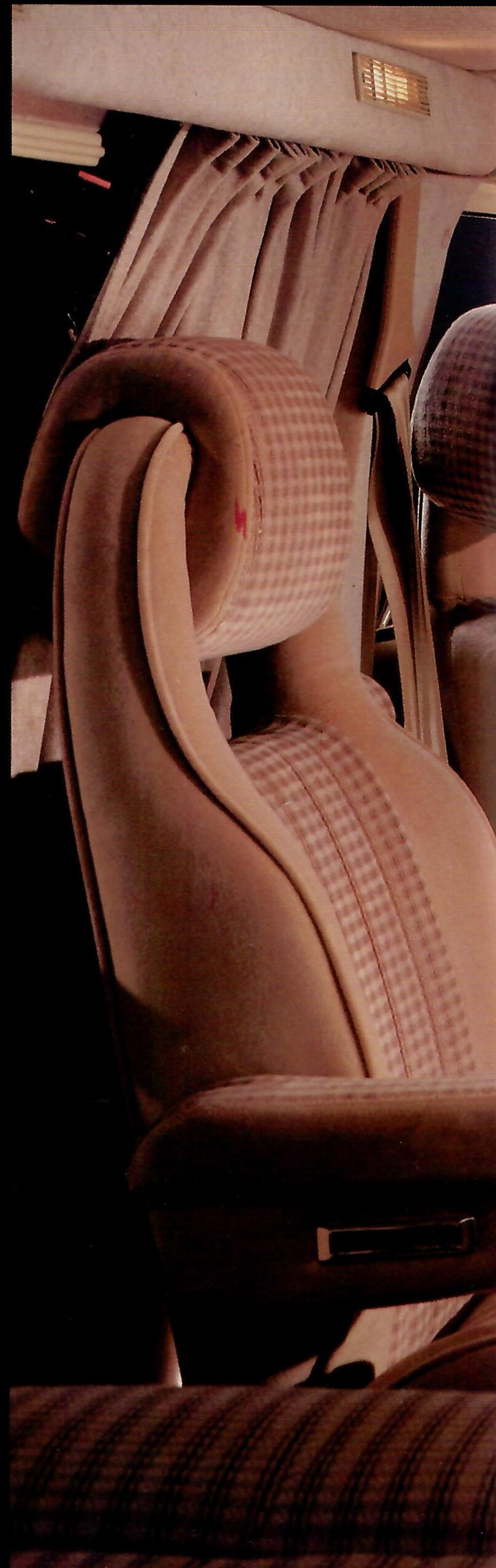
Exclusive custom designed Trans-Aire overhead heat and air conditioning with built-in courtesy lights, clothes bar and color TV, speakers for TV are mounted in the wall in front of the sofa.