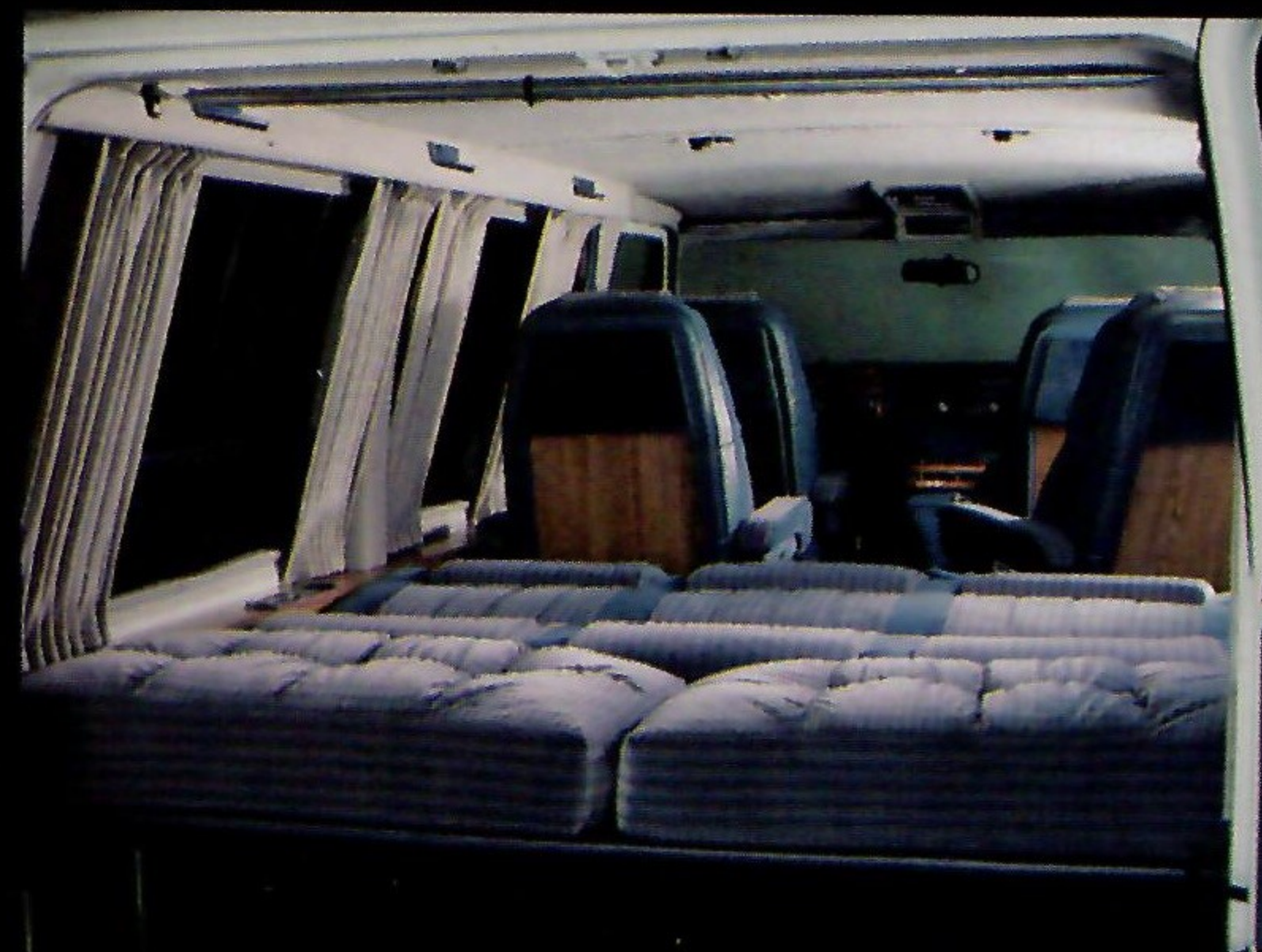
Rear sofa in reclining position. Deep, plush style sofa and cushions let you relax in total comfort. Rear clothes bar is standard.