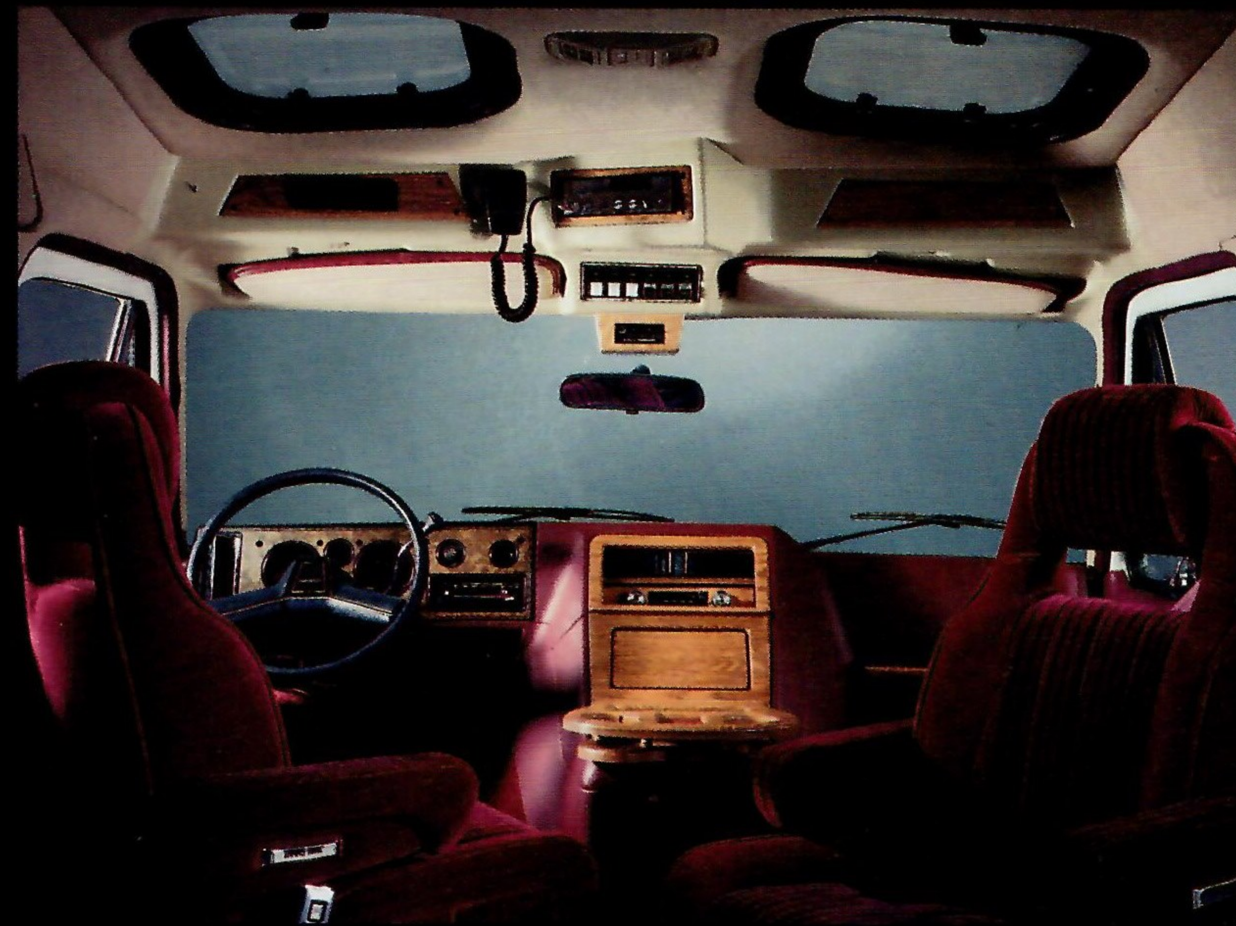
Trans-Aire's newest creation, the exciting XRT Limited Raised Sport Roof. The fit and finish and attention to detail will please the most discriminating. (Sun roof optional) All other features shown are standard.

molded lighted convenience center with ash tray and beverage holder in side door ■ Contoured angle Vista Bay windows with curved glass ■ Low mount spare tire carrier and Continental spare tire kit with stainless steel tire band and security spare tire lock ■ Custom color/coordinated paint scheme ■ Lighted aluminum running boards ■ Rear ladder ■ Luggage rack with built-in TV antenna.