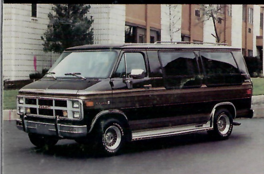
Trans-Aire SST with standard custom paint.