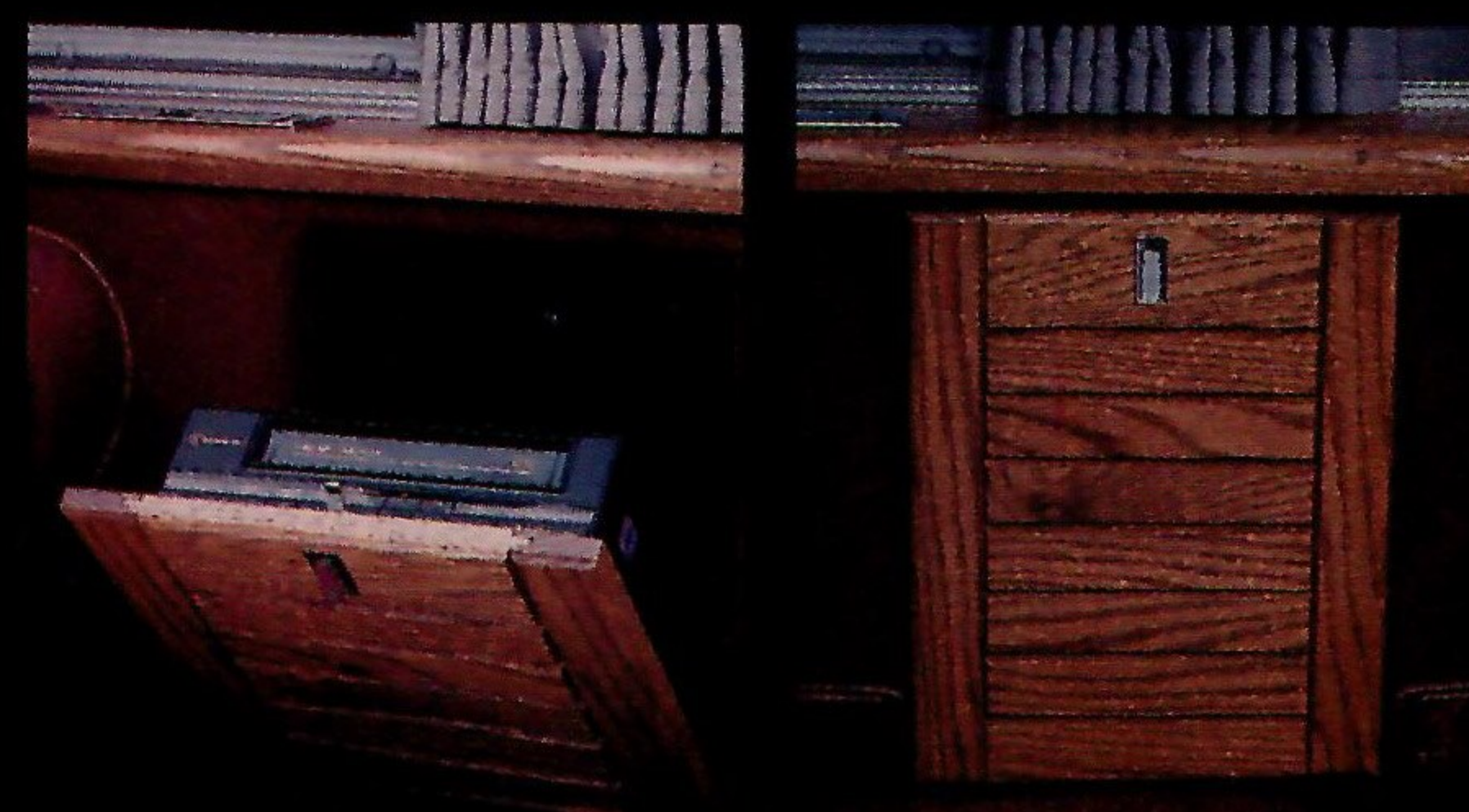
Recessed video tape player compartment (standard) in wall behind driver's seat. Oak door is hinged on bottom and conceals the video tape player. (Video tape player is optional)