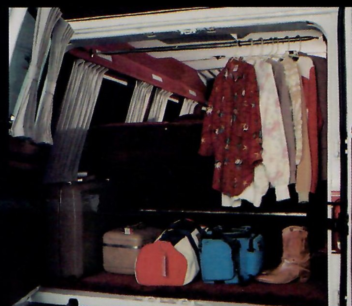
Bed extender in up position for maximum storage. (Bed extender optional on LXT.)