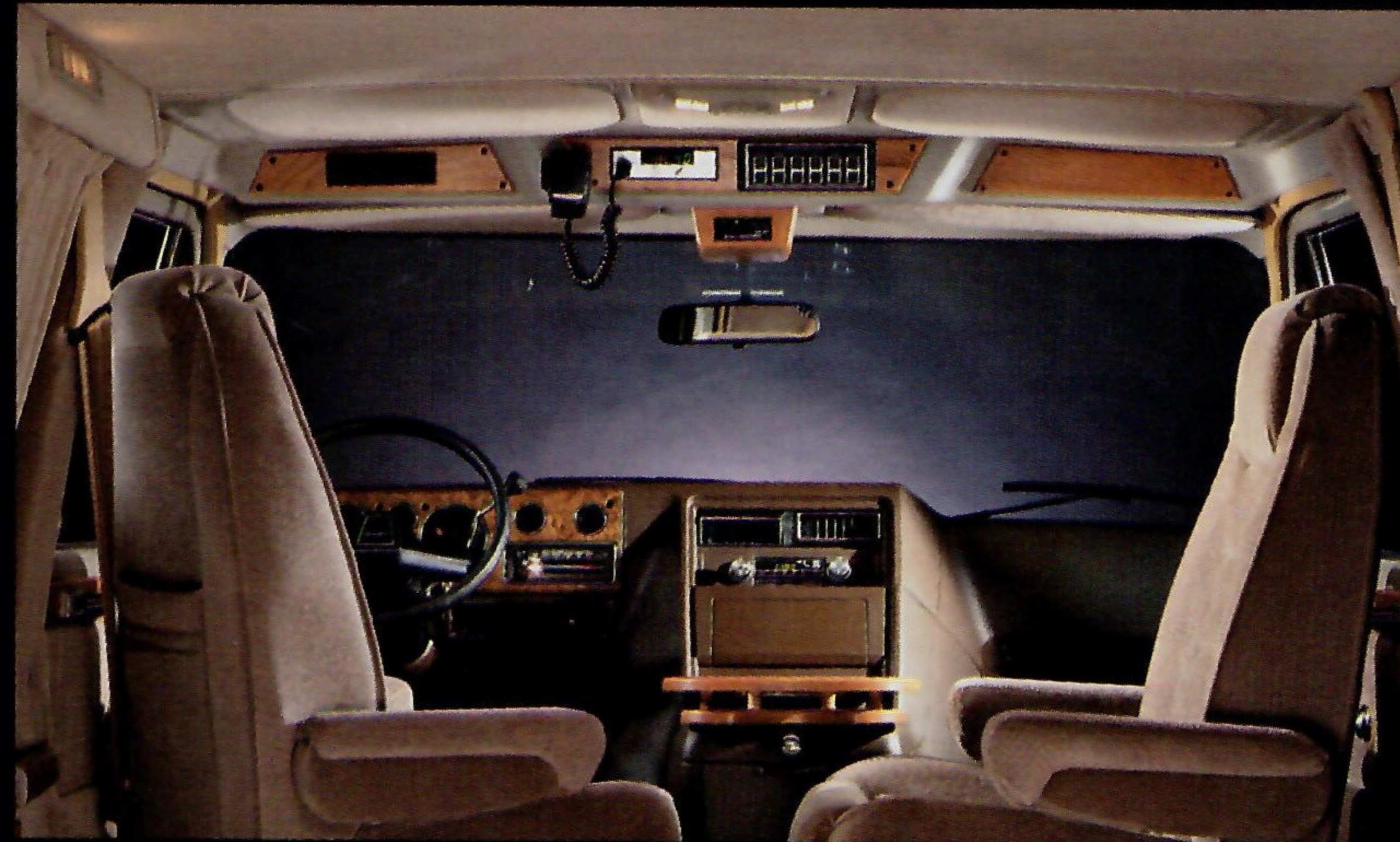
Full-width overhead console with built-in oak inserts, switch control panel for interior lighting system, optional 40 channel CB, equalizer with power booster and radar detector.

in both sides. Standard exterior features include: ■ Custom color/coordinated paint scheme ■ Contour angle Vista Bay windows with curved glass ■ Anodized aluminum running boards ■ Ladder and luggage rack with built-in TV antenna ■ Low mount tire carrier ■ Continental kit with stainless steel tire band ■ Spare tire and security lock.