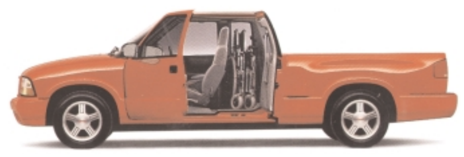
Sonoma Extended Cab with 3rd Door 2WD

Recovery Hooks Mounted right to the frame for durability, the recovery hooks can pull or be pulled without damaging the front of the vehicle. Standard on 4WD.