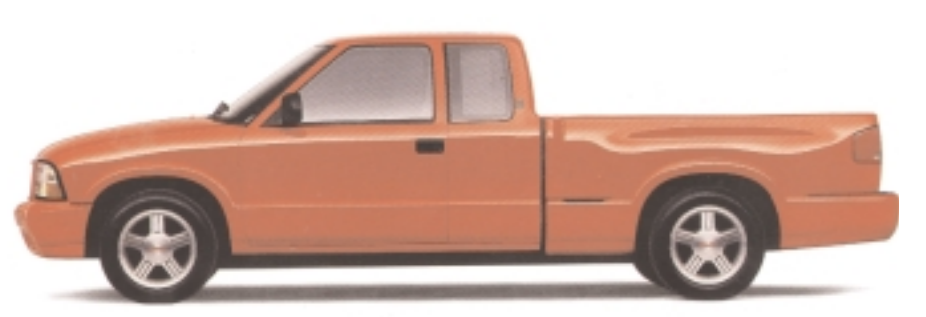
Sonoma Extended Cab 2WD<sup>2</sup>