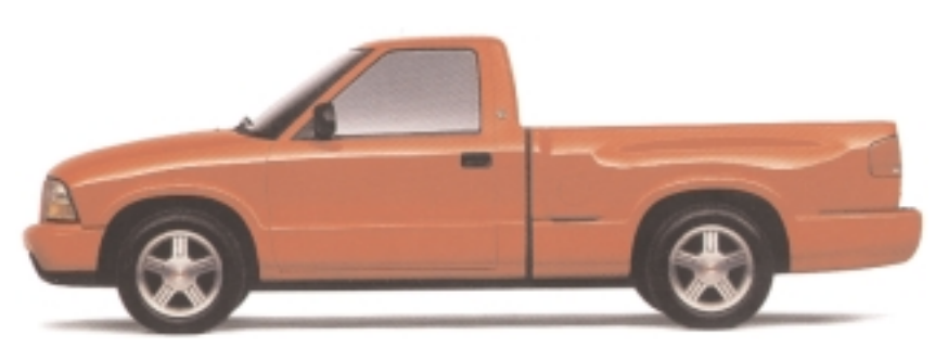
Sonoma Regular Cab 2WD<sup>2</sup>

Cab Configurations Not everyone is configured the same way. Neither is Sonoma. You can choose Extended Cab with available 3rd door for increased interior carrying capacity,<sup>3</sup> Extended Cab, or Regular Cab.